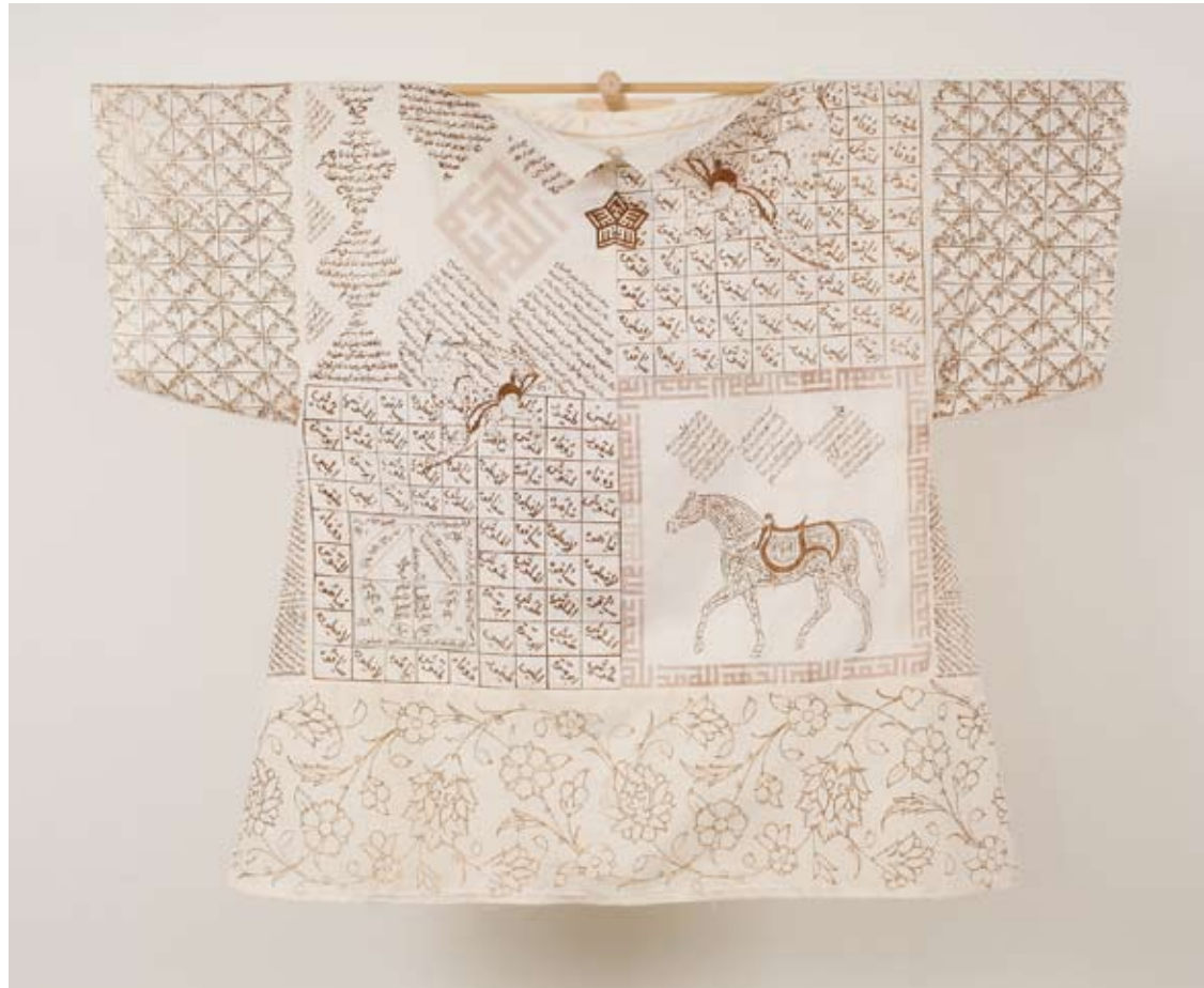
Suit of Armor , Silkscreen on muslin, dimensions variable, 2010