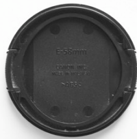
Lens Cap, Interior