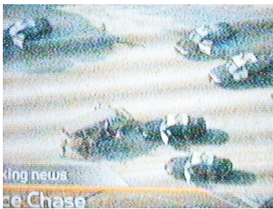
TV Car Chase, 3

Artist's Reception: Saturday, January 10, 2009 6 – 9pm