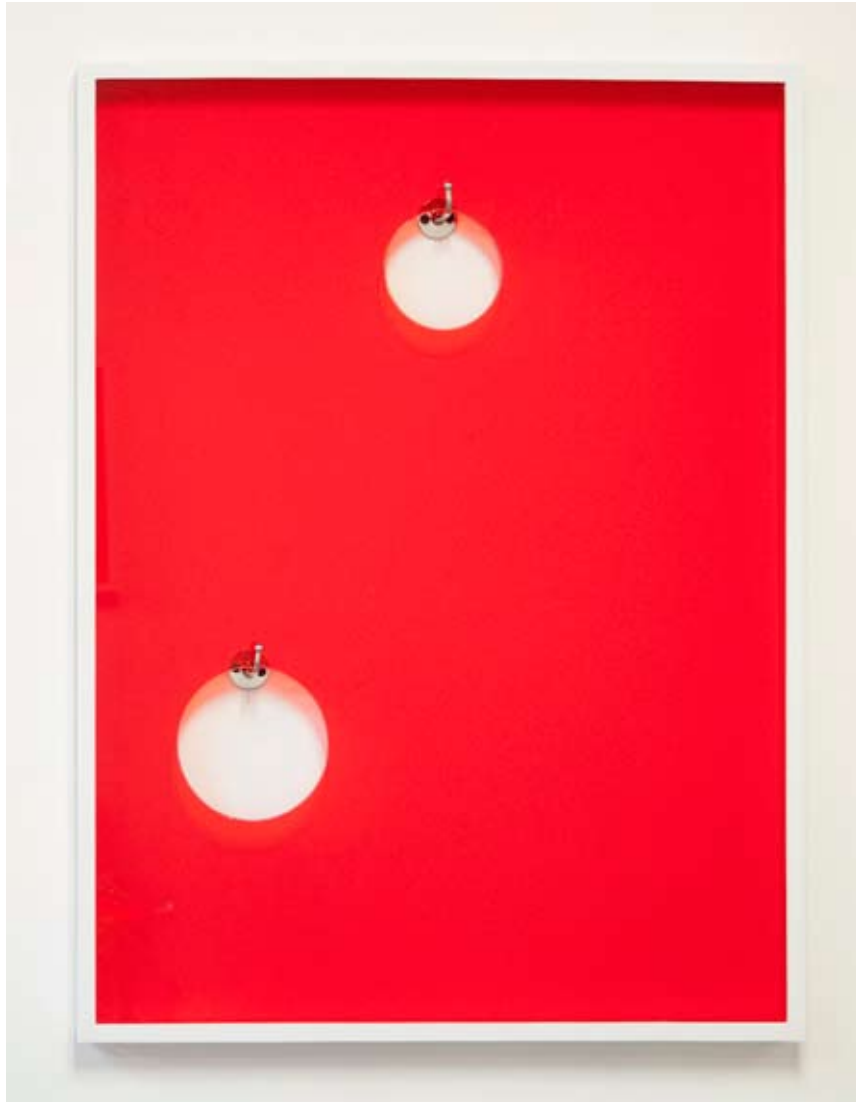
Untitled (fire red) Tinted glass, wood, enamel, hardware 37 x 25 x 1¼ inches 2014