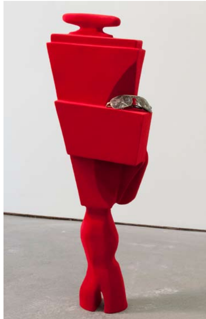
Untitled (display) foam, plaster, fiberglass, nylon micro- fiber, barnacle covered sunglasses 35 x 15 x 11 inches 2014