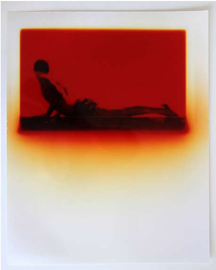
David, 2013 Edition of 5 Chromogenic screenprint 20 x 16 inches 2013