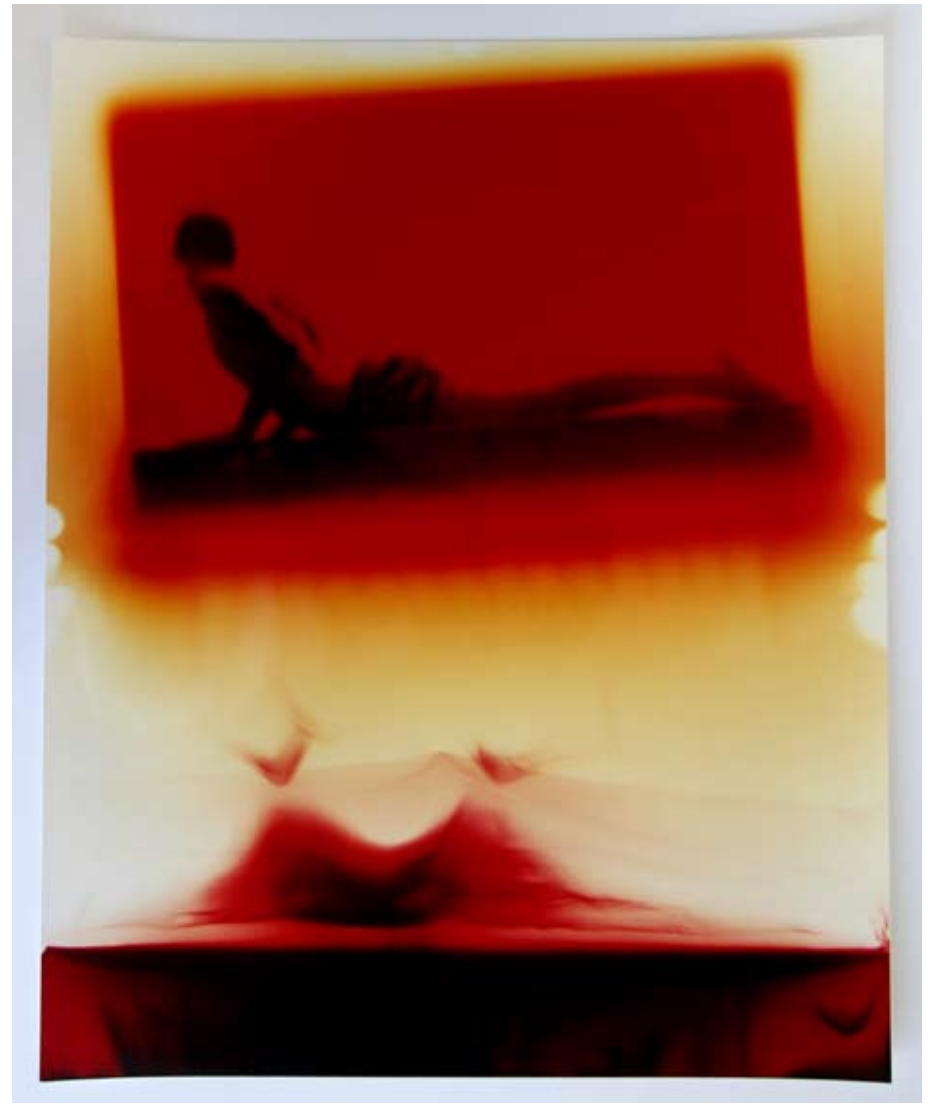
David, 2013 Edition of 5 Chromogenic screenprint 20 x 16 inches 2013