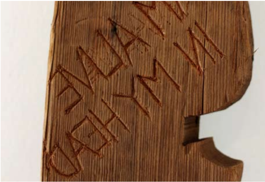
We Are Alive In Our Heads! redwood 71 x 5 x 31/2 inches 2014