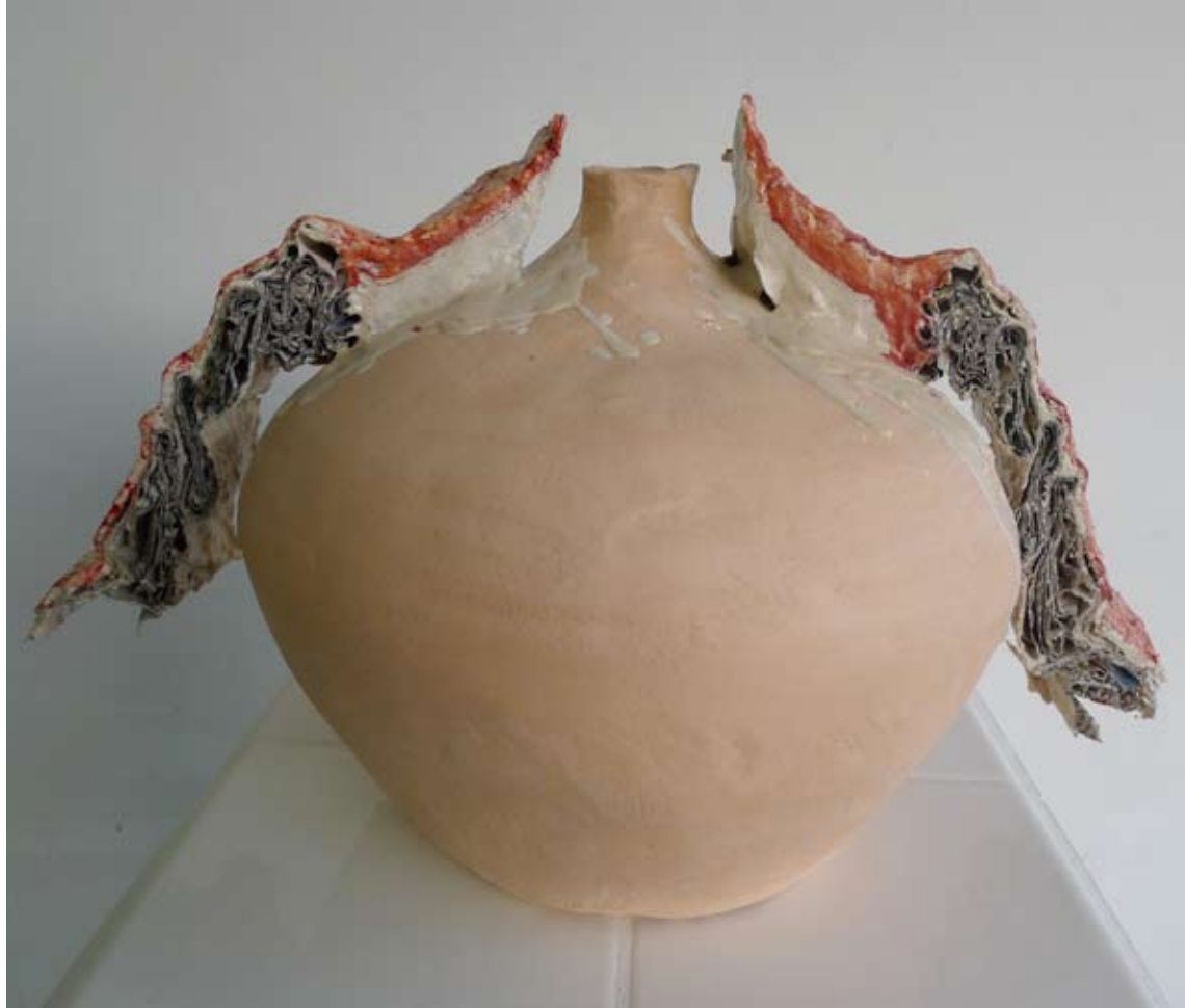
Handles 1 on tiled plinth Ceramic, papermache, food coloring, tile 12 x 16 x 10 inches 2014