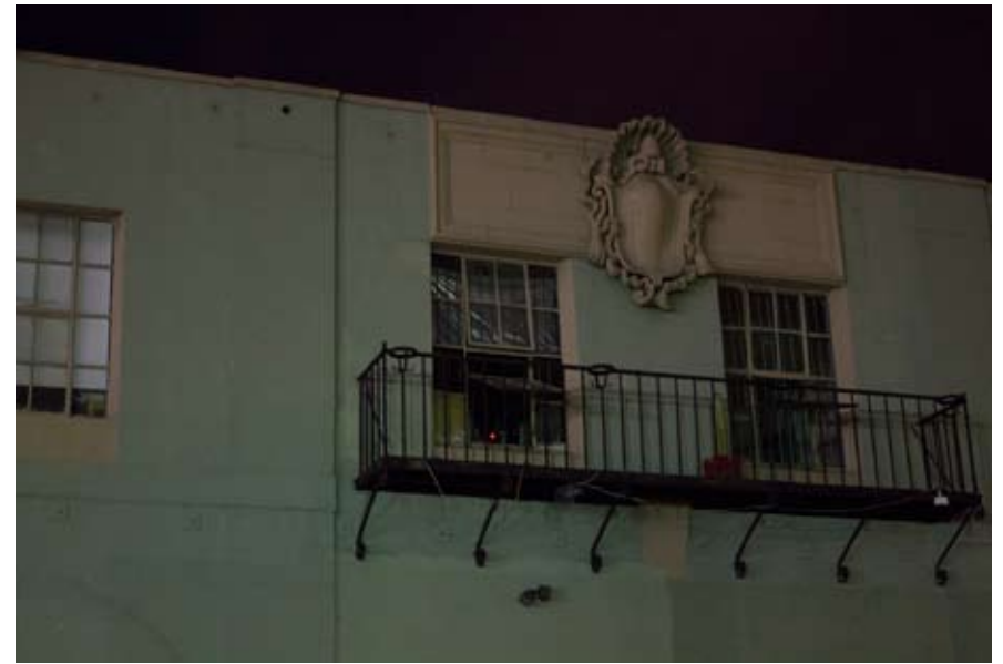
Inn Th' Styl 0 La Noche (red neon) neon fixture dimensions variable (dot is 1/2" wide) 2014