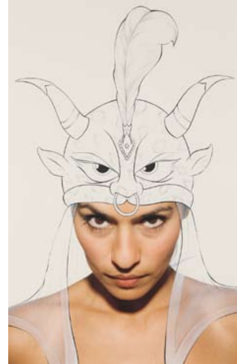
Pariya 15 , Acrylic and ink on digital pigment prints, 15.5" x 12.5", 2010. $3,000