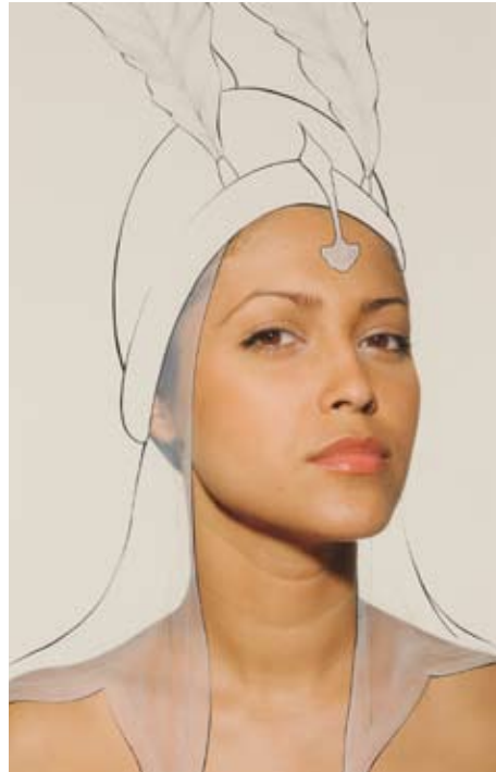
Pariya 12 , Acrylic and ink on digital pigment prints, 15.5" x 12.5", 2010. $3,000