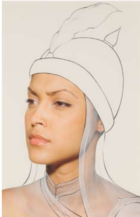
Pariya 10 , Acrylic and ink on digital pigment prints, 15.5" x 12.5", 2010. $3,000