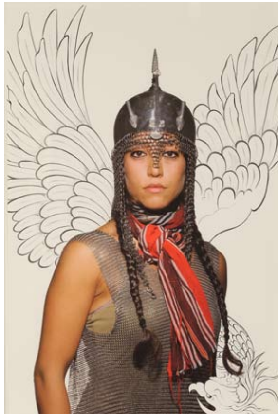
Arrival , Acrylic and ink on digital pigment prints, 45" x 30", 2010. $6,500