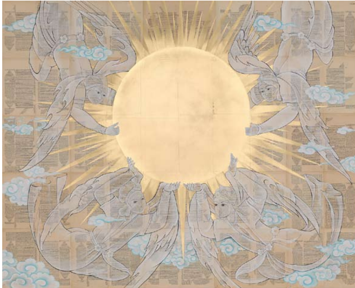
Returning Of The Sun , Acrylic, watercolor, and ink on book pages mounted on canvas, 63.5" ax 79.5", 2010. $25,000