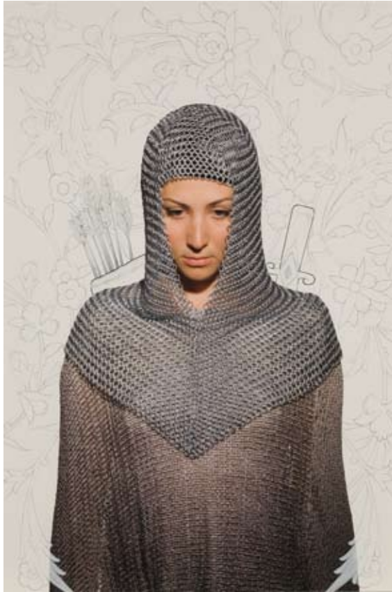
Tale Of The Beloved , Acrylic and ink on digital pigment prints, 45" x 30", 2010. $6,500