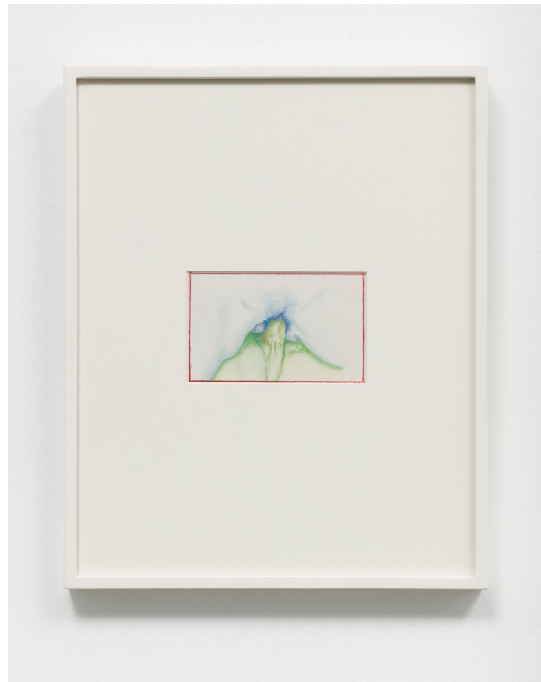
Hard into Soft #11 Pencil pastel on paper, conservation glass 20.5 x 16.5 in framed 1972