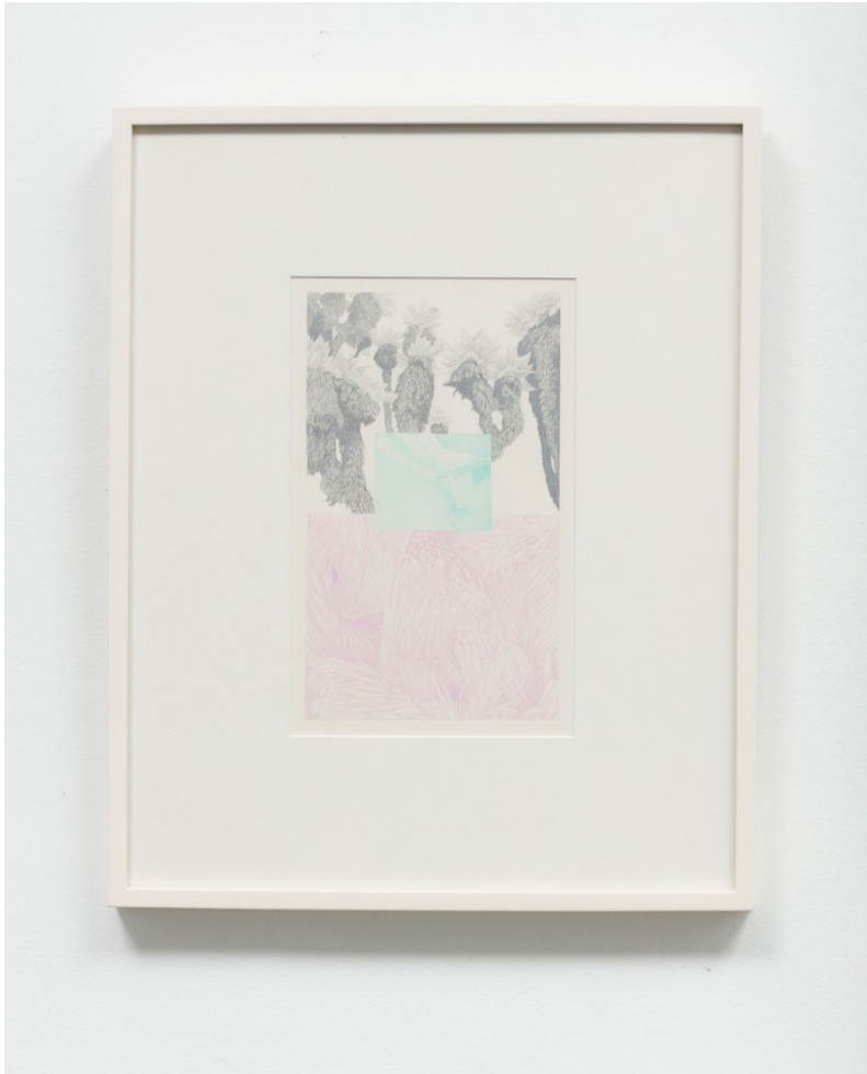
From Dreams #18 Pencil pastel on paper, conservation glass 20.75 x 16.75 in framed 1976