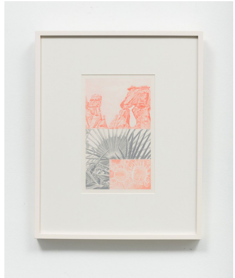
From Dreams #19 Pencil pastel on paper, conservation glass 20.75 x 16.75 in framed 1976