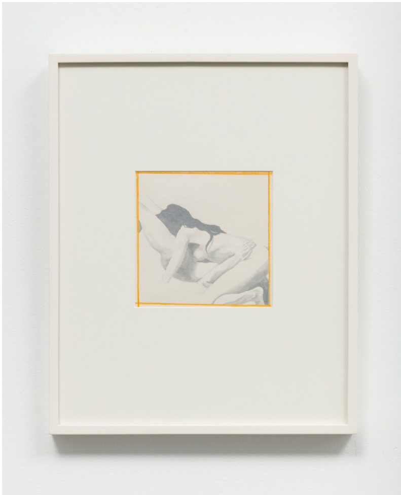
Hard into Soft #1 Pencil pastel on paper, conservation glass 20.5 x 16.5 in framed 1971