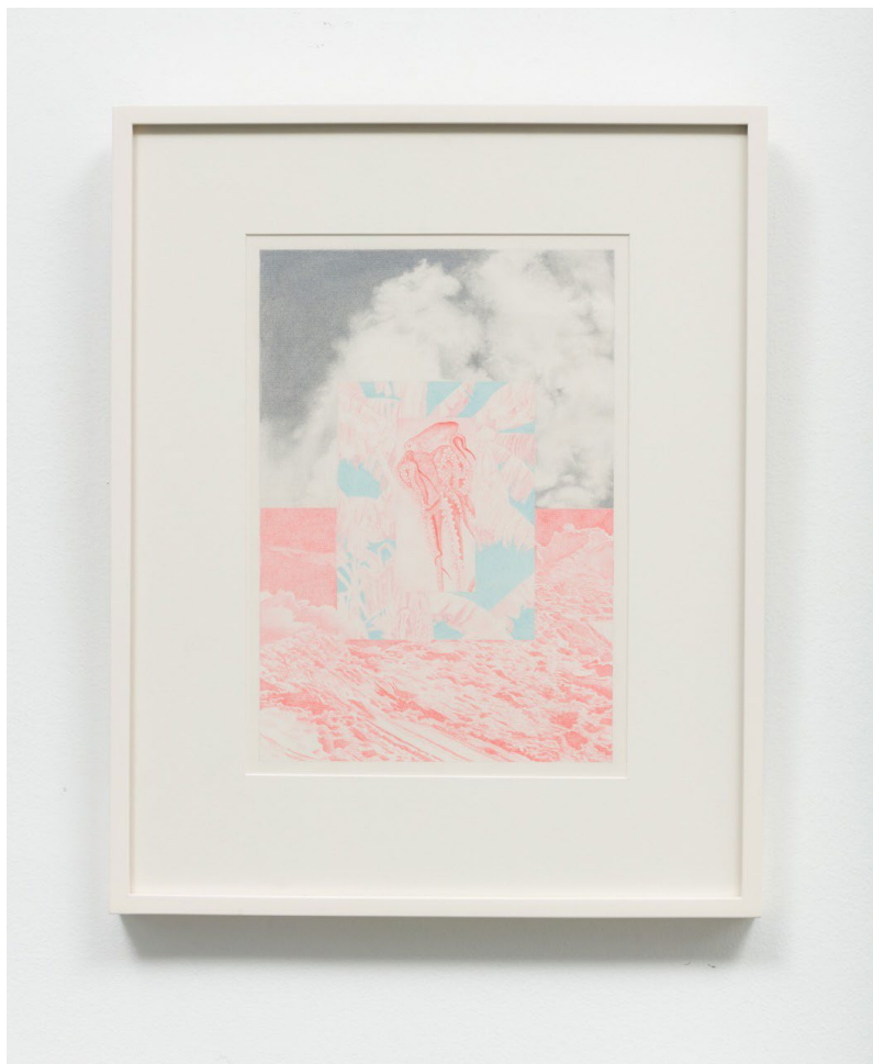
From Dreams #26 Pencil pastel on paper, conservation glass 20.75 x 16.75 in framed 1976