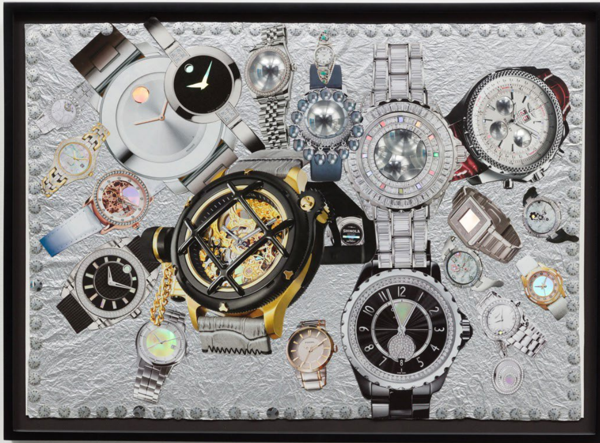
Good Timing Mixed media collage on board, conservation glass 20 x 28.5 in paper 22.5 x 30.5 in framed 2015