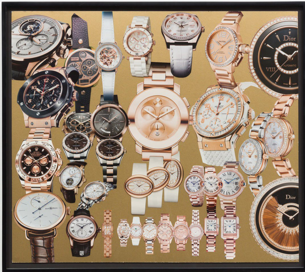
Time Standing Still Collage on paper conservation glass 28 x 32 in paper 30.25 x 34.25 in framed 2014