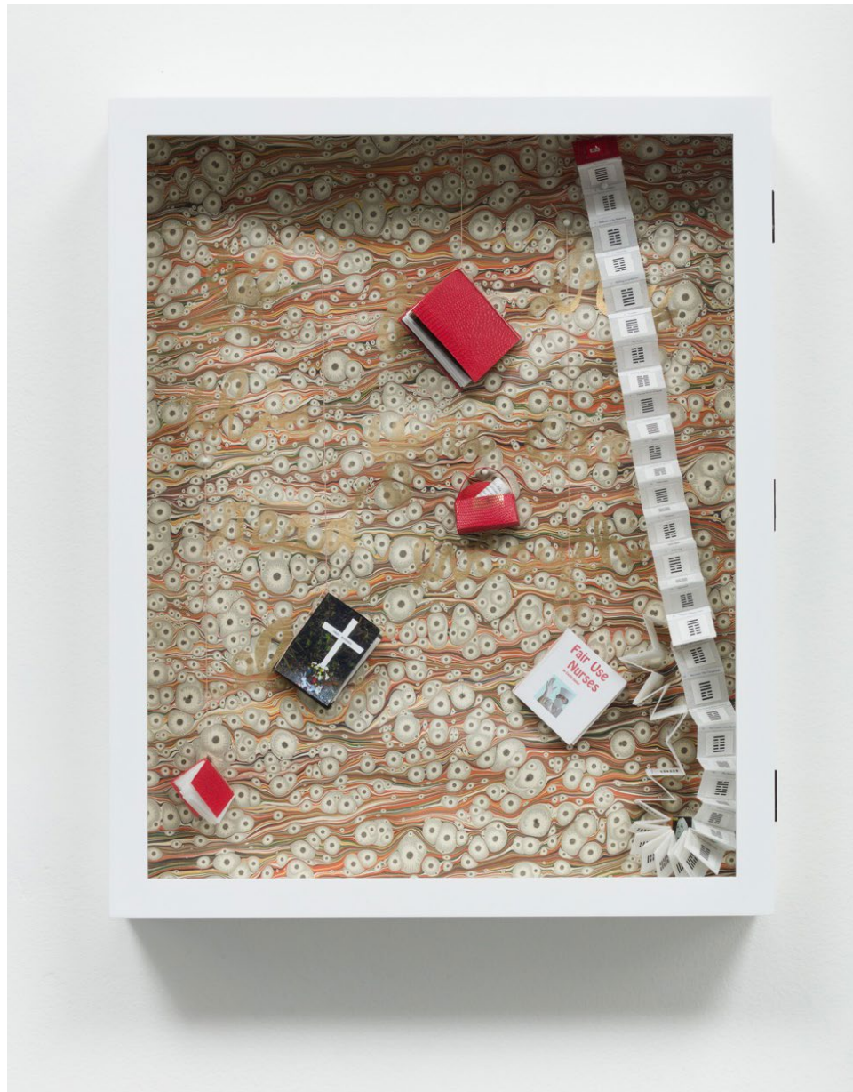
Do Not Touch #1 Miniature books & texts, gold spray paint on marbled paper in wooden box 21.25 x 17.25 x 4 in 2013