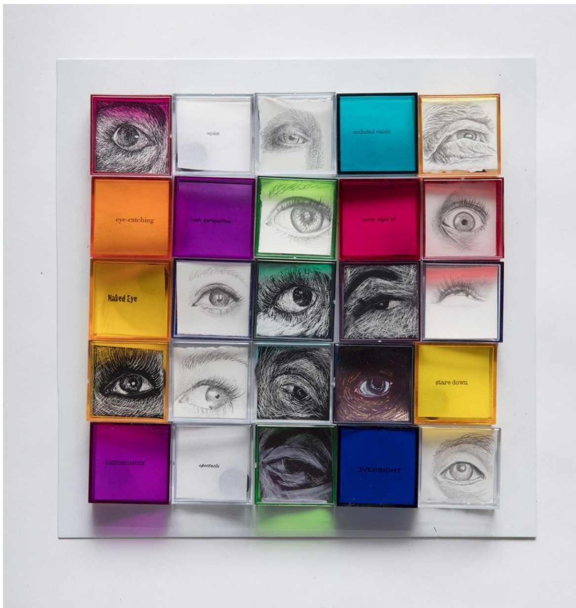
Do Not Touch #2 Pencil drawings, scratch- board drawings, acrylic, magnets on metal 12 x 12 x .5 in 2014