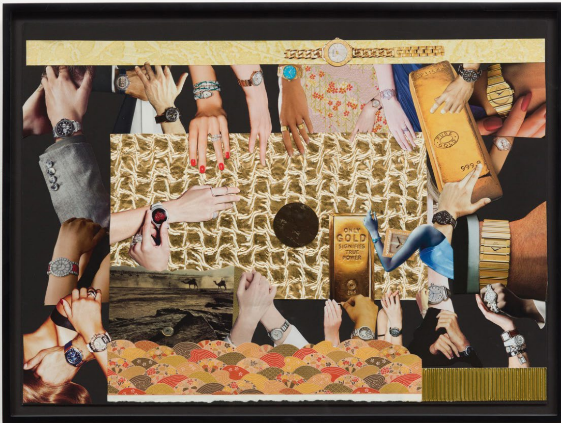
Buying Time Collage on archival board, conservation glass 22.5 x 31 in paper 25 x 33.25 in framed 2016