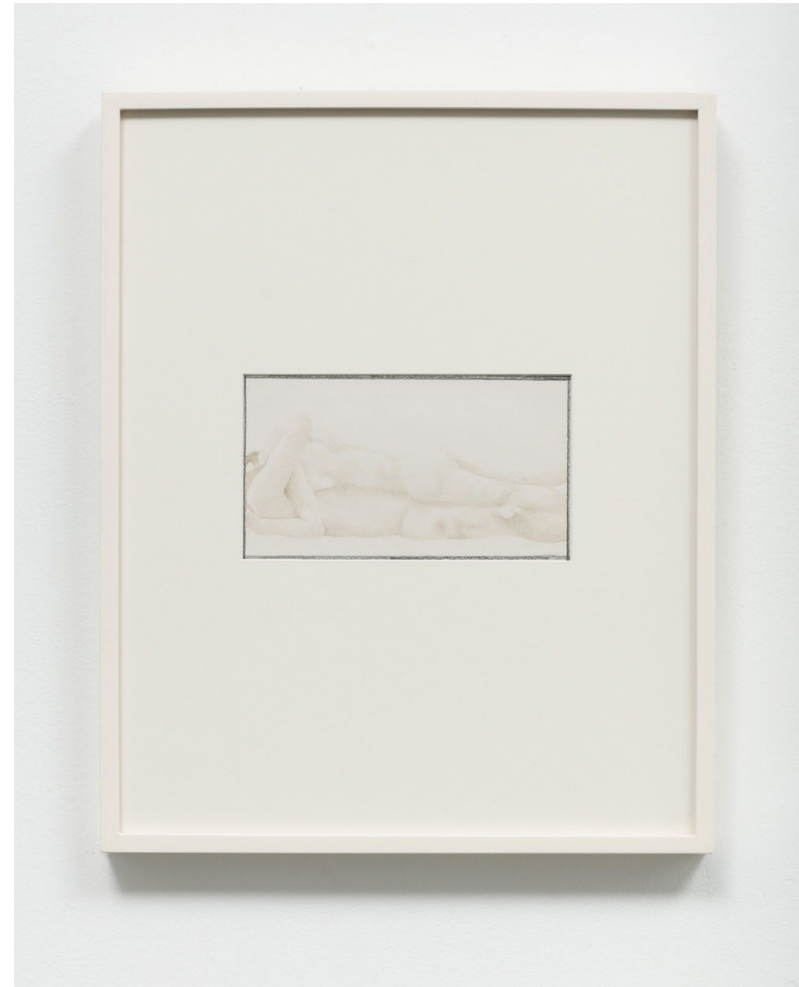
Hard into Soft #2 Pencil pastel on paper, conservation glass 20.5 x 16.5 in framed 1971