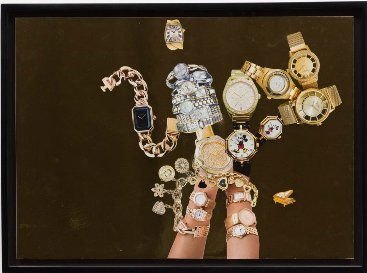
Saving Time Collage on gold mylar conservation glass 19.5 x 27.5 in paper 22 x 30 in framed 2017