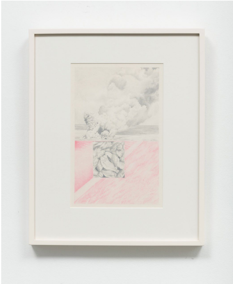
From Dreams #13 Pencil pastel on paper, conservation glass 20.75 x 16.75 in framed 1976