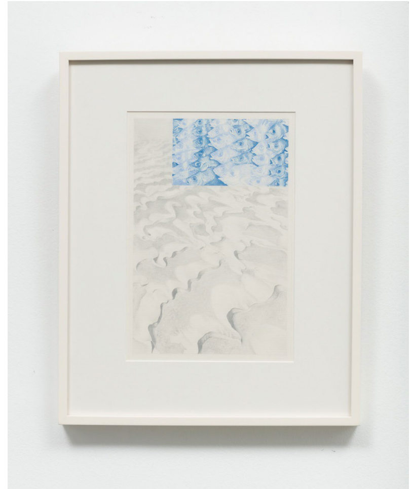
From Dreams #16 Pencil pastel on paper, conservation glass 20.75 x 16.75 in framed 1976