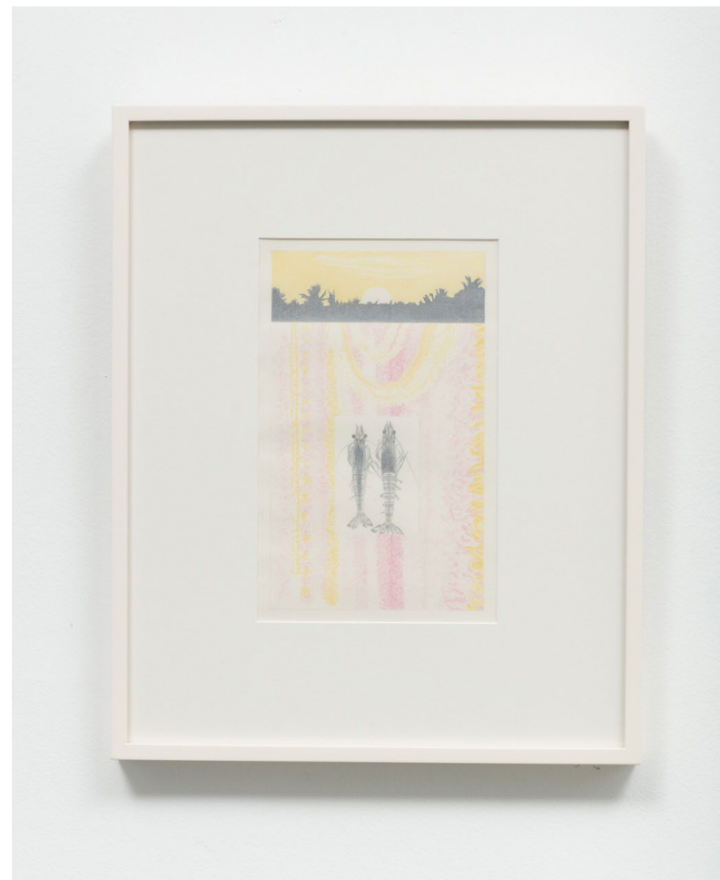
From Dreams #7 Pencil pastel on paper, conservation glass 20.75 x 16.75 in framed 1974