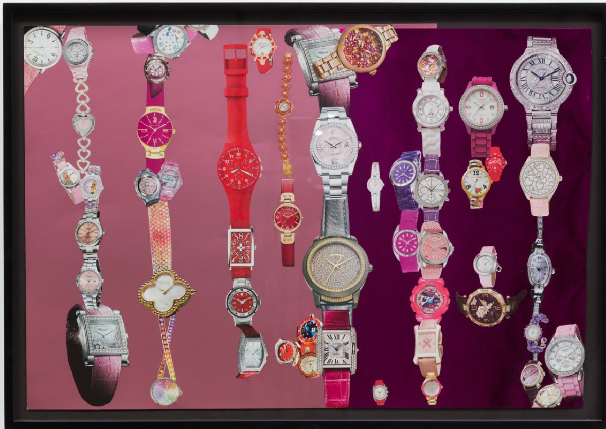
Good Times Collage on mylar paper on board, conservation glass 19.5 x 28.5 in paper 22 x 31 in framed 2015