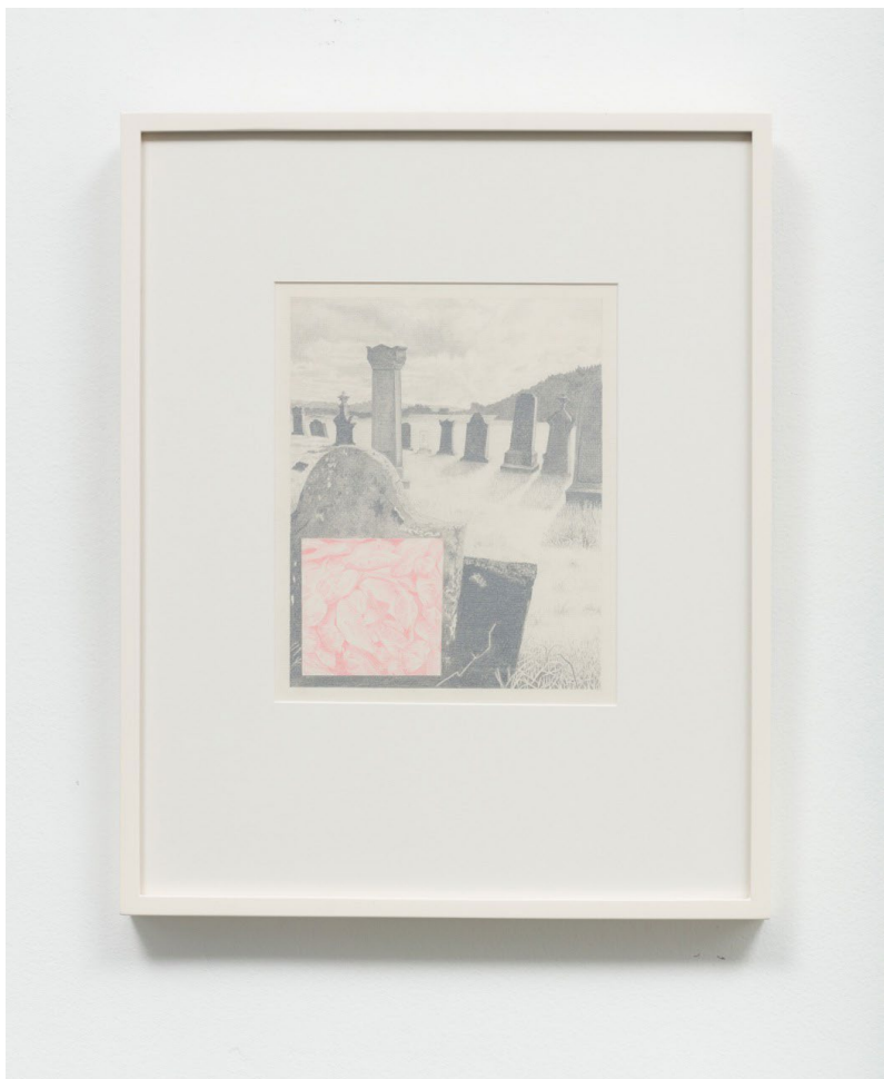
From Dreams #8 Pencil pastel on paper, conservation glass 20.75 x 16.75 in framed 1975