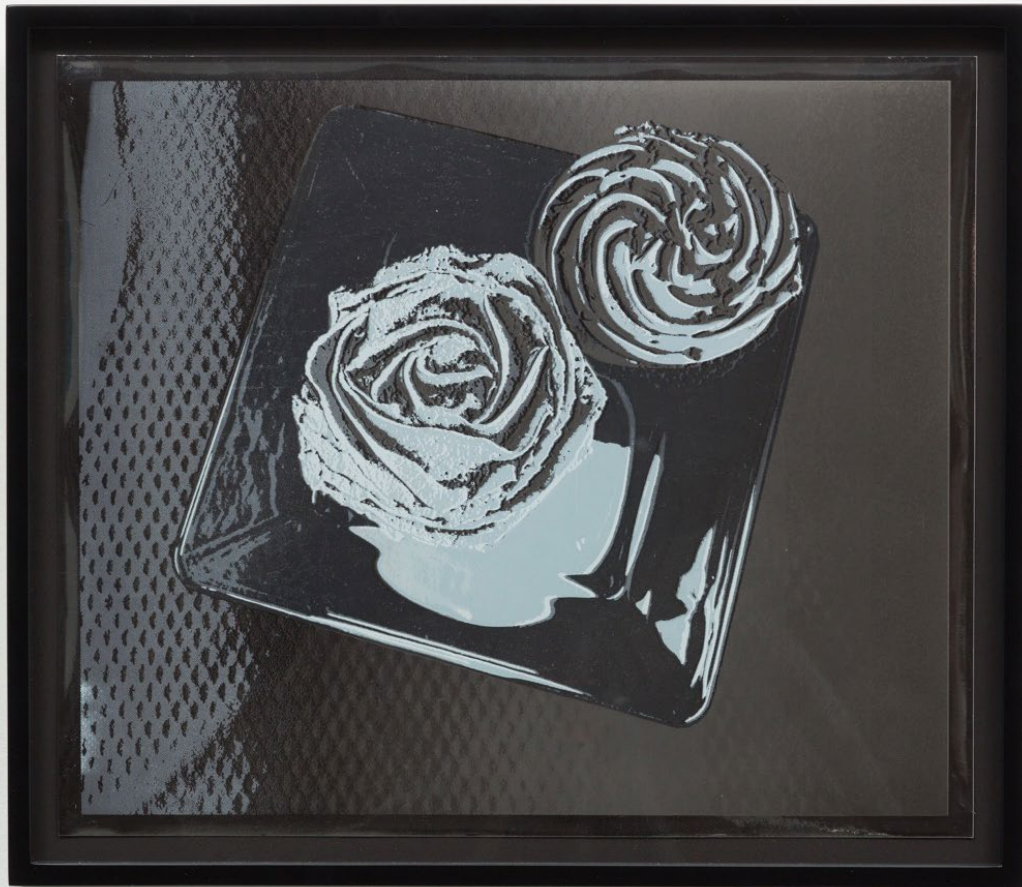
50 Shades - Cupcakes Screen print on mylar, aluminum or paper Edition of 20 17 x 20 in paper 19.25 x 22.25 in framed 2013