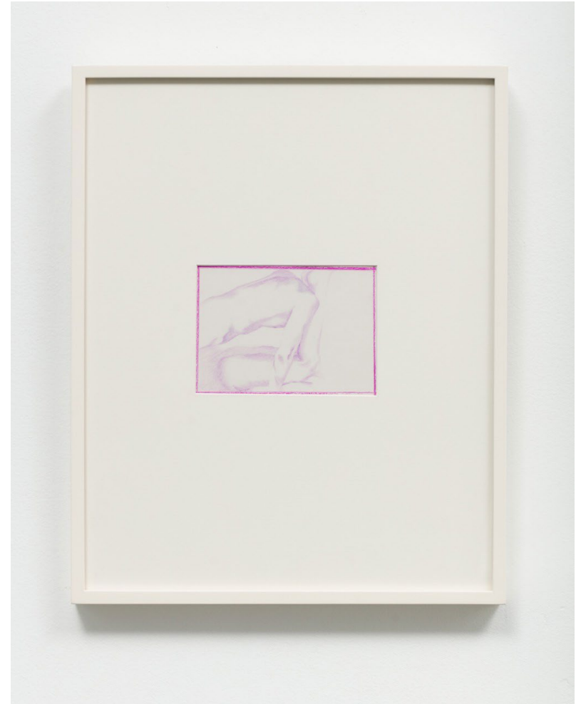
Hard into Soft #6 Pencil pastel on paper, conservation glass 20.5 x 16.5 in framed 1972