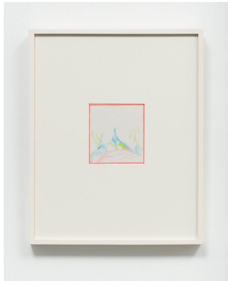
Hard into Soft #9 Pencil pastel on paper, conservation glass 20.5 x 16.5 in framed 1972