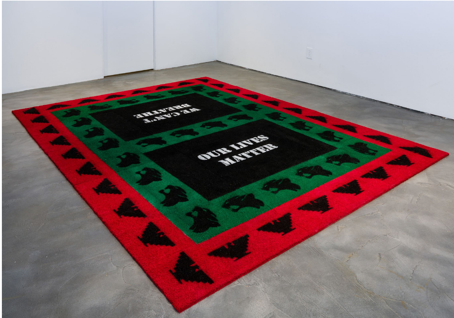
Our Lives Matter/We Can't Breathe Acrylic on 15 coconut coir and latex floor mats 110 X 84 inches 2014