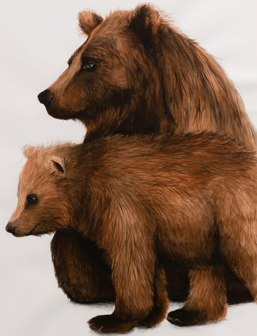
The Strong Mother (Corky and Mom) Charcoal and acrylic ink on paper 58 ½ x 41 ½ inches 2015

For far-oh, very far behind Corky's father went and left- But Corky will always bear in mind The strong mother that he kept.