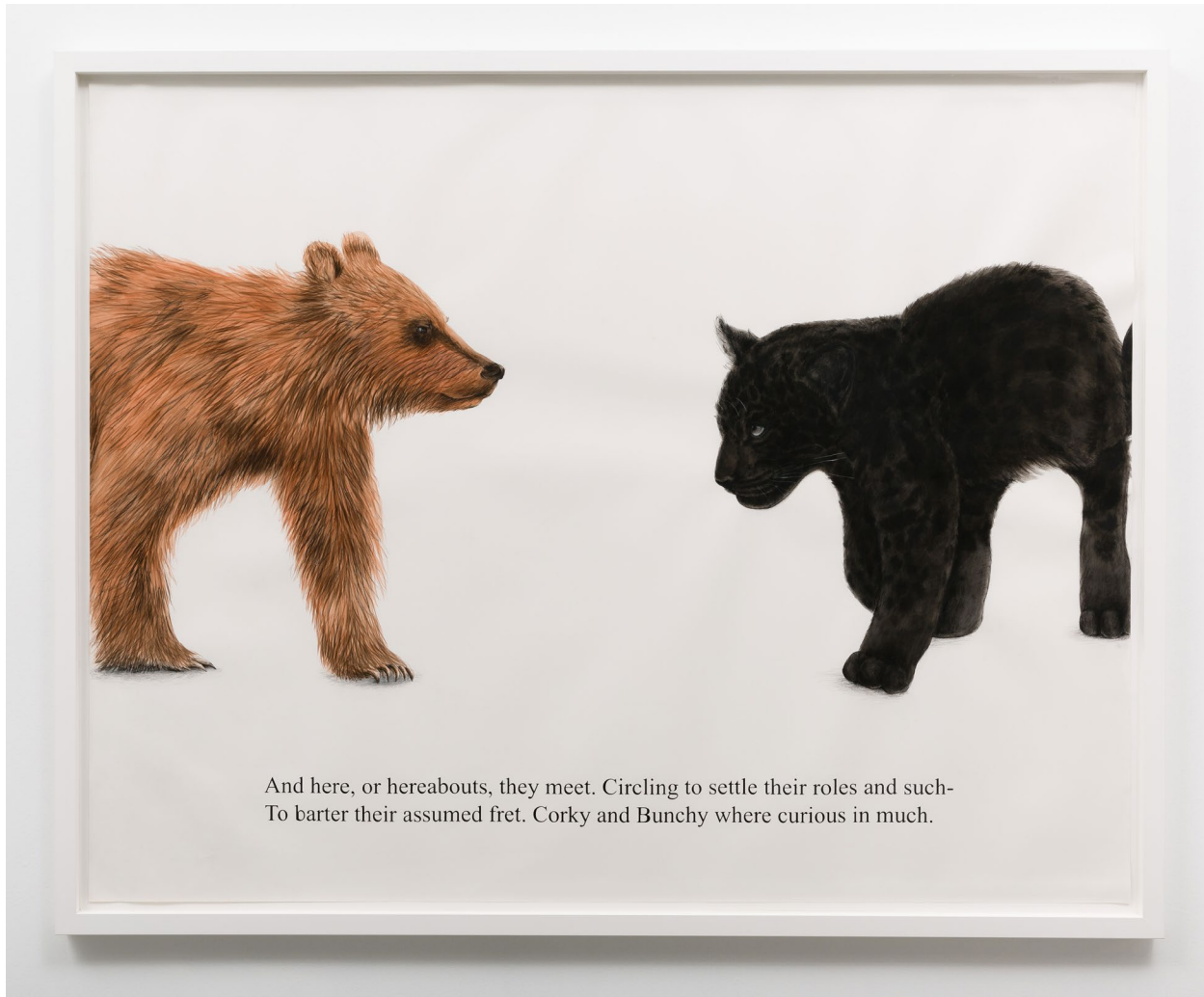
The Meeting of Corky and Bunchy Charcoal and acrylic ink on paper 58 ½ X 74 ½ inches 2015