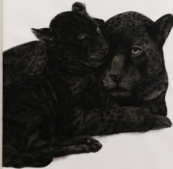
The Wise Mother (Bunchy and Mom) Charcoal and acrylic ink on paper 58 ½ x 41 ½ inches 2015

Let's melt into the landscape- Just us two by our lones, Let's- oh, anything Mommy, For you have wise tones.