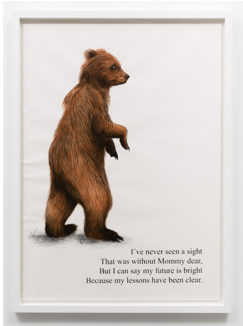
Corky Sets Out Charcoal and acrylic ink on paper 58 ½ x 41 ½ inches 2015