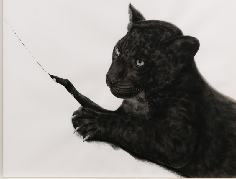
Bunchy Sets Out Charcoal and acrylic ink on paper 58 ½ x 41 ½ inches 2015

And there ought to be a corner for me, Where I can roam and be free. But there is danger and things I can't see Yet I've been taught well, as all should be.