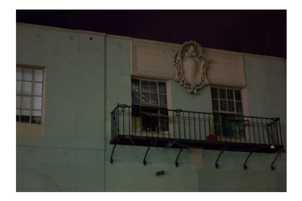
Inn Th' Styll O La Noche (red neon) neon fixture dimensions variable (dot is 1/2" wide) 2014

We Are Alive In Our Heads! redwood 71 x 5 x 31/2 inches 2014