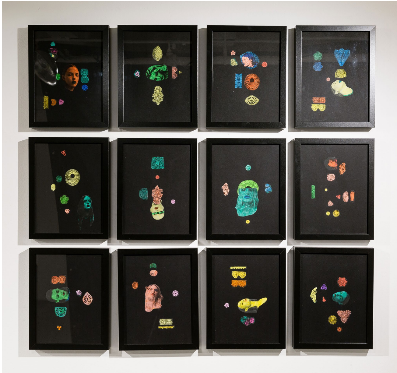
Scrapbook Ophelia Collage 8.5 x 11 inches 2015