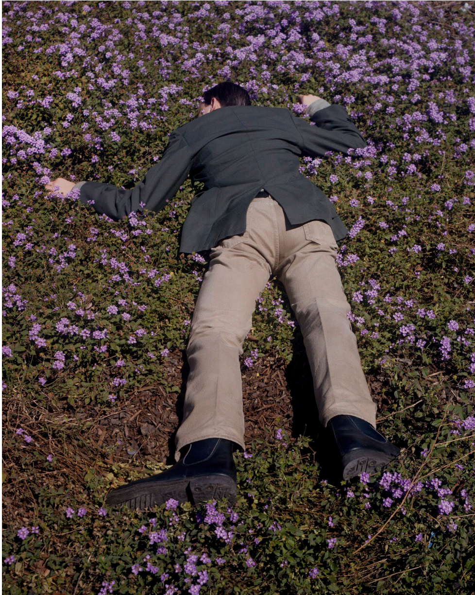
Unknown Soldier Archival Pigment Print 16 x 20 inches