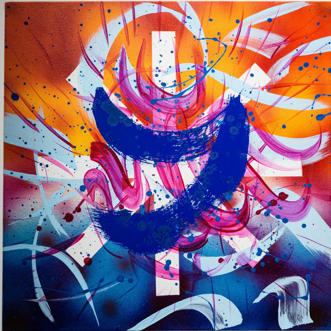
The Zabalam Temple of Inanna Acrylic and enamel on canvas 20 x 20 inches