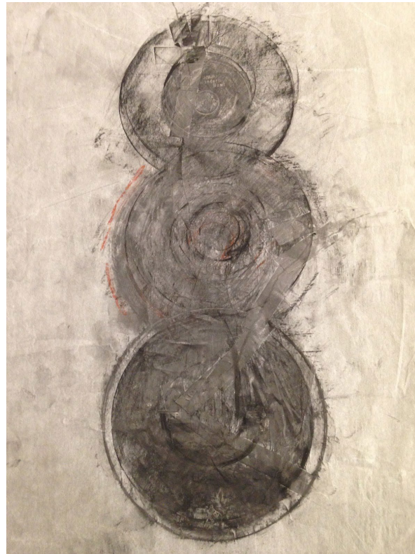
Rubbing of Three Tupperware Lids (Small, Medium, Large) Graphite and Tape on Paper 19 x 24 inches 2015