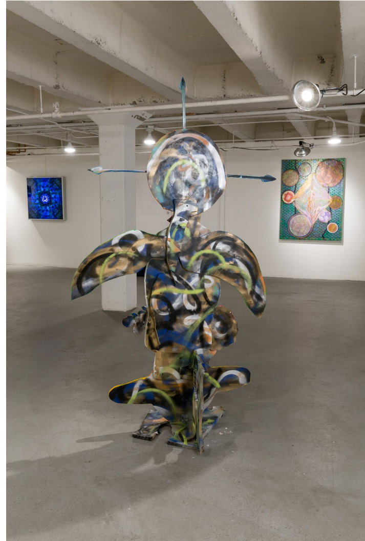
1st Century Mixed media (oil, paper, cardboard and glue) sculpture on panel 72 x 40 x 28 inches