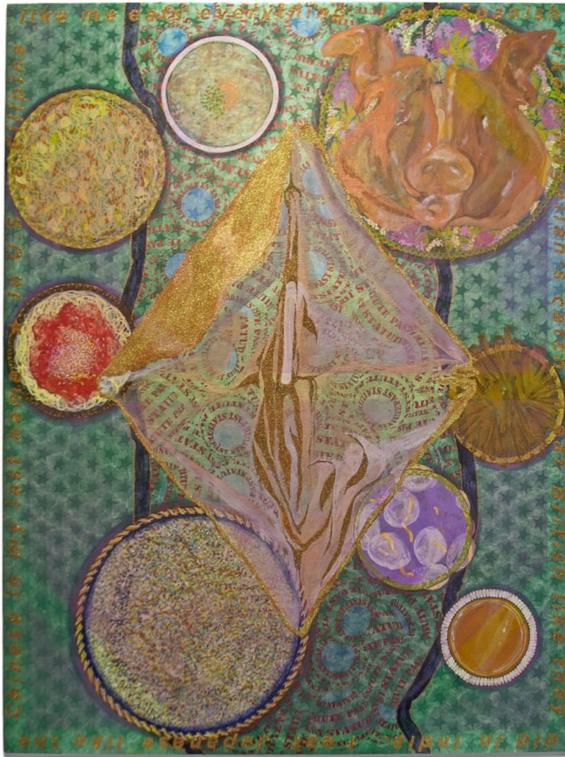
Love Boat: Fiesta Acrylic and glitter on canvas 48 ¼ x 36 ¾ inches