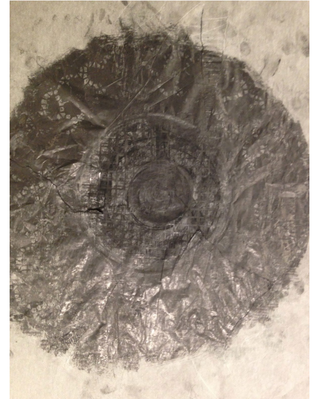
Tupperware Lid and Colander Strainer Between 45RPM Record and Doily Rubbing Conte, Graphite, and Tape on Tracing Paper 19 x 24 inches 2015