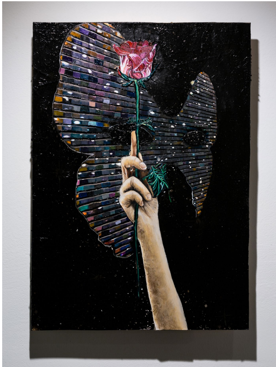
The Wish Mixed media on Matte Board 11 x 17 inches