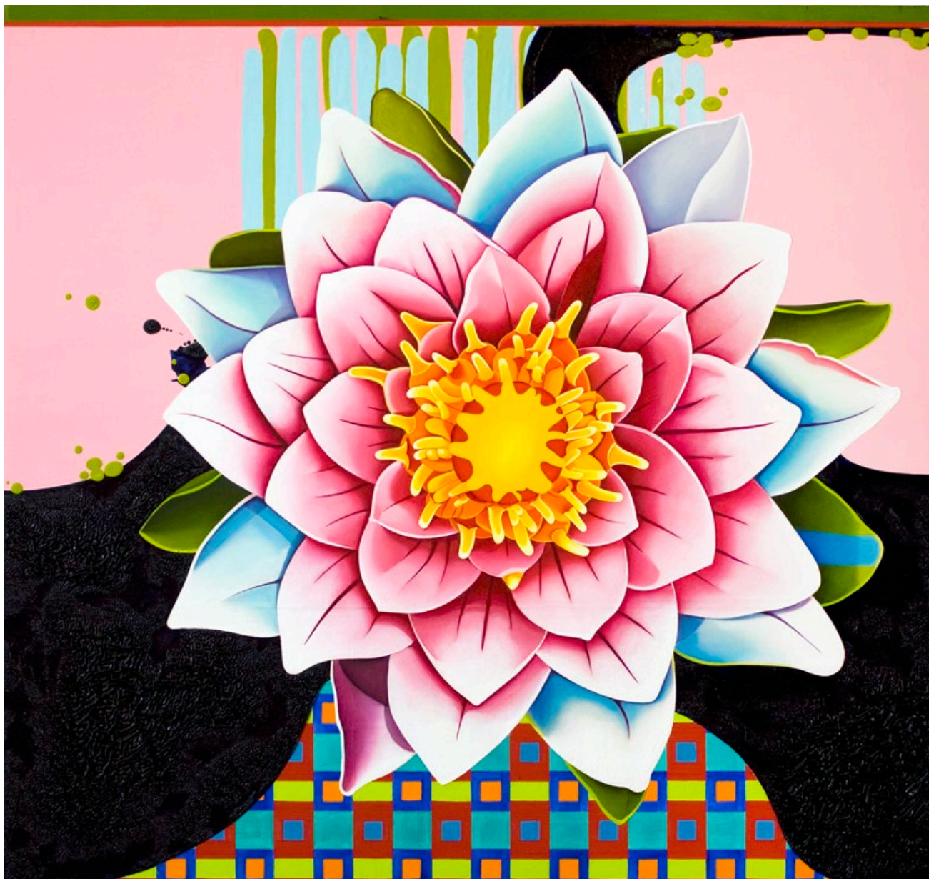
Lotus Oil on panel 24 x 24 inches 2015