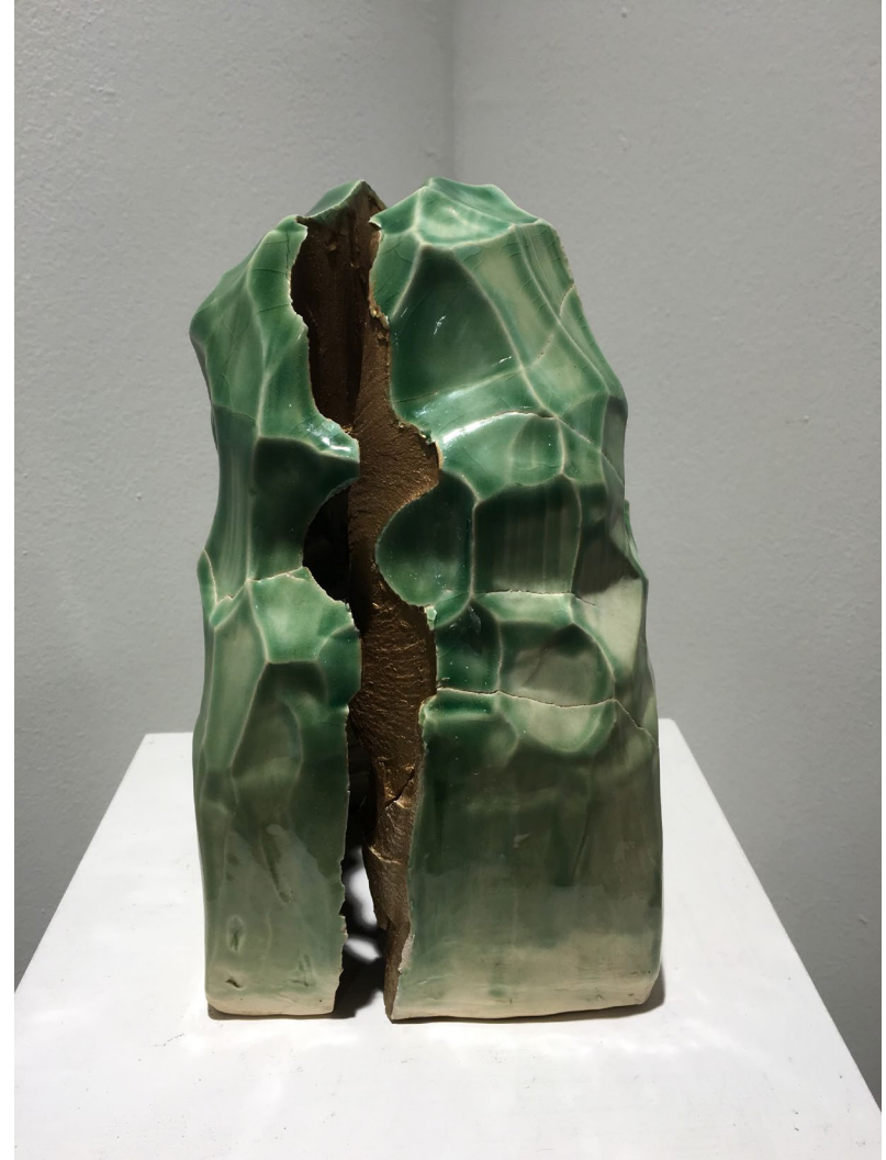
Green Mountain Porcelain sculpture with celadon glaze 12 x 7 x 7 inches