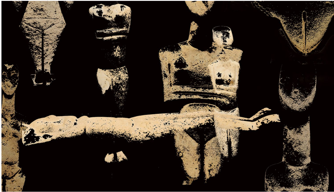
Untitled (Cycladic figurines) Archival Pigment Print 10.25 x 18 inches 2016