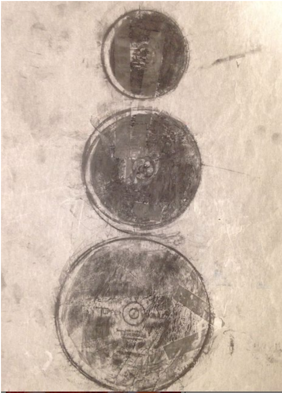
45RPM Record over Tupperware Lids Rubbing Conte, Graphite, and Tape on Tracing Paper 19 x 24 inches 2015