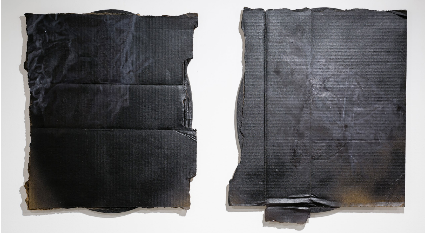
Day + Night 21 x 36 inches (diptych variable), oil on cardboard on linen on panel Courtesy of Brennan & Griffin 2015