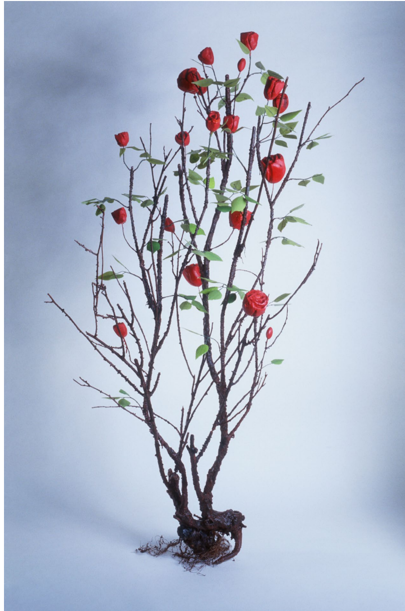
The Fools Oil, wax, metal, foam, hemp, rose branches 2004