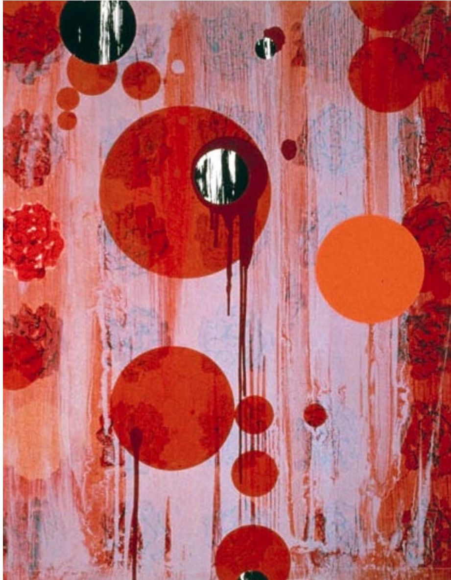
Mater Rosa 1 Lithograph, unframed print by cirrus editions 1991