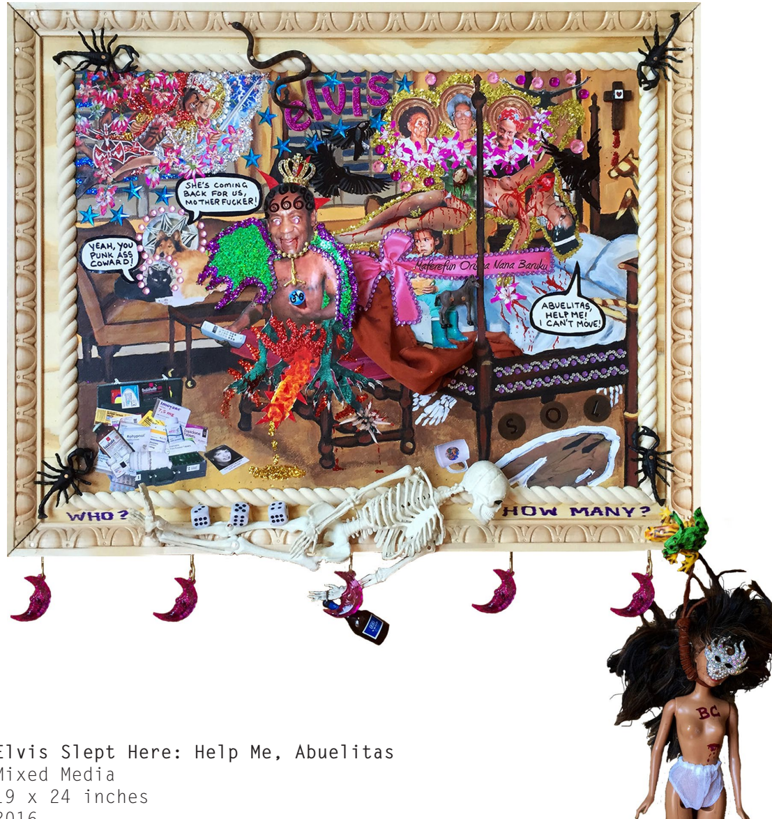
Elvis Slept Here: Help Me, Abuelitas Mixed Media 19 x 24 inches 2016