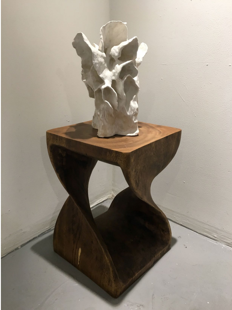
White Flower Stoneware ceramic sculpture 15 x 8 x 9 inches