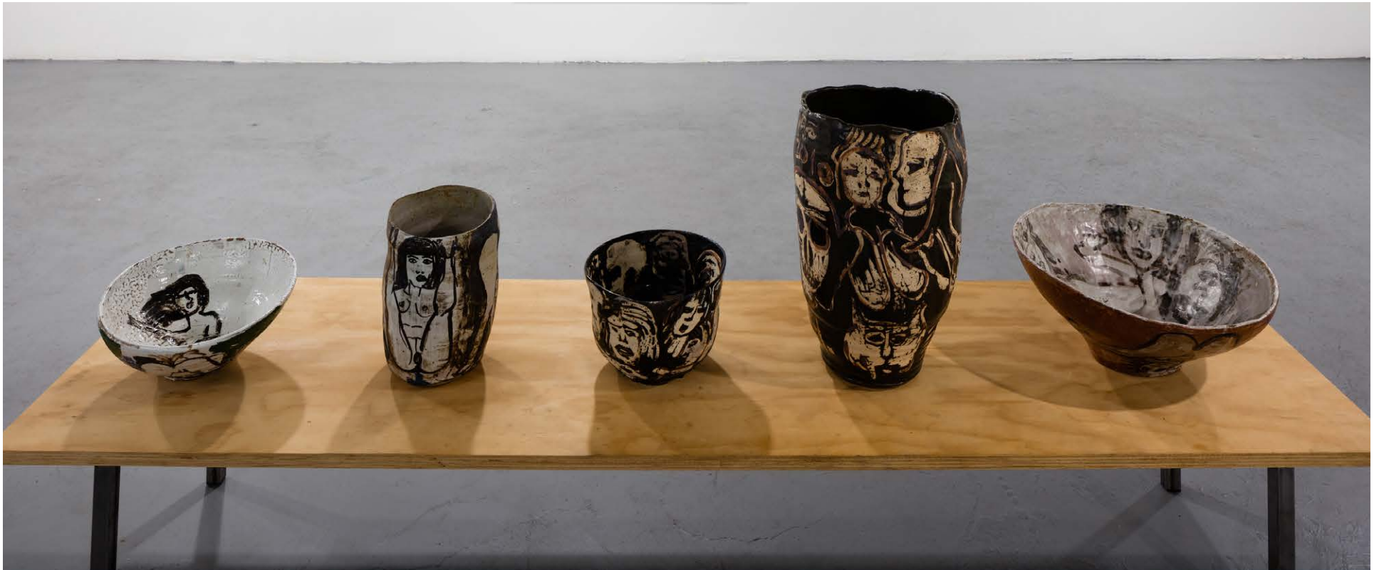
Untitled Glazed ceramic 8.25 x 19 inches diameter 1997