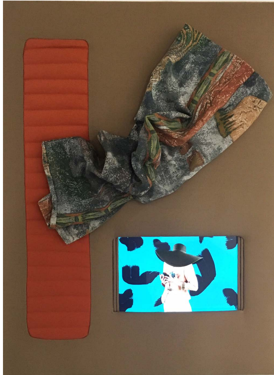
Blue Vignette 1 fabric, padding, wood, elec- tronics, HD video (TRT 03:15, looping) 18 x 24 x 4.25 in 2016