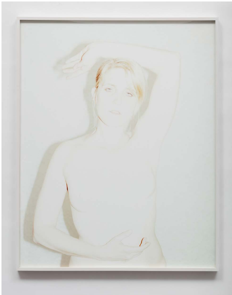
Woman no. 12 (Self-Portrait) archival pigment print 40 x 32 inches edition of 3 plus 2 artist's proofs 2016