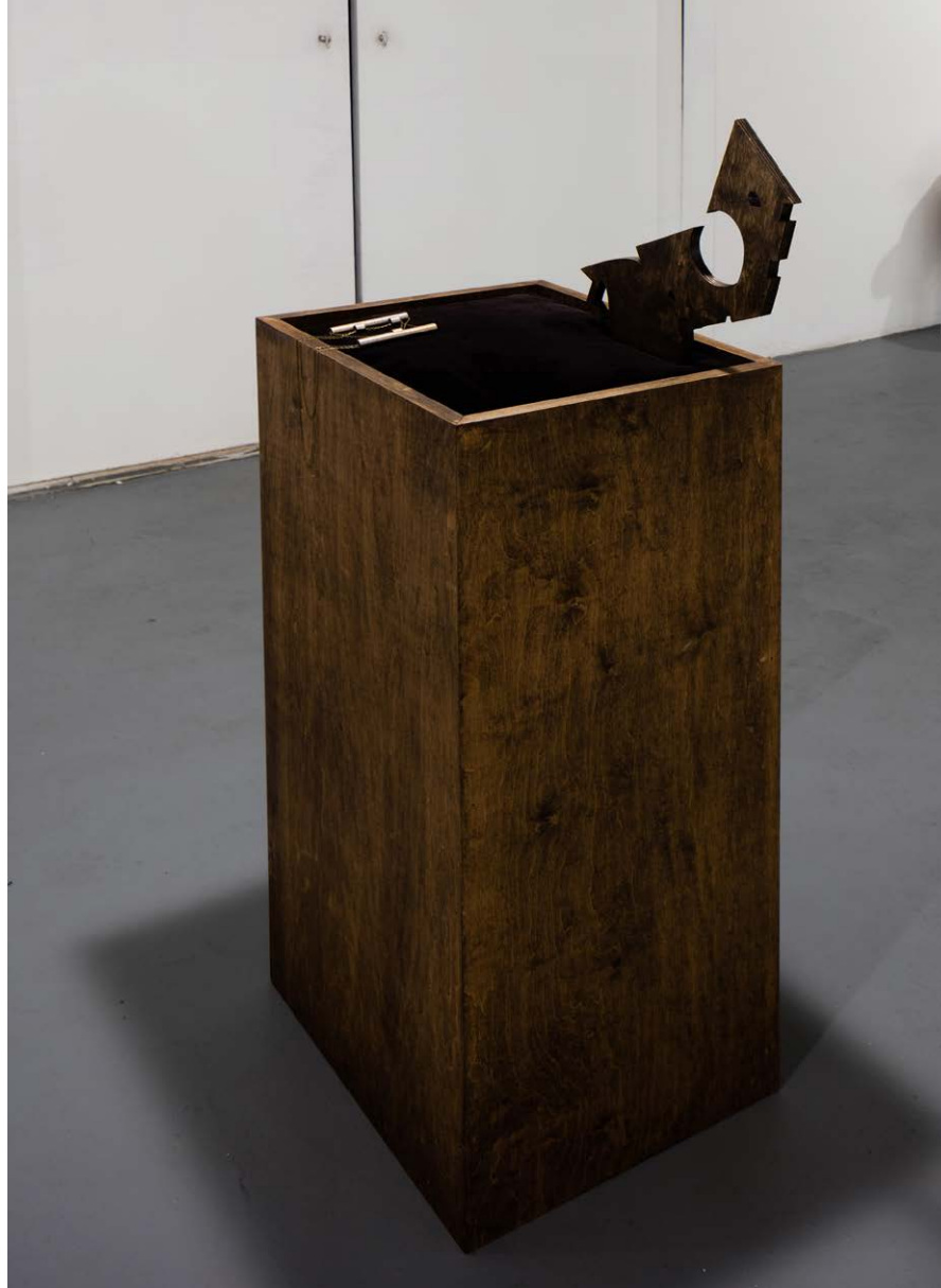
Smooth Trug Plywood, stain, velvet, 3D-printed stainless steel/ bronze alloy 48 x 14 x 17 inches 2016