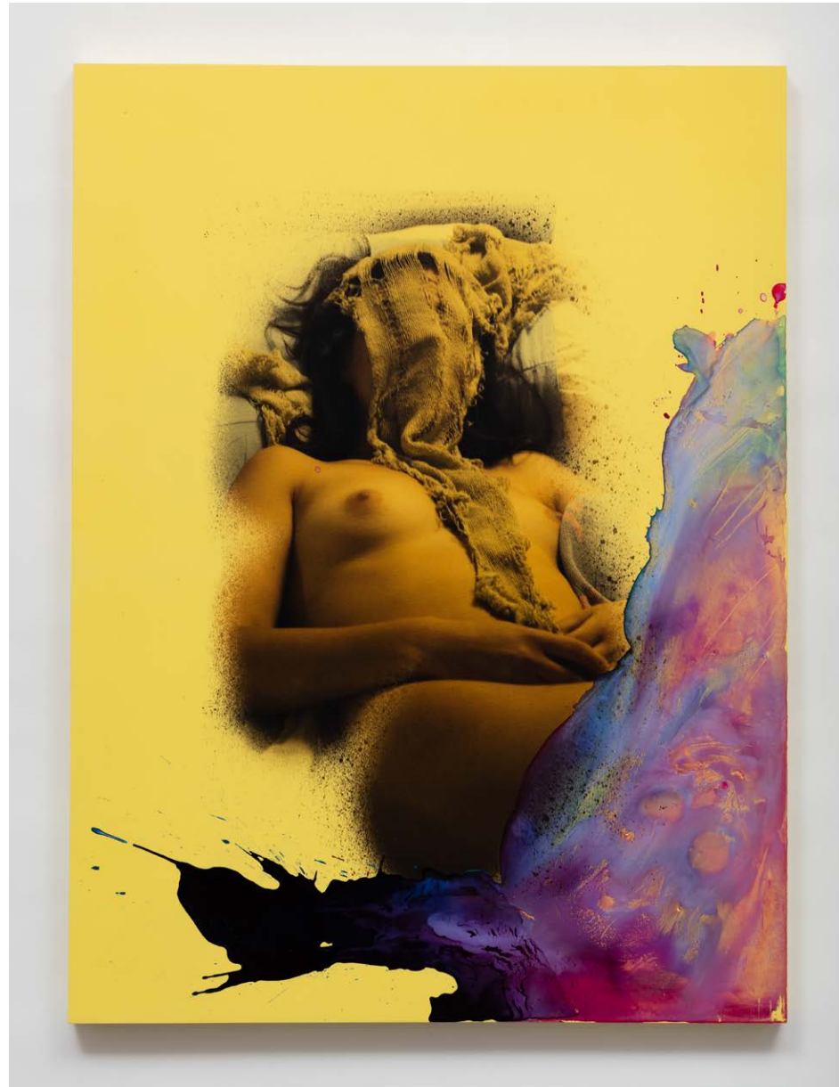
Nora Pīa Automotive paint, UV print and watercolor on wood 30 x 40 x 1.5 inches 2015