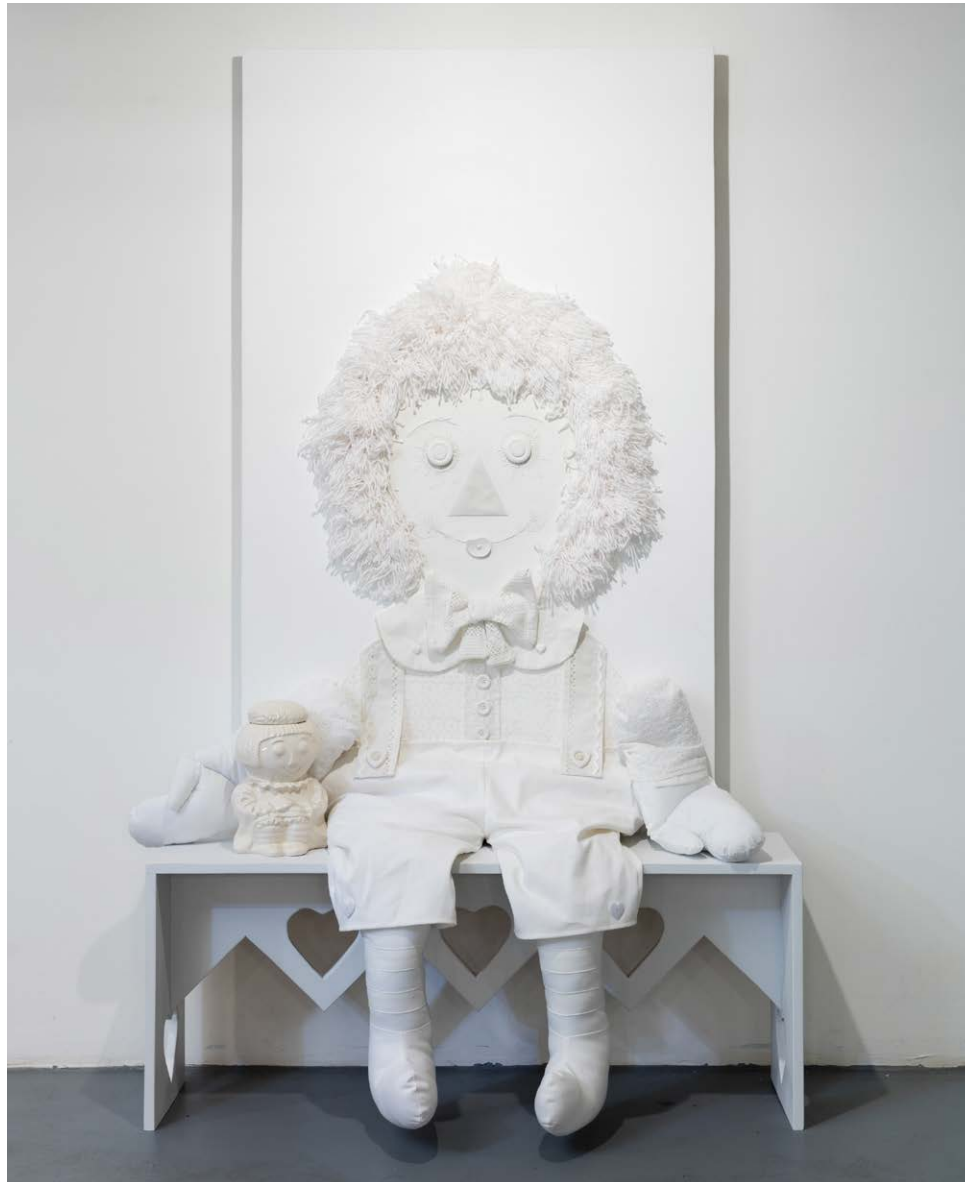
Deep Into the Whites Mixed media on canvas 20 x 46 x 80 inches 2016