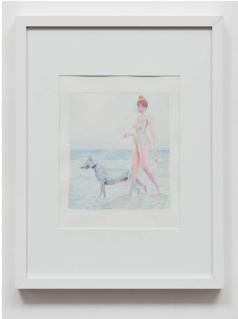
Beach Walk Watercolor on paper 14 x 10 inches 2016