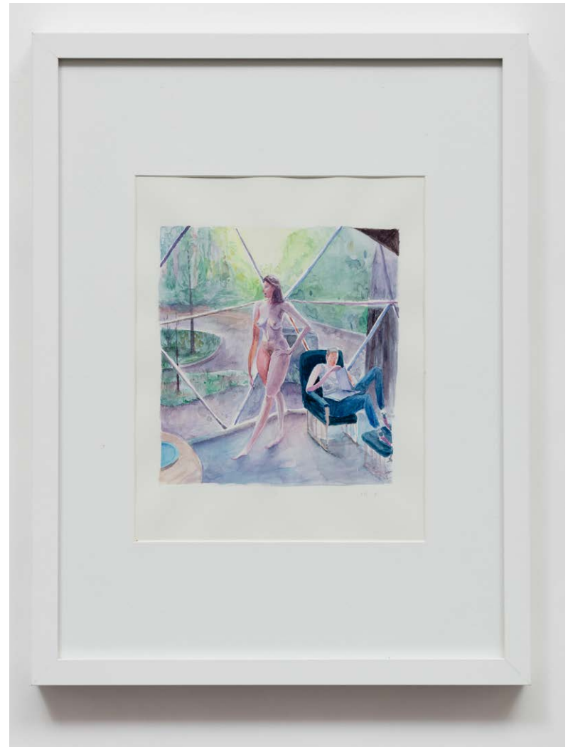
Santa Cruz Watercolor on paper 14 x 10 inches 2016