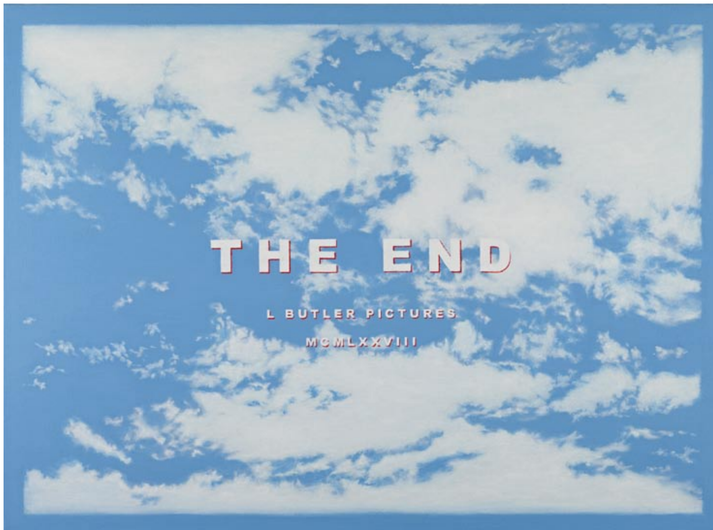
The End XVII, Acrylic on canvas, 22 x 30 inches, 2014