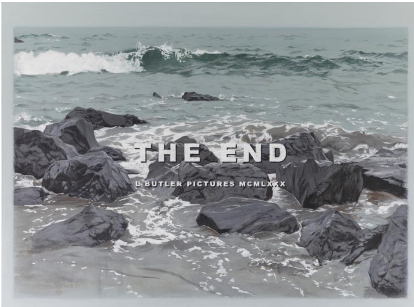
The End XIII, Acrylic on canvas, 22 x 30 inches, 2013