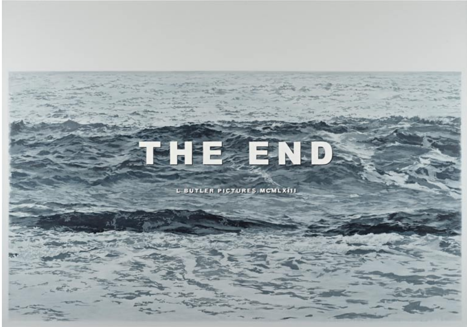
The End XIX, Acrylic on canvas, 38 x 54 inches, 2014