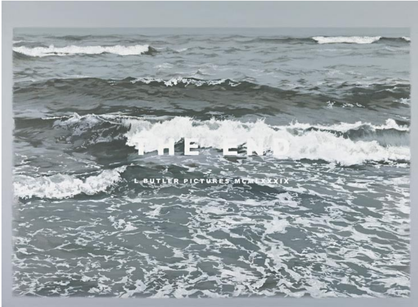
The End XVIII, Acrylic on canvas, 22 x 30 inches, 2014