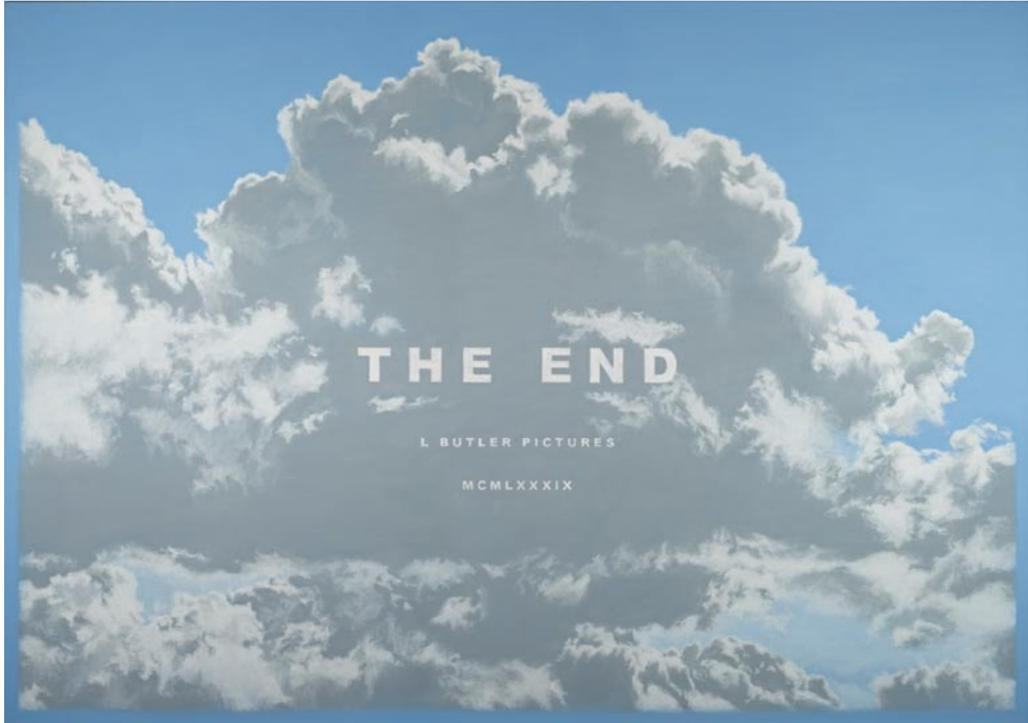
The End XVI, Acrylic on canvas, 38 x 54 inches, 2013