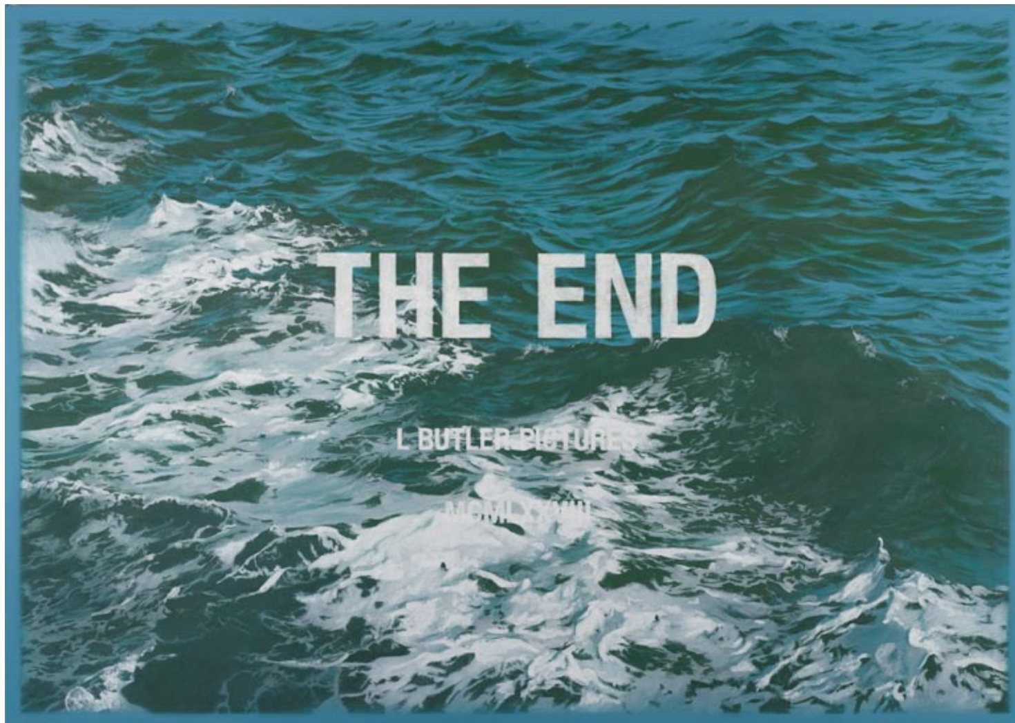
The End IX, Acrylic on canvas, 38 x 54 inches , 2012