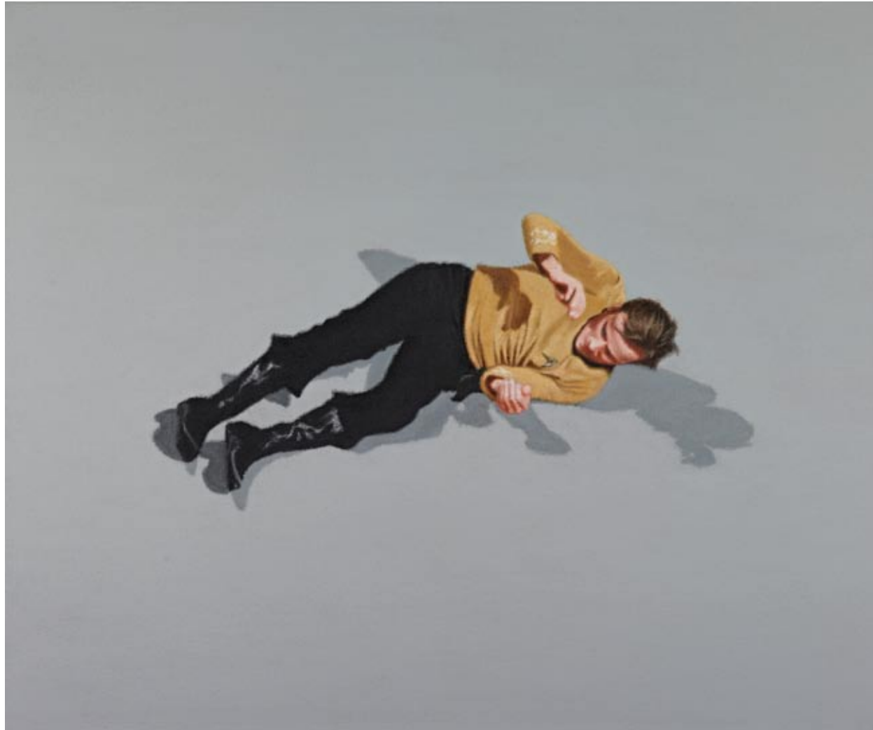
Captain XXXIV, Acrylic on canvas, 20 x 24 inches, 2013