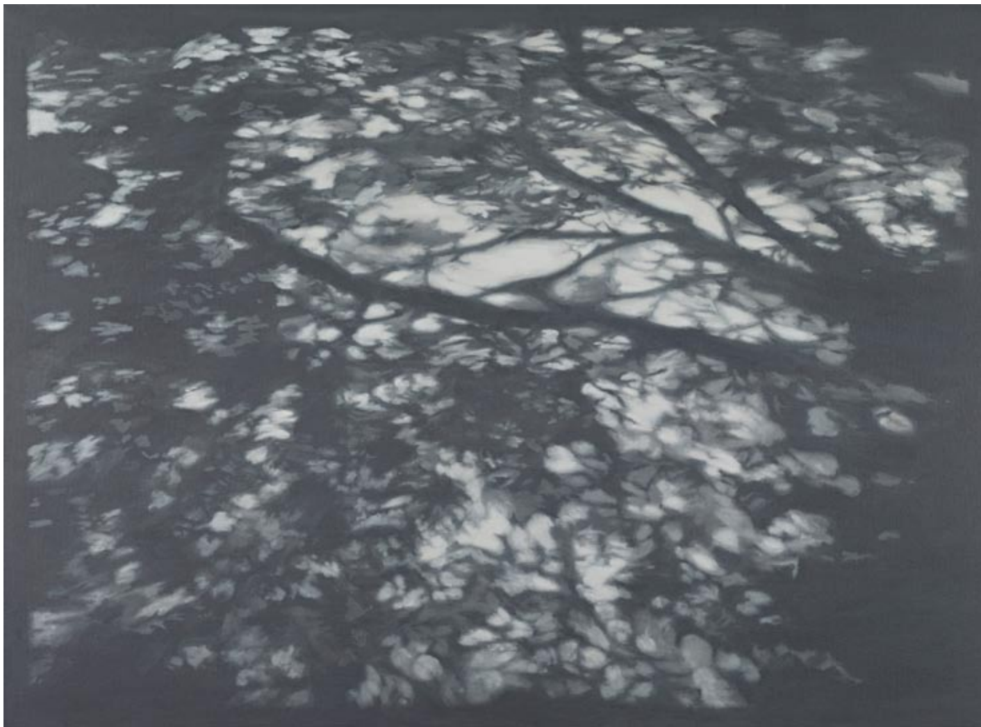
Scene I, Acrylic on canvas, 22 x 30 inches, 2014