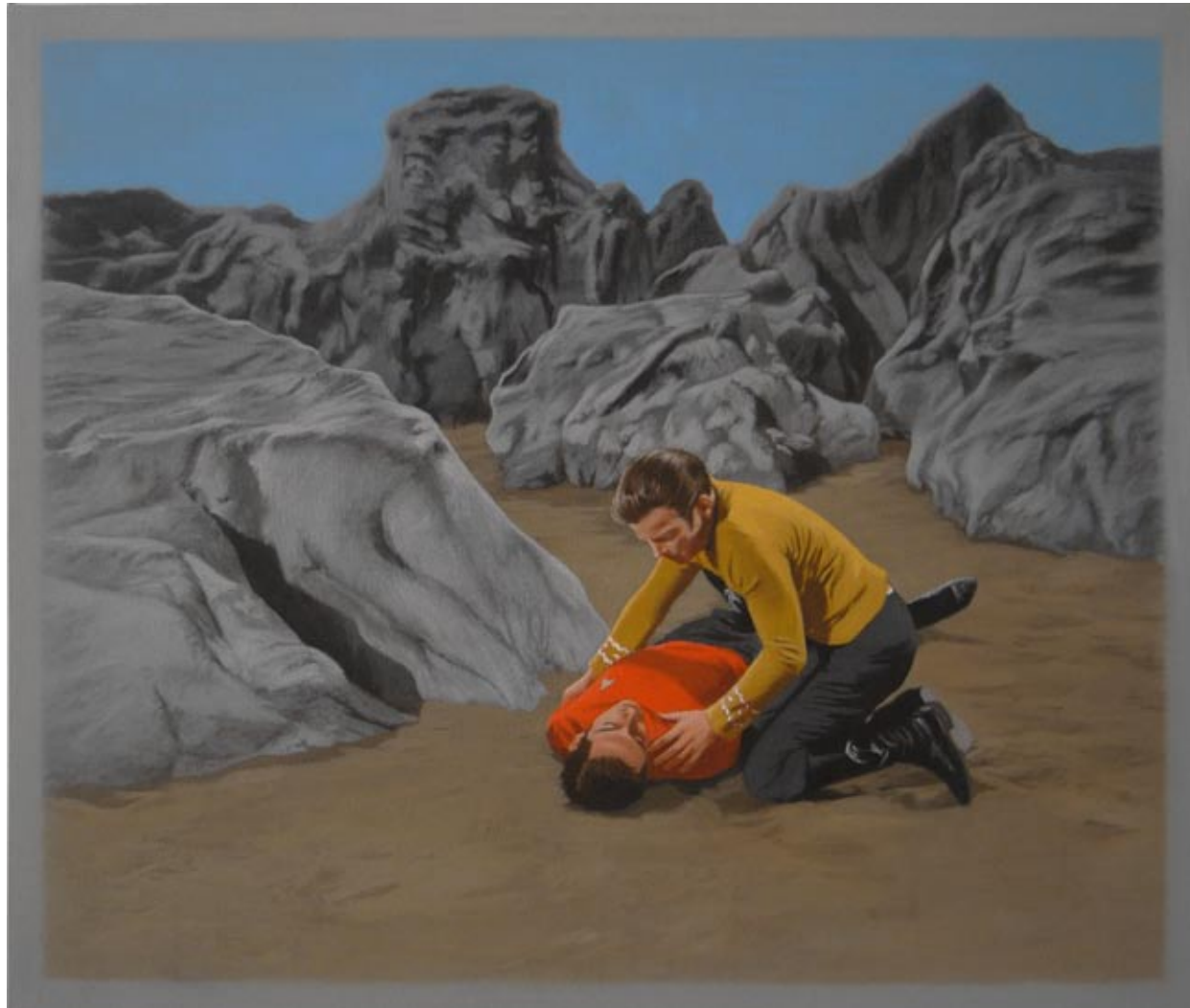
Landing Party IV, Acrylic on canvas, 24 x 28 inches, 2011