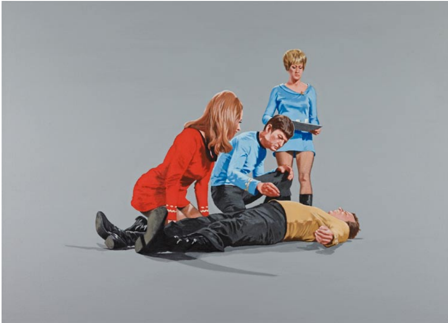
Captain Crew IX, Acrylic on canvas, 23 x 32 inches, 2014