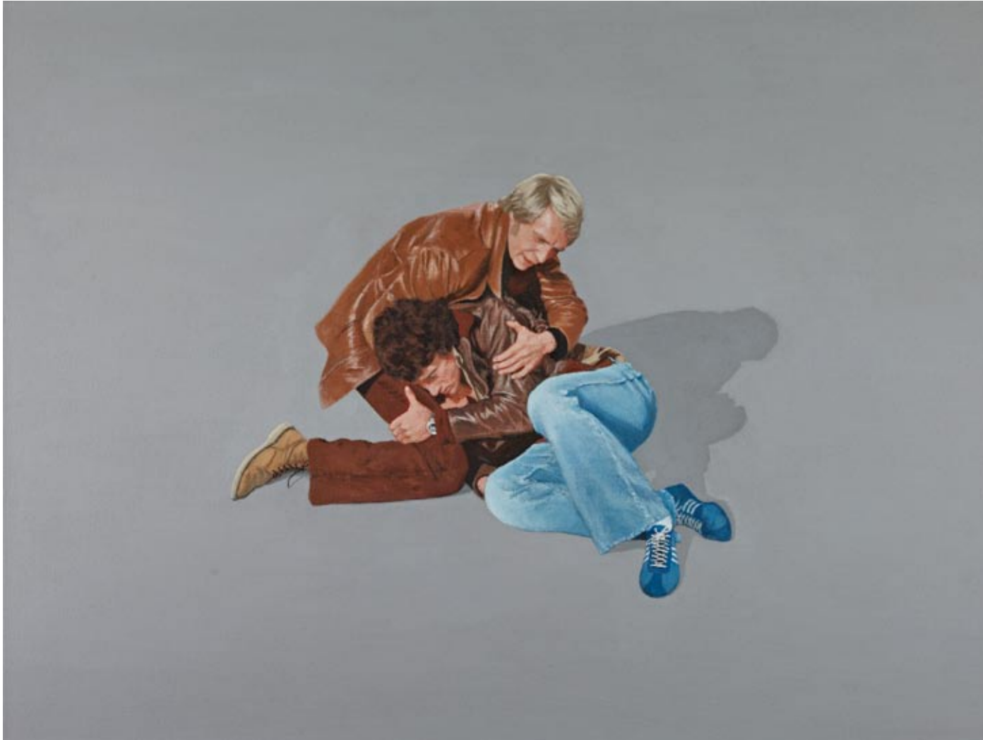
Detectives, Acrylic on canvas, 22 x 29 inches, 2013