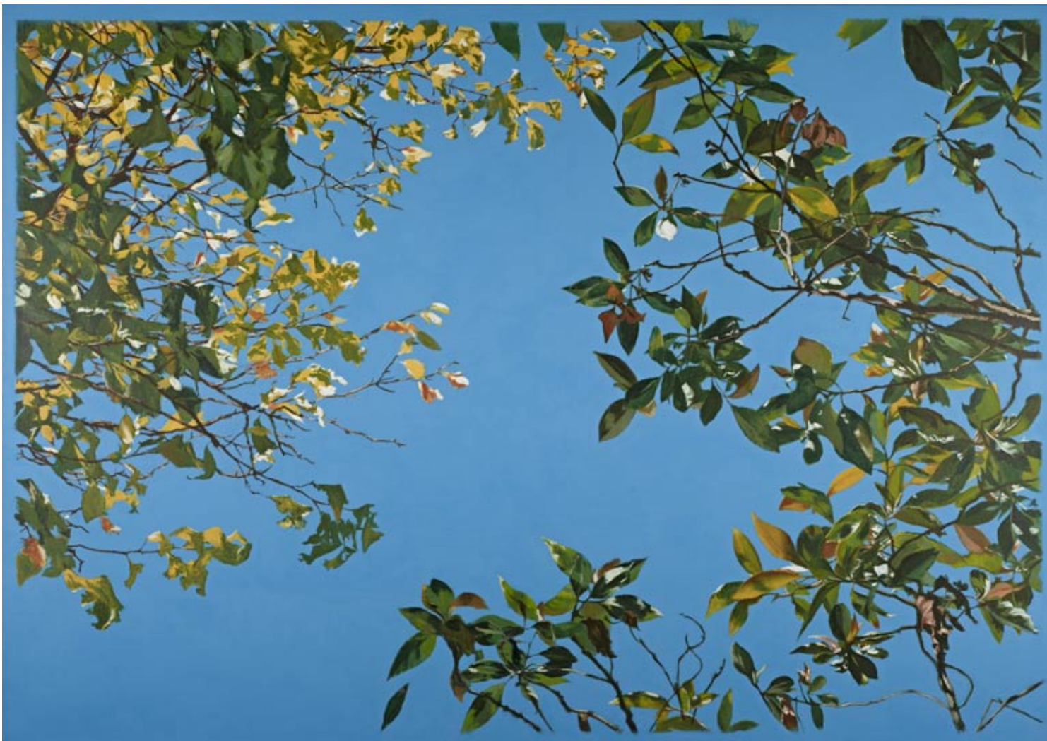
Scene II, Acrylic on canvas, 38 x 54 inches, 2014