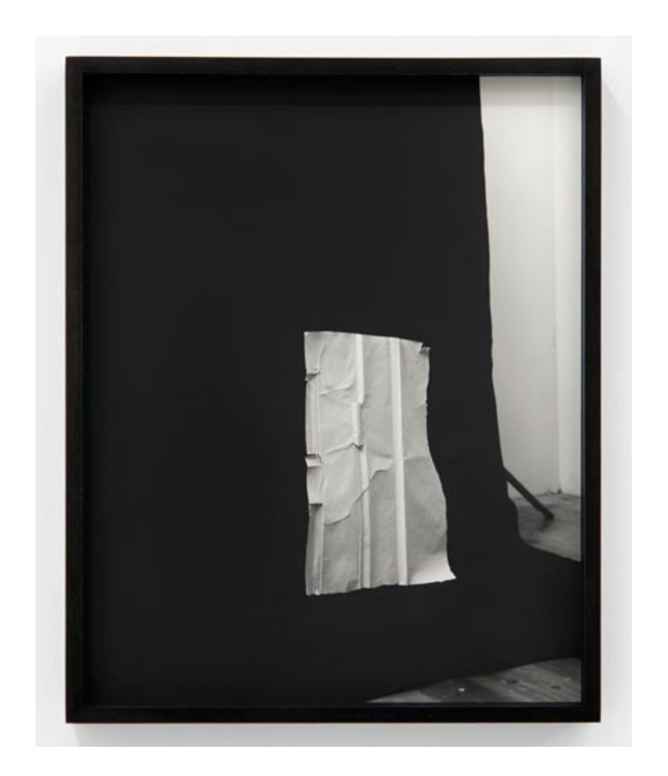
Rooms silver gelatin print 15 1/4 x 12 1/4 inches (framed)