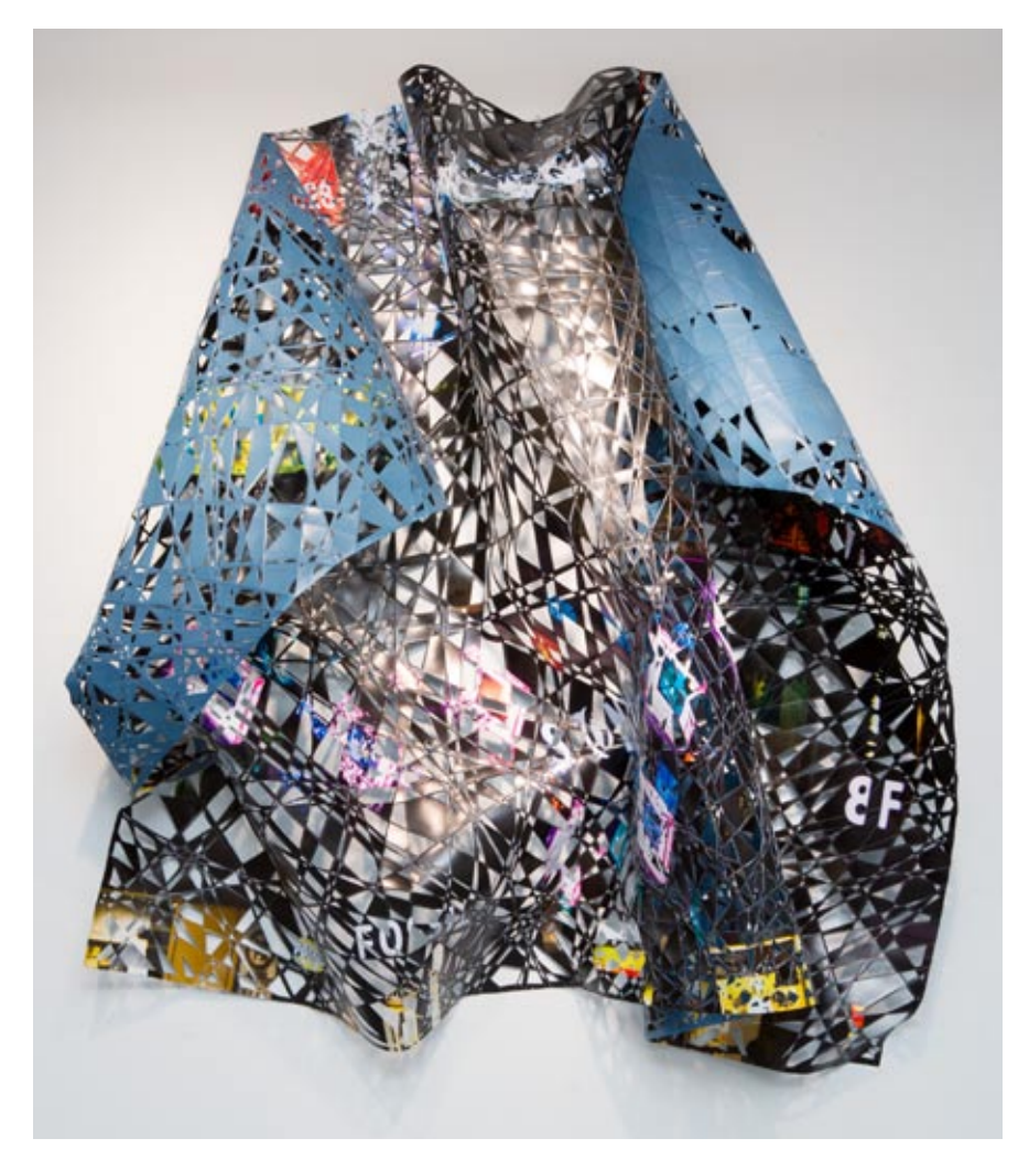
Drift Hand-cut inkjet print, acrylic paint 45 x 37 x 11 inches 2014