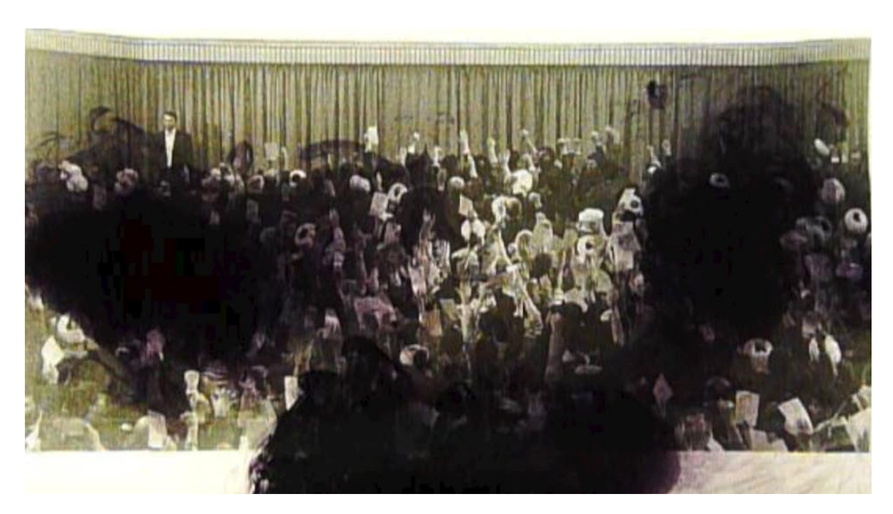
Aporia single channel video, trt 3m27sec, infinite loop Ed. 2/1 AP with artist-inked Arches paper sleeves 2014