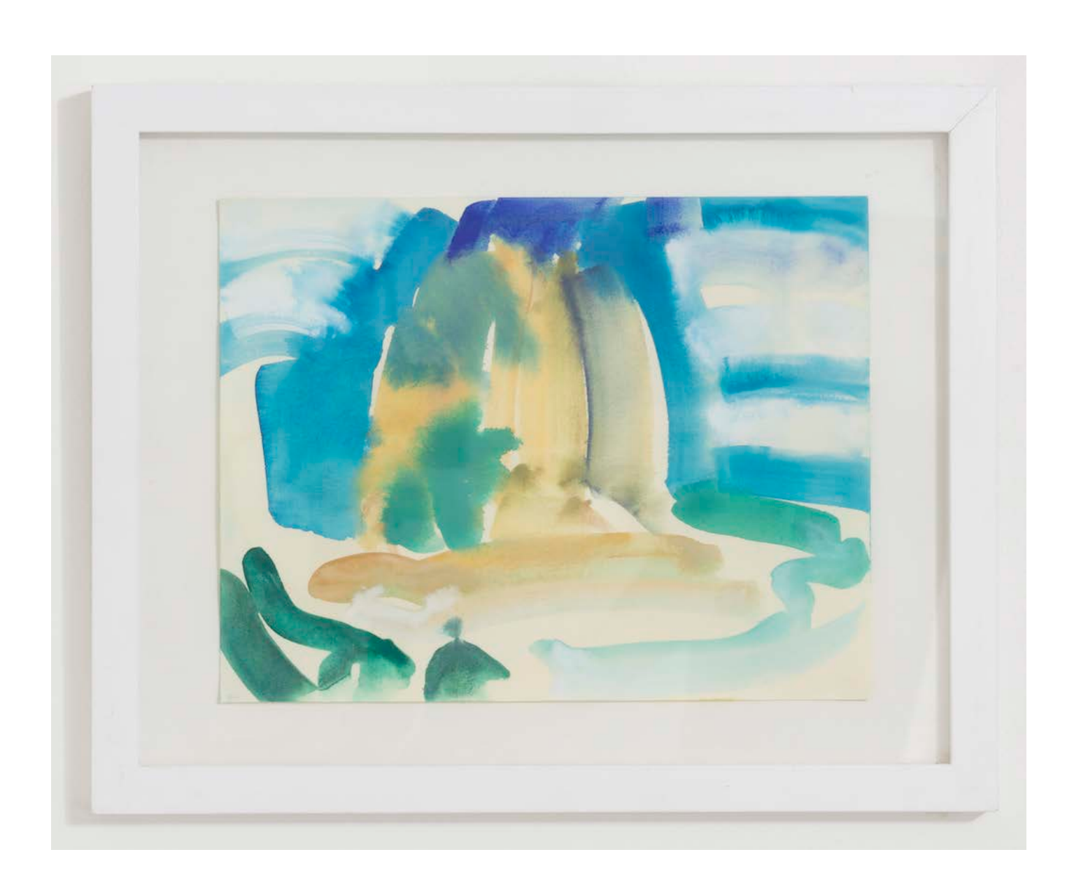
7.9.14 Gouache on paper 12 x 15 inches Framed 2014