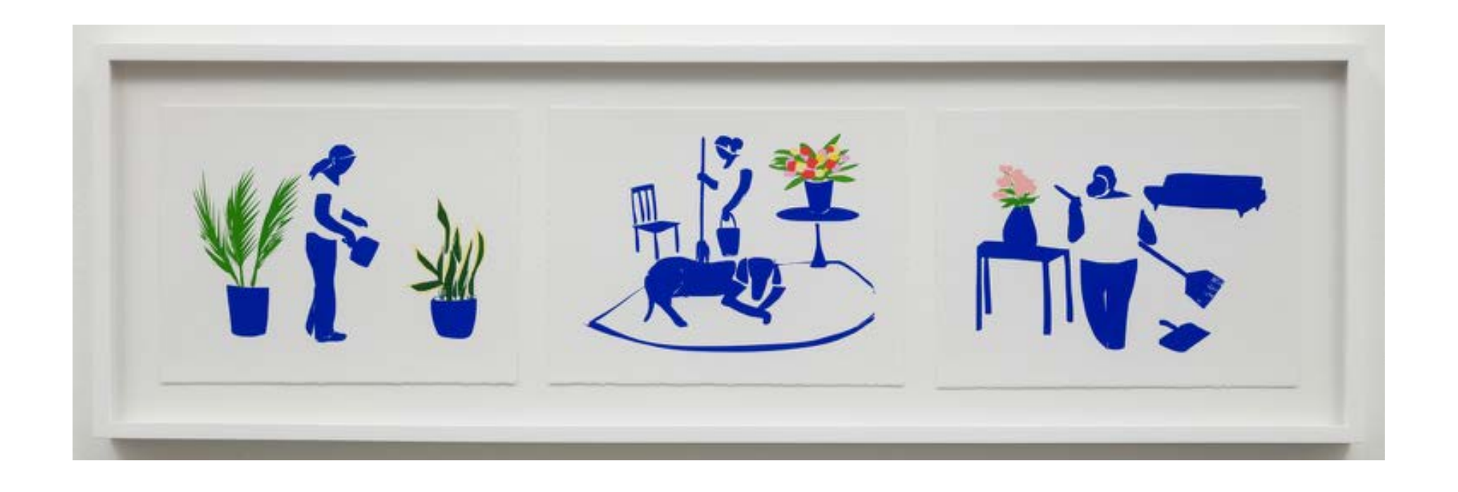
Azul - Three Scenes Three archival pigment prints on paper Edition of 20 w 5 APs Framed: 15 x 30 inches 2019