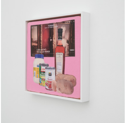
Russian Salad Digital Print on Brushed Suede, Felt, Foam Piece: 22 x 22 x 2 inches Framed: 24 x 24 inches 2019