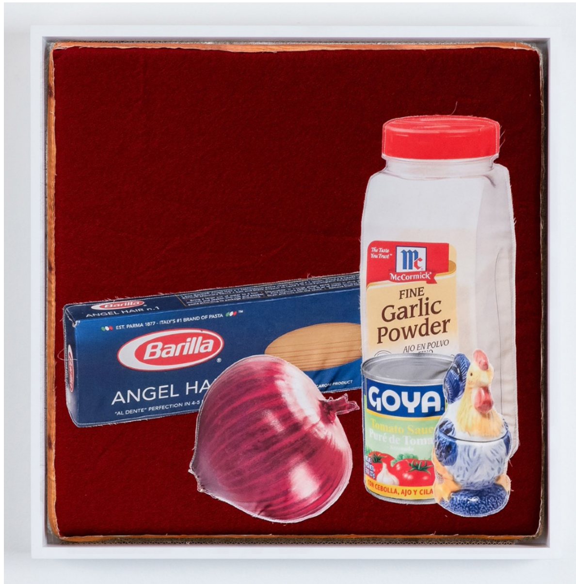
Struggle Dinner Digital Print on Brushed Suede, Felt, Foam Piece: 22 x 22 x 2 inches Framed: 24 x 24 inches 2020