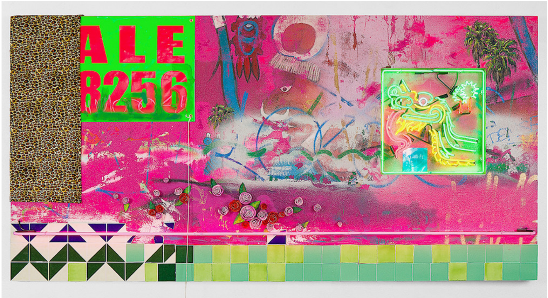
Warrior and Serpent (Huntington Park to Montebello) Stucco, neon, mean streak, ceramic, acrylic paint, spray paint, latex house paint, banner tarp, family archive photo, rope, plush blanket, ceramic tile on panel 60 x 120 inches 2021