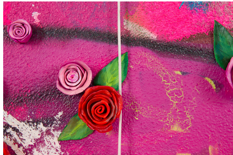
Warrior and Serpent (Huntington Park to Montebello) Details