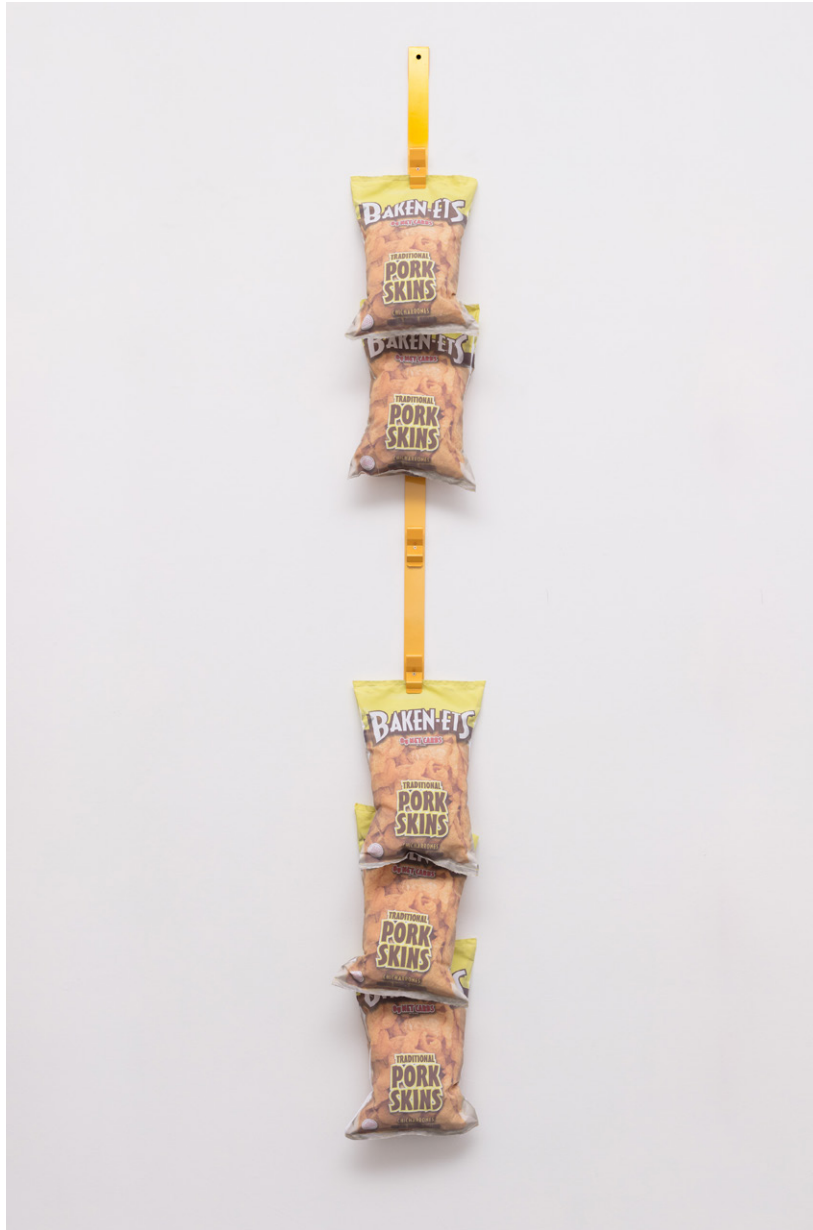
Rack: Chicharrones Digital print on brushed nylon, foam, and powder coated aluminum 96 x 12 x 7 inches 2019