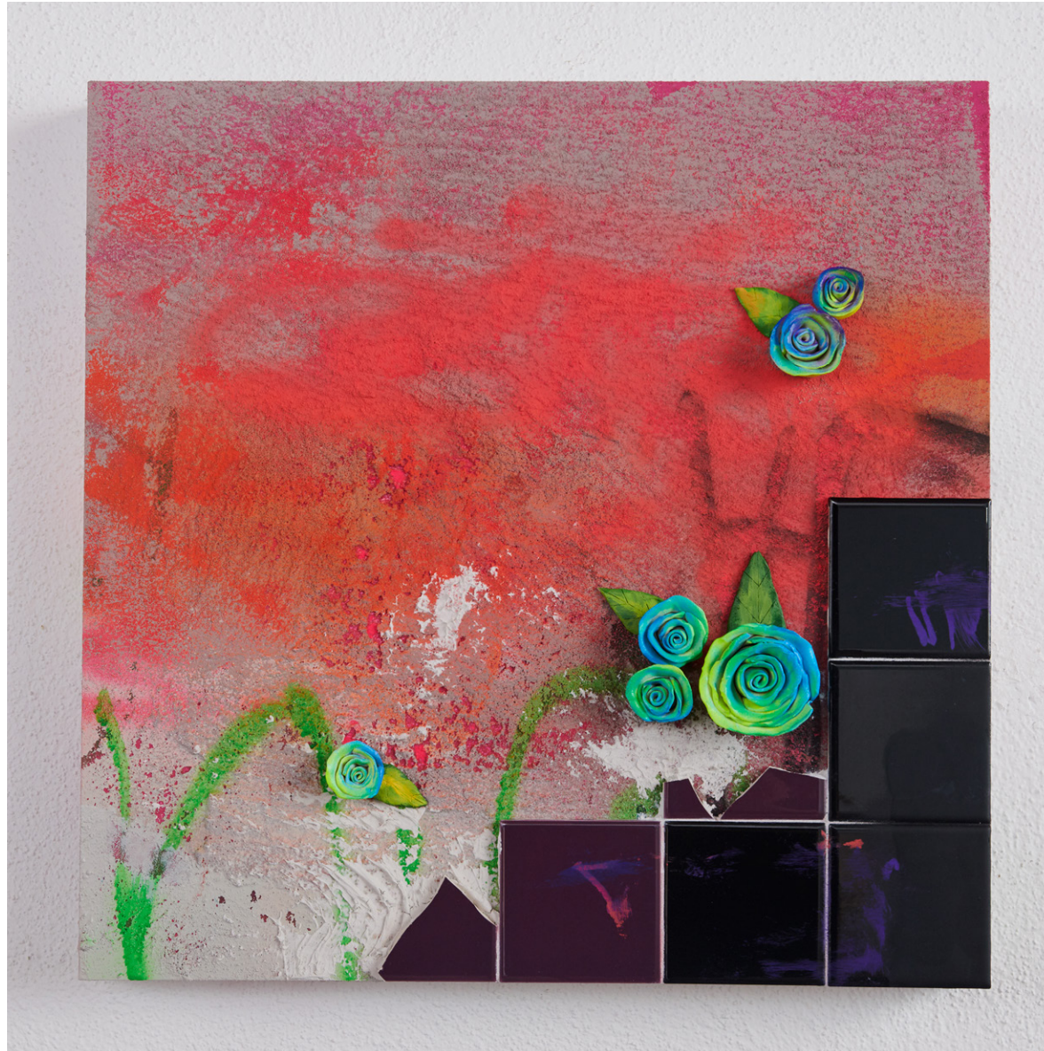
Atwater Summer Sunset 3 Stucco, ceramic, ceramic tile, acrylic paint, tile adhesive, mean streak, spray paint and latex house paint on panel 24 x 24 inches 2021