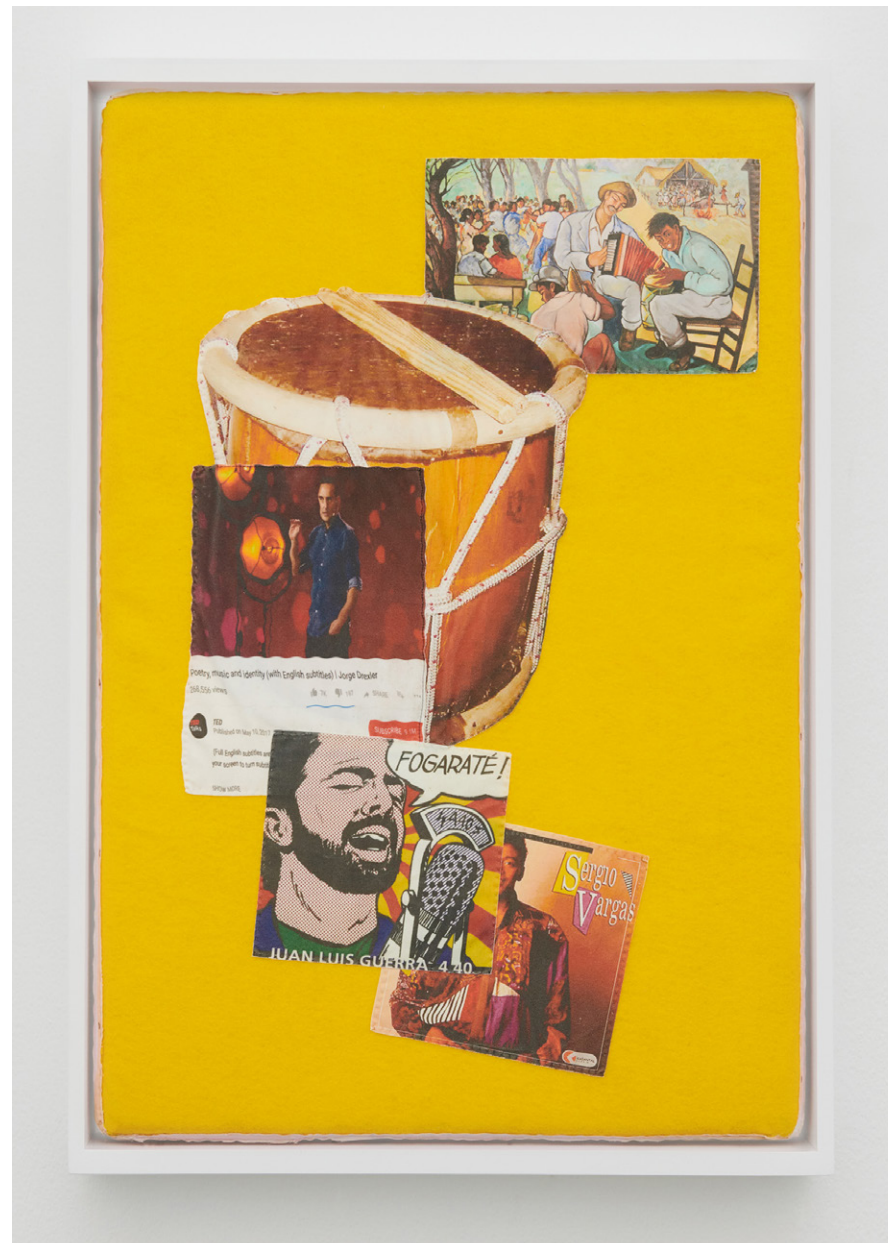
Poetry, Music & Identity Digital Print on Fabric, Felt, Stretched on Foam 36 x 24 x 2 inches Framed 2018