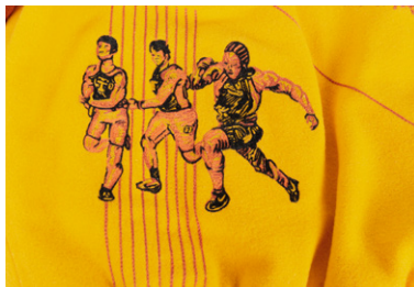
Pee Chee Varsity Jacket (Orange) Custom wool varsity jacket and custom chain stitch embroidery Dimensions variable 2020