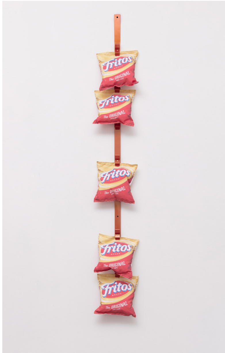
Rack: Corn Chips Digital print on brushed nylon, foam, and powder coated aluminum 96 x 12 x 7 inches 2019