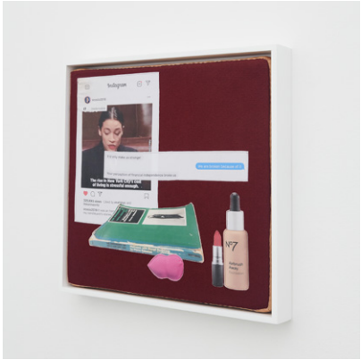
Ruby Red Digital Print on Brushed Suede, Felt, Foam Piece: 22 x 22 x 2 inches Framed: 24 x 24 inches 2019