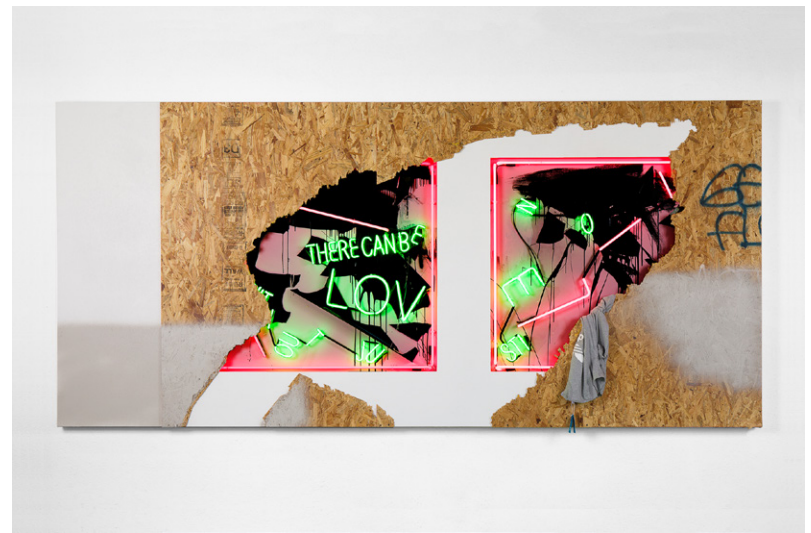
No Justice, No Love Details