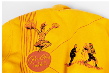
Pee Chee Varsity Jacket (Yellow) Custom wool varsity jacket and custom chain stitch embroidery Dimensions variable 2020