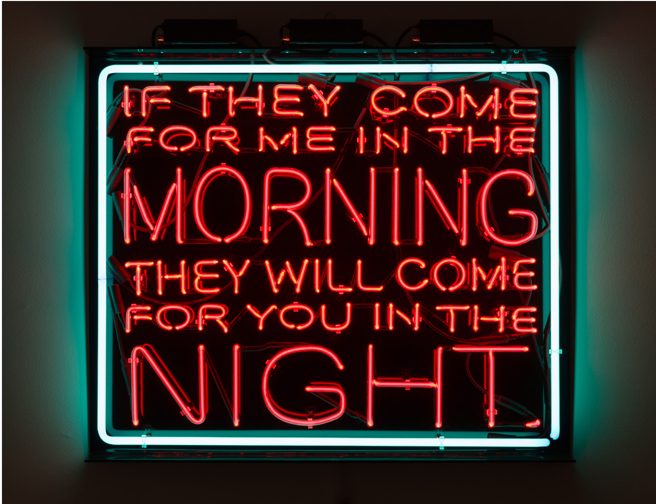
Morning and Night (James Baldwin & Angela Davis) Neon on plexiglass 30 x 36 inches Edition of 3 2018