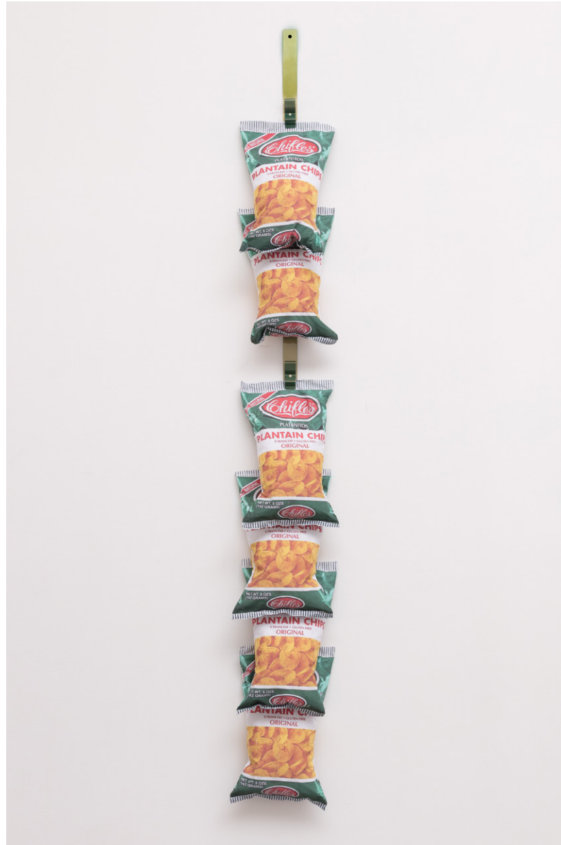
Rack: Platanitos Digital print on brushed nylon, foam, and powder coated aluminum 96 x 12 x 7 inches 2019