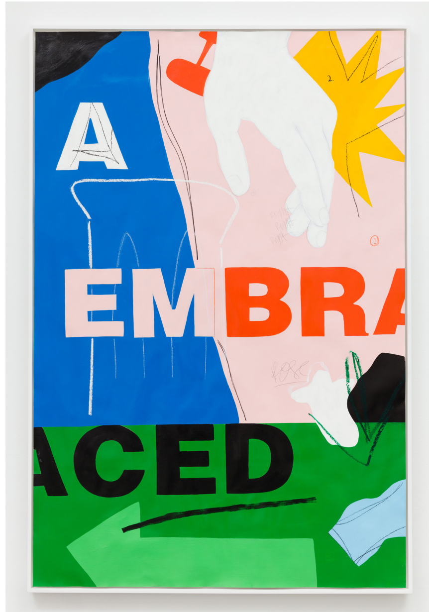
A Hand Embraced Acrylic, sharpie, pencil, oil pastel on paper 72 x 48 inches Framed 2018