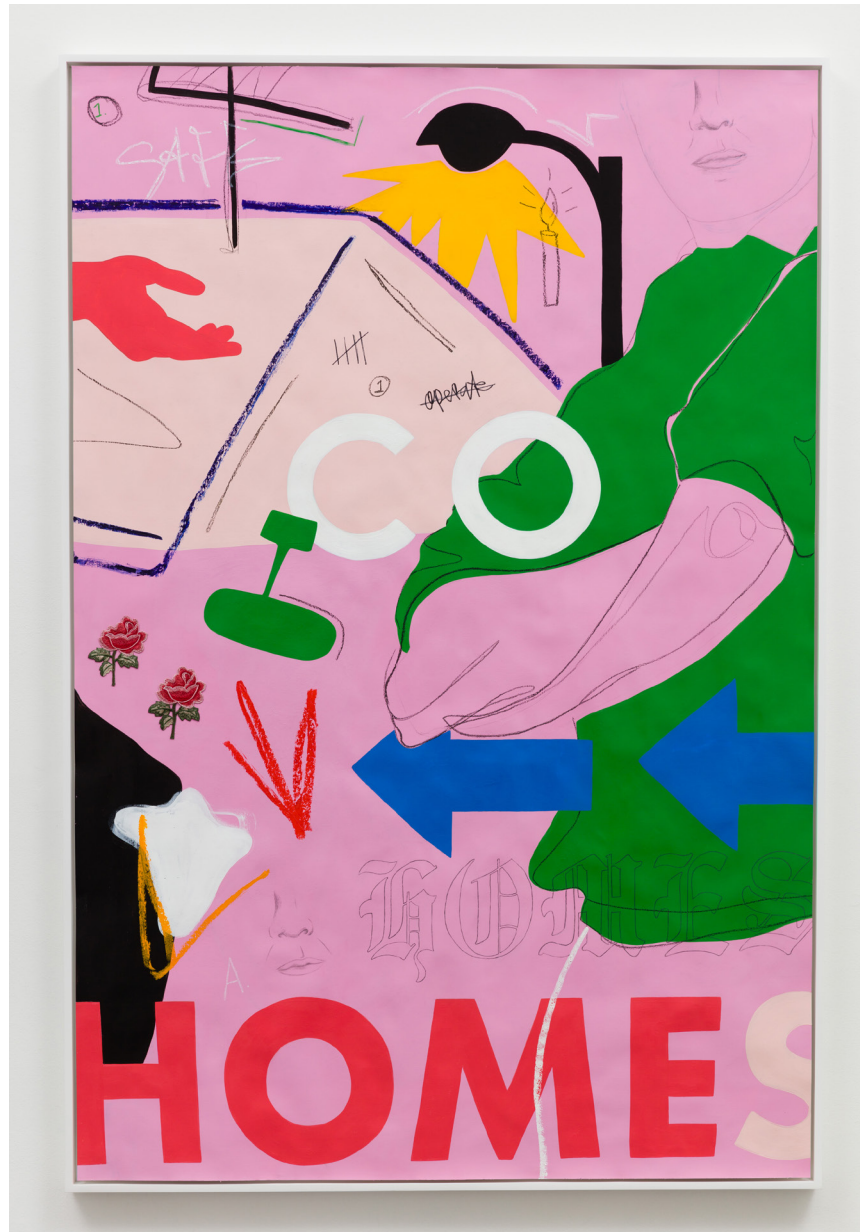
Homes Acrylic, sharpie, oil pastel and embroidered appliqués on paper 72 x 48 inches Framed 2018