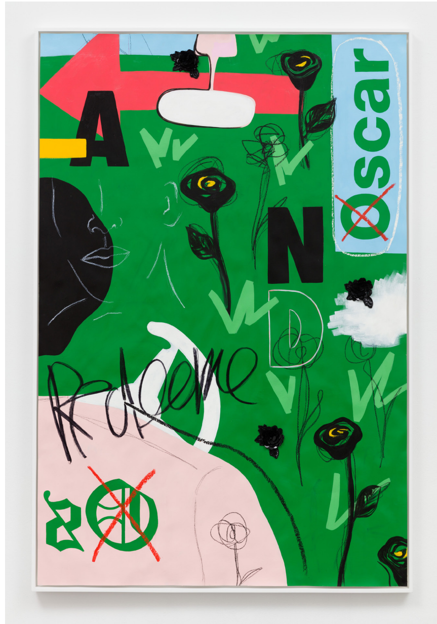
Wilde Flowers Acrylic, sharpie, pencil, oil pastel, sequined appliques on paper 72 x 48 inches Framed 2018