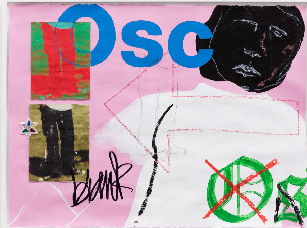
Oscar Not Oscar Acrylic, oil pastel, sharpie, pencil, photo transfer on canvas, and sequined appliqué on paper 22.5 x 30 inches 2018