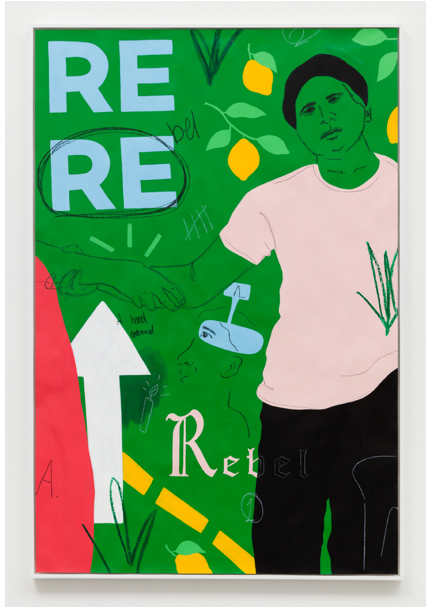
Rebel Rebel Acrylic, sharpie and oil pastel on paper 72 x 48 inches Framed 2018