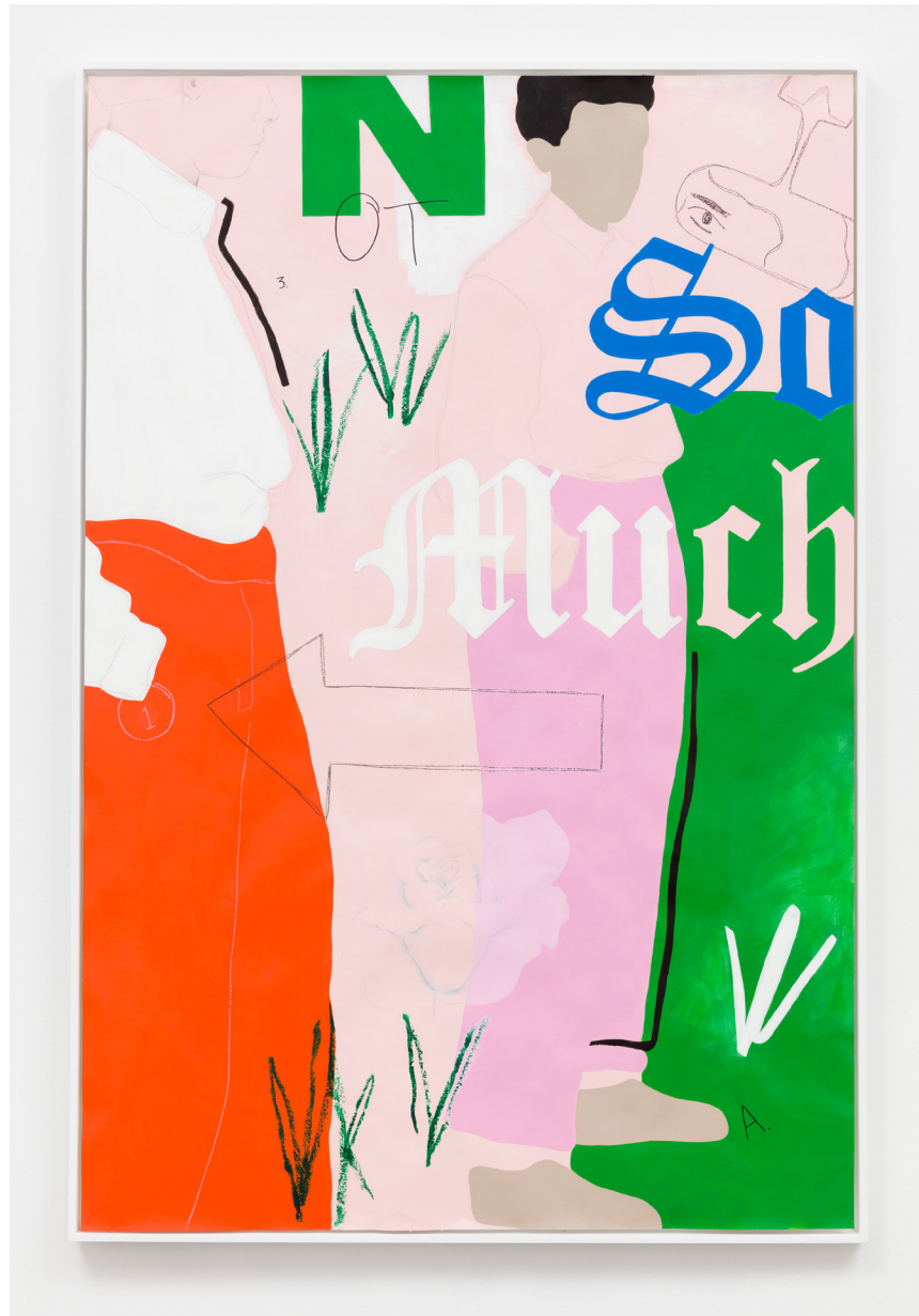
So Much, Too Much Acrylic, sharpie, pencil, oil pastel on paper 72 x 48 inches Framed 2018