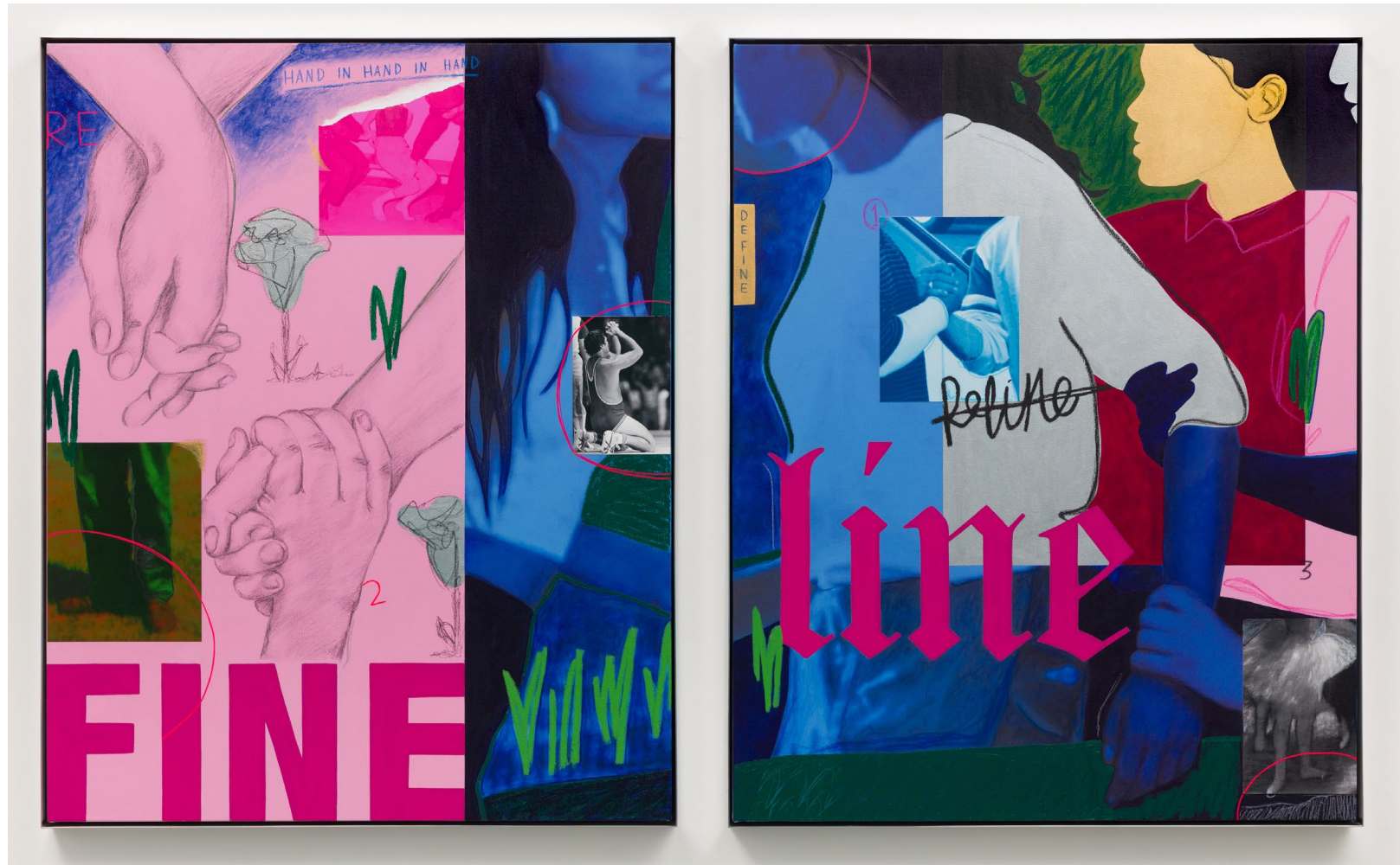
Define, Fine, Refine Acrylic, oil stick, graphite, oil pastel, archival pigment prints on two canvases in high polished aluminum frames 60 x 48 inches each 60 x 93 inches (as installed) 2020