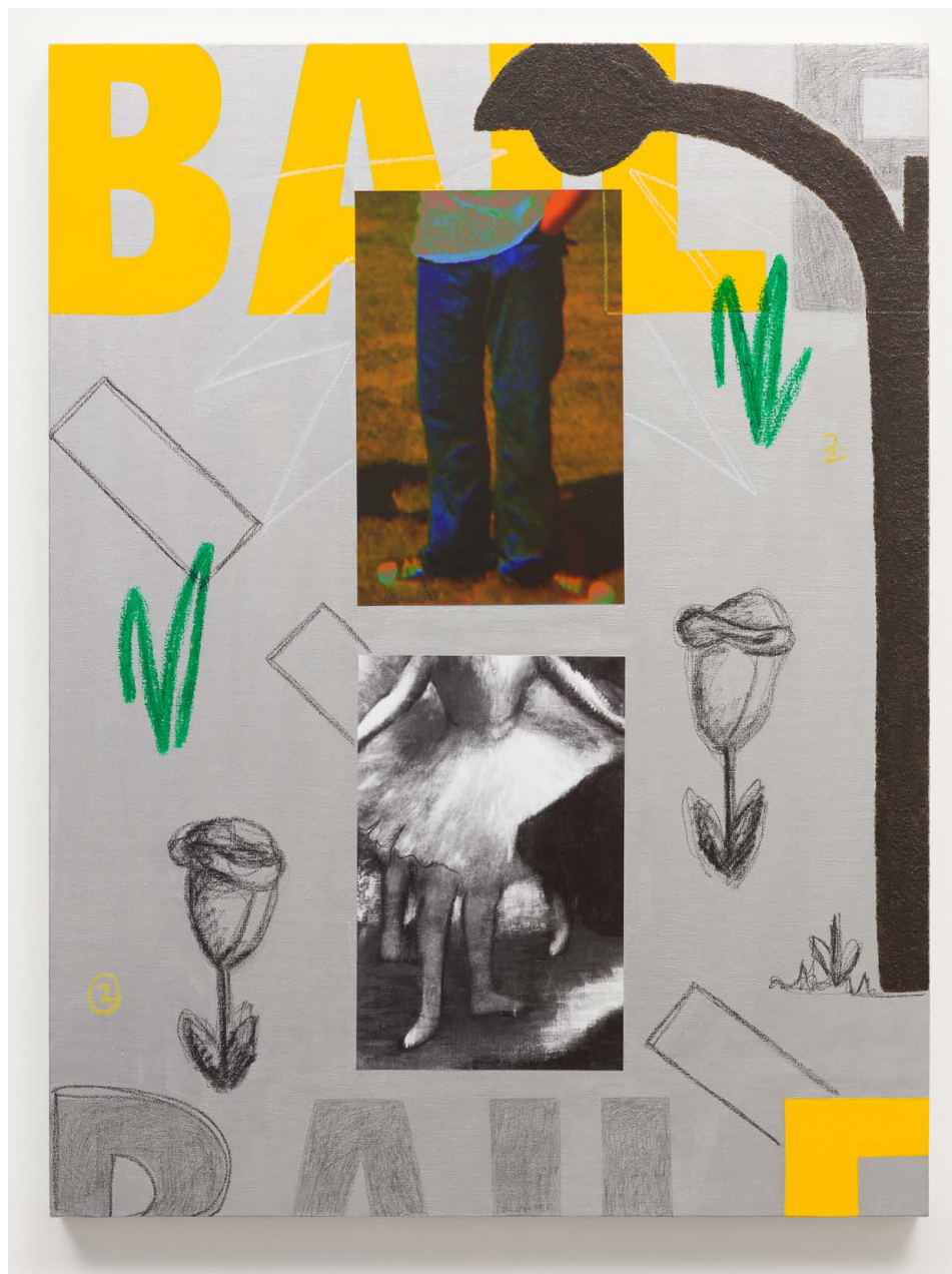
Bail / Baile Acrylic, oil stick, oil pastel, graphite and archival pigment prints on canvas 48 x 36 inches 2019