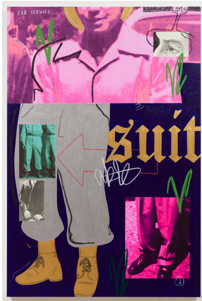
Suitable Acrylic, oil stick, graphite, oil pastel, archival pigment prints on canvas 72 x 48 inches 2019