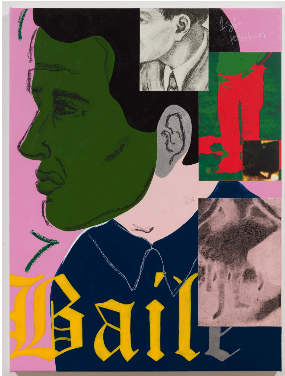
First and Second Acrylic, oil stick, oil pastel, screenprints and archival pigment prints on canvas 48 x 36 inches 2019