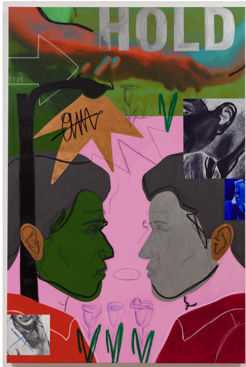
Hold Your Own Acrylic, oil stick, graphite, oil pastel, ballpoint pen, archival pigment prints on canvas 72 x 48 inches 2019