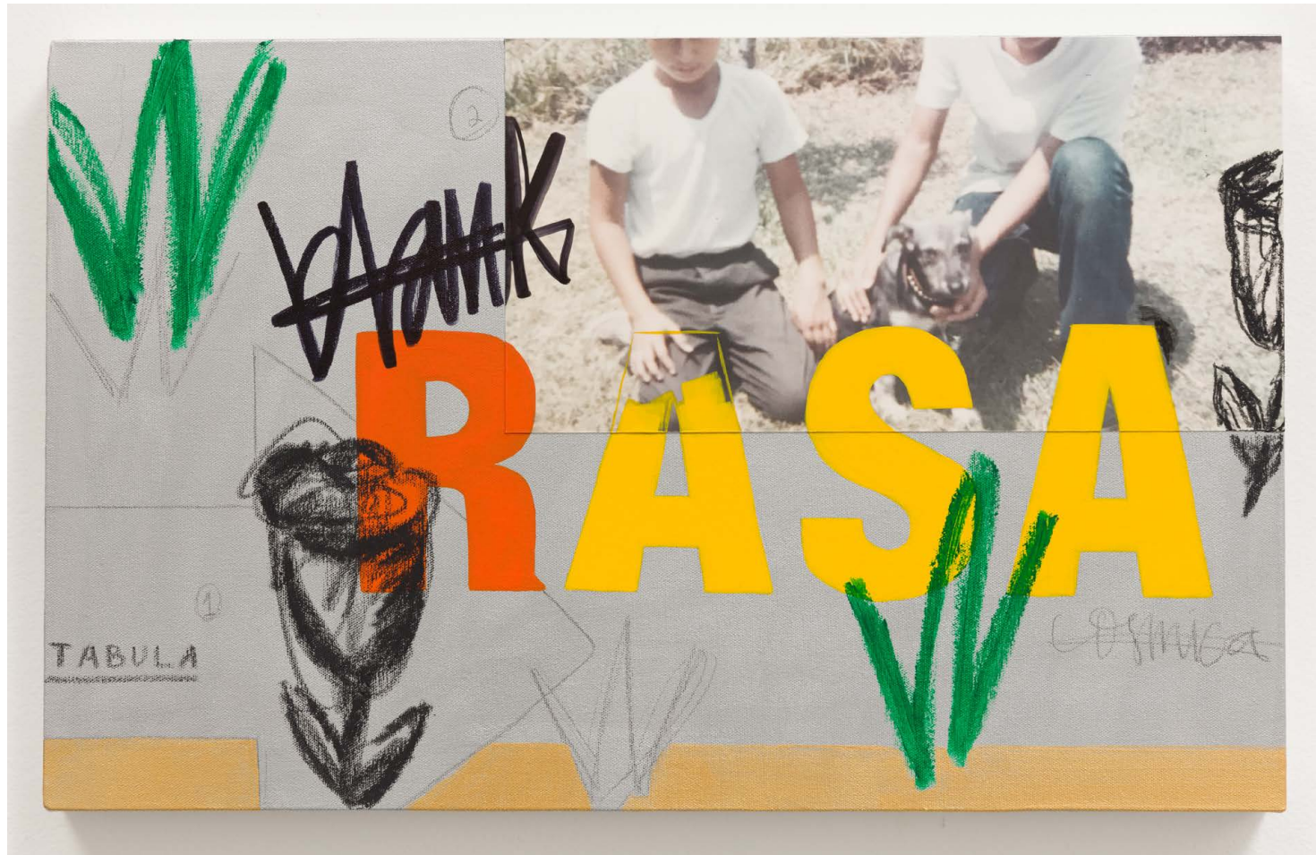
Rasa / Raza Acrylic, archival photographic print, sharpie, graphite and oil stick on canvas 15 x 24 inches 2019