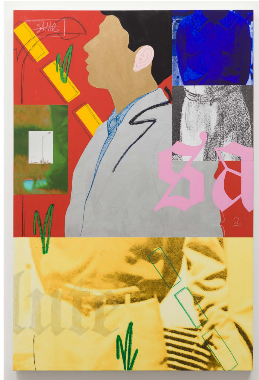
SA (Salute) Acrylic, oil stick, graphite, oil pastel, archival pigment prints on canvas 72 x 48 inches 2019