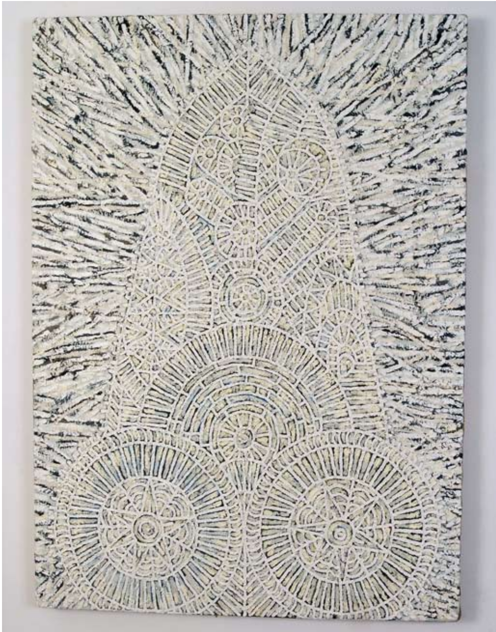
Muquarnas III, 2012 Oil on hessian 48 x 36 inches