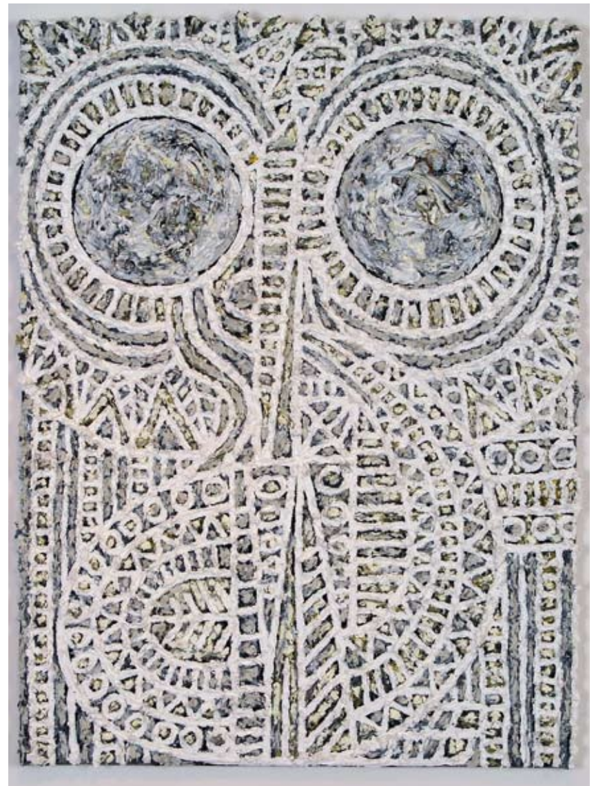
Jinn II, 2012 Oil on canvas 18 x 24 inches