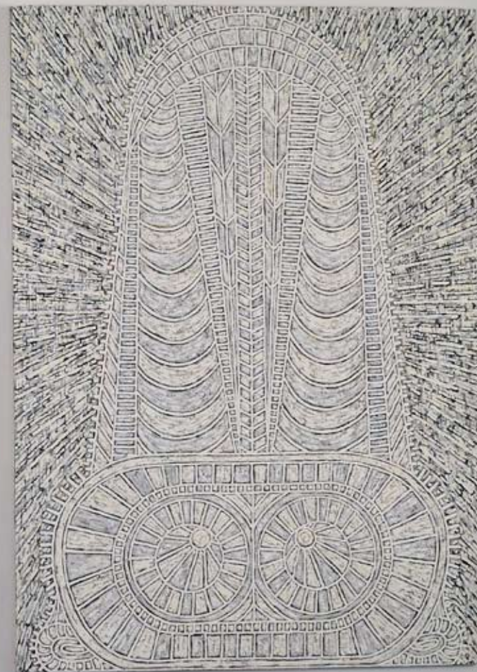
Tower I, 2012 Oil on canvas 84 x 60 inches