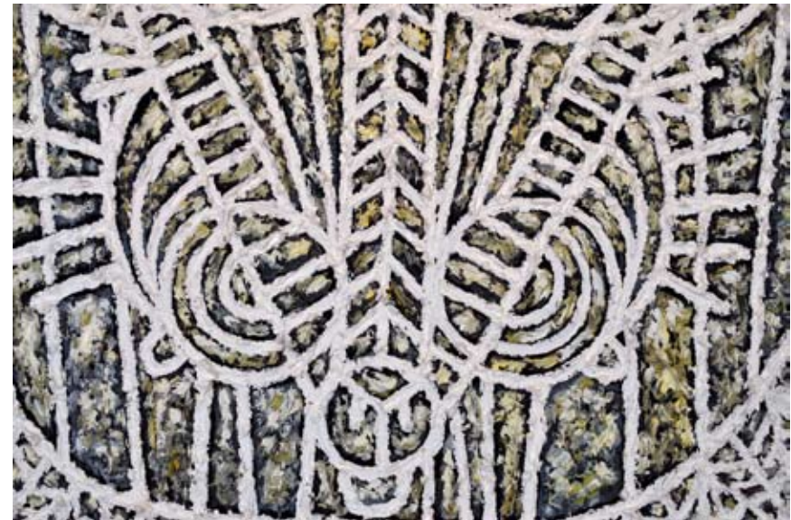
Jinn III, 2012 Oil on canvas 18 x 24 inches