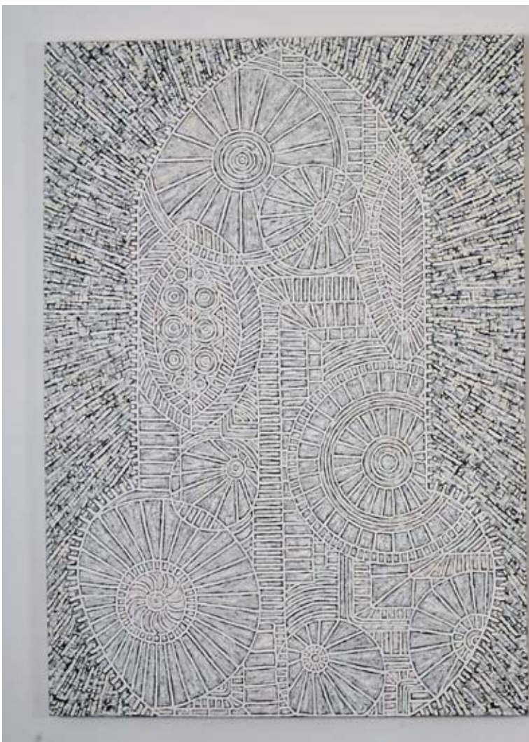
Tower II, 2012 Oil on canvas 84 x 60 inches