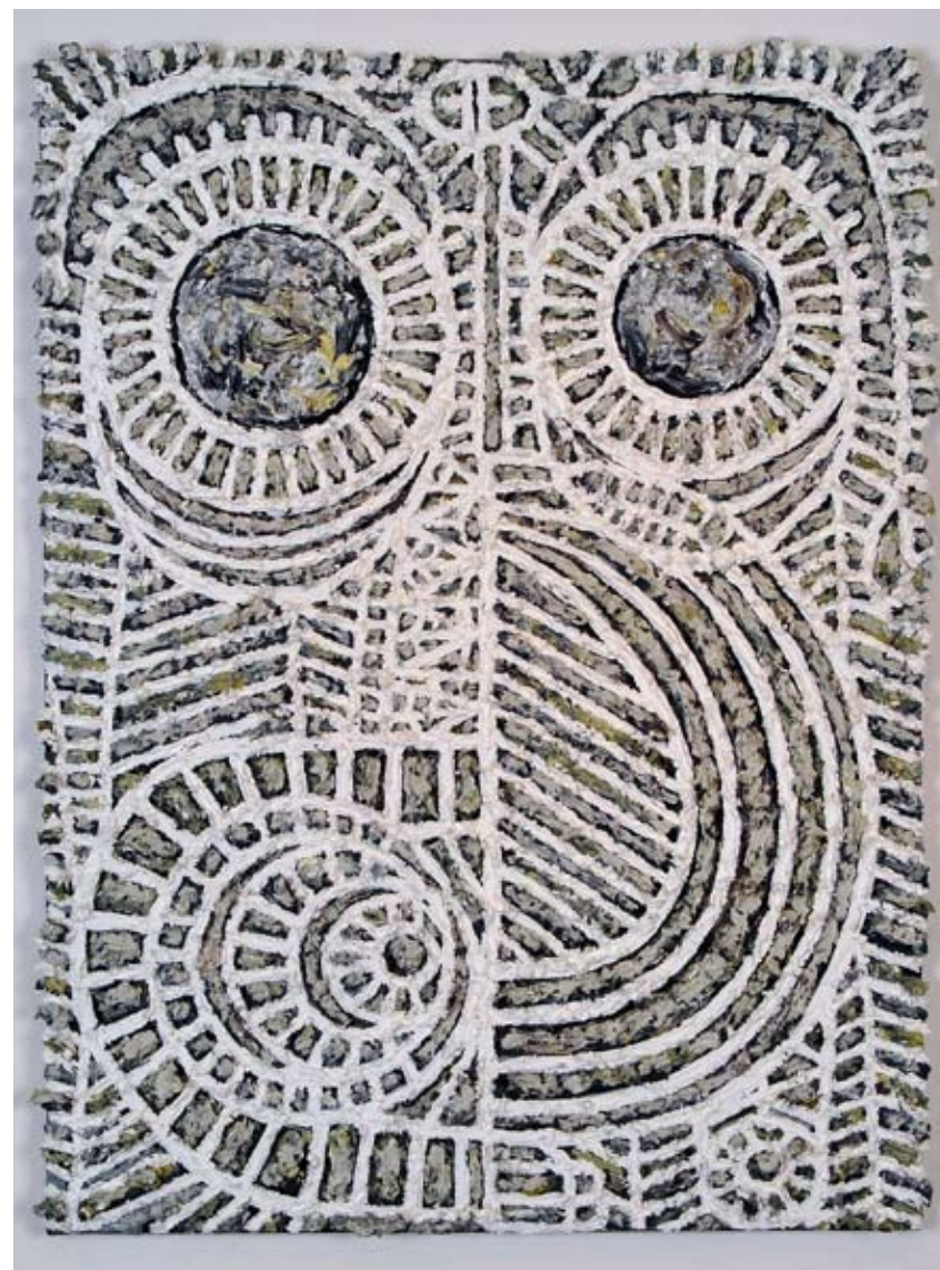
Jinn V, 2012 Oil on canvas 18 x 24 inches