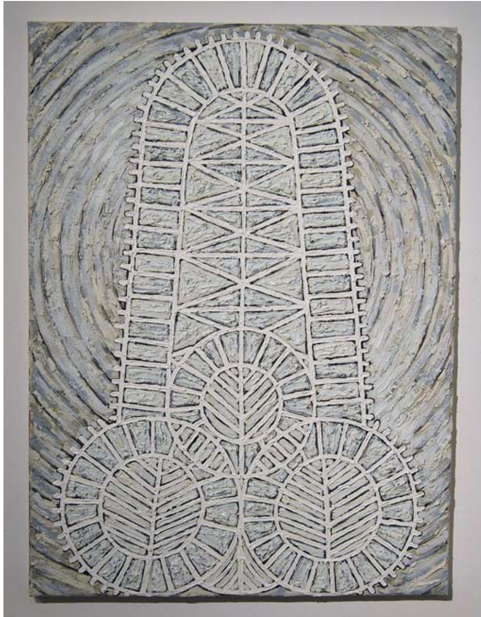
Small Monolith, 2012 Oil on canvas 18 x 24 inches