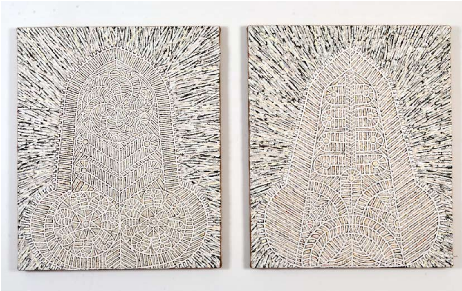
Bride VII, 2012 Oil on burlap and canvas 30 x 25 inches