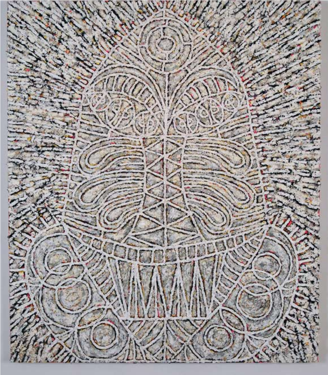
Vessel II, 2012 Oil on canvas 40 x 48 inches