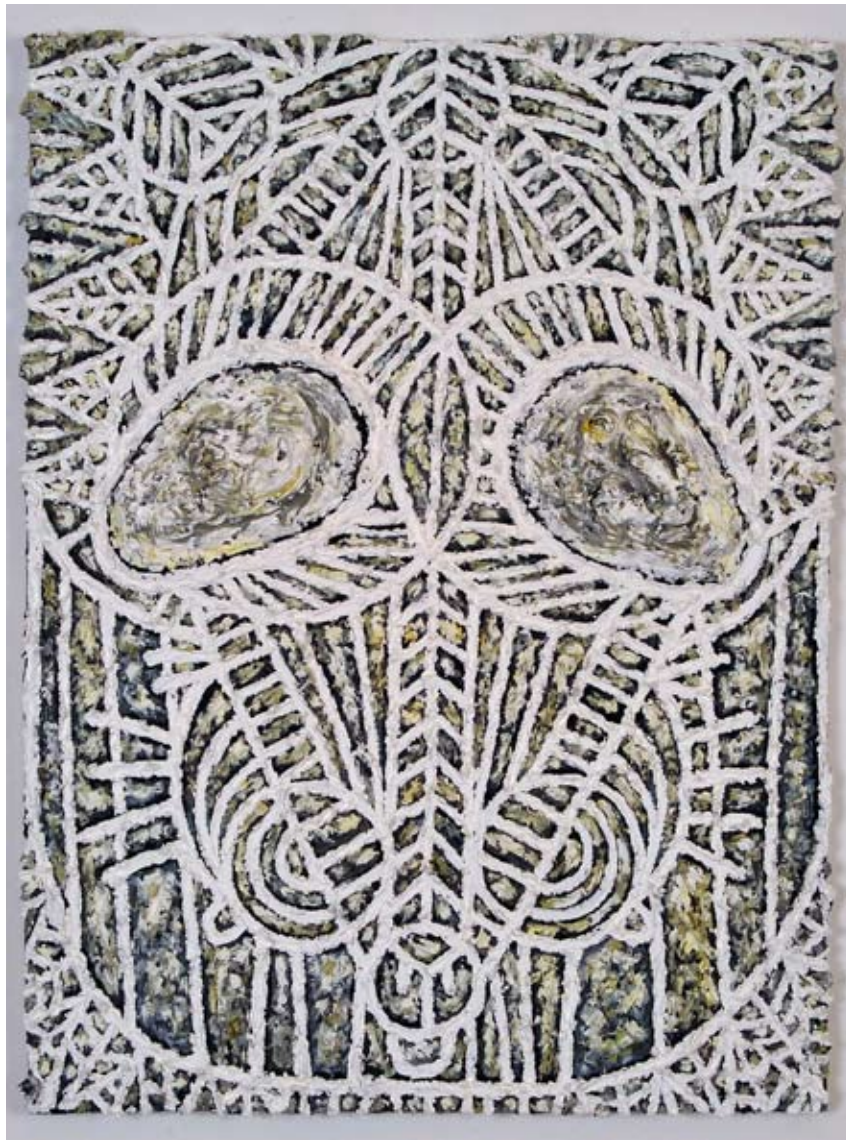
Jinn I, 2012 Oil on canvas 18 x 24 inches