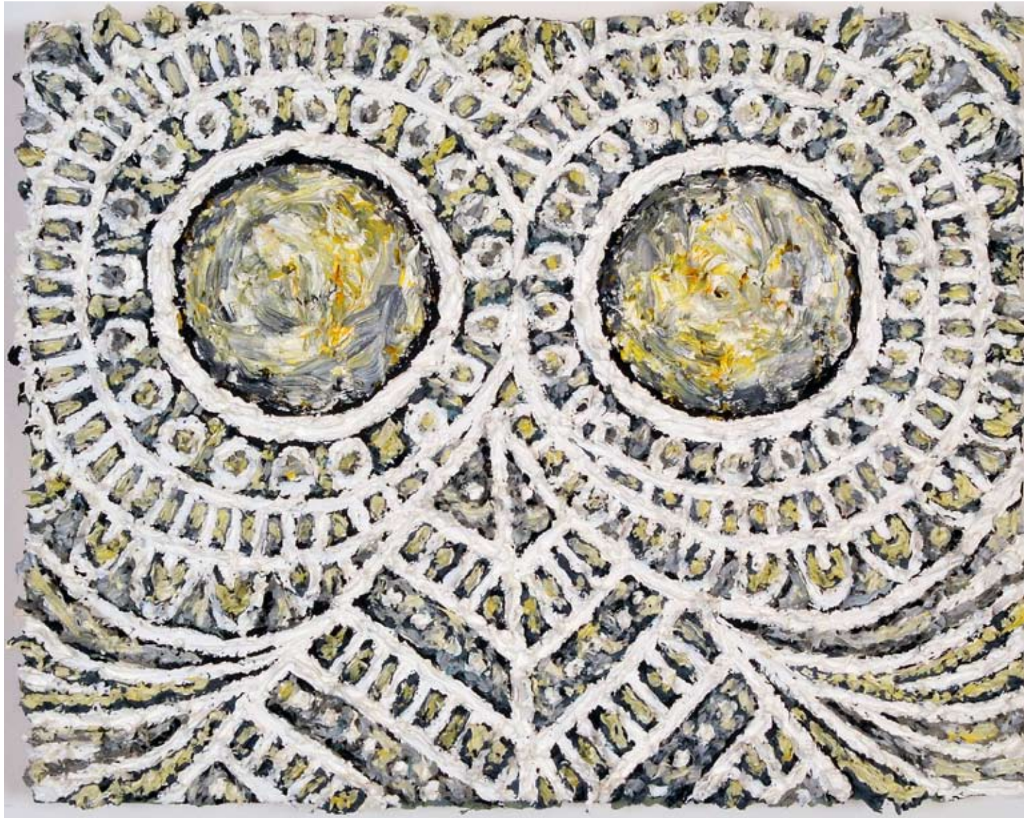
Little Jinn 2012 Oil on canvas 14 x 11 inches