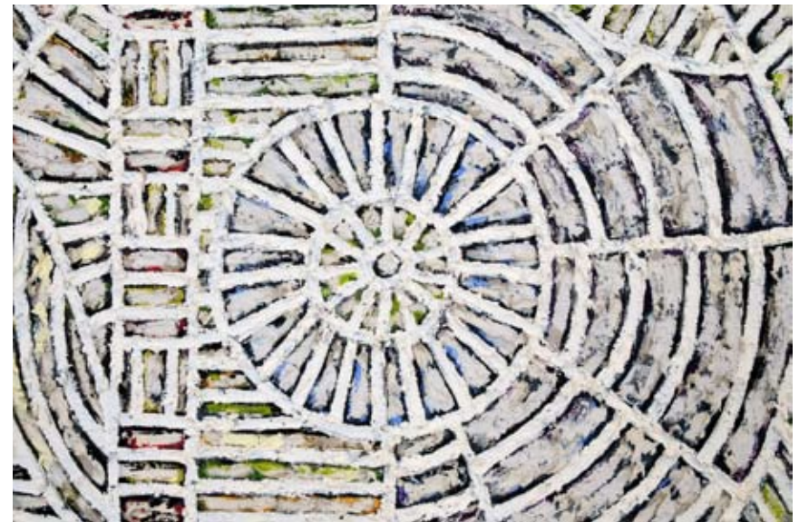
Bride III, 2012 Oil on canvas 72 x 60 inches