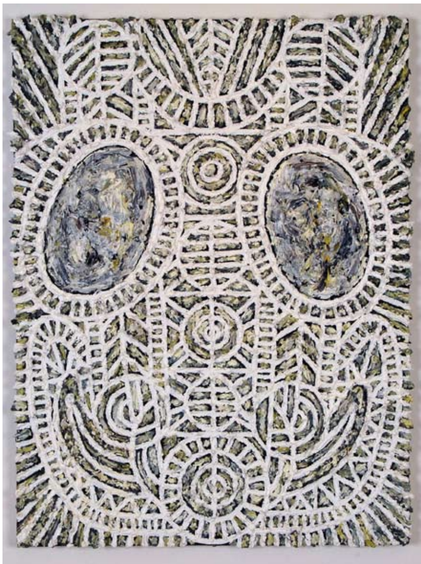
Jinn IV, 2012 Oil on canvas 18 x 24 inches