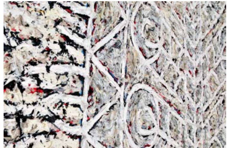
Vessel I, 2012 Oil on canvas 40 x 48 inches