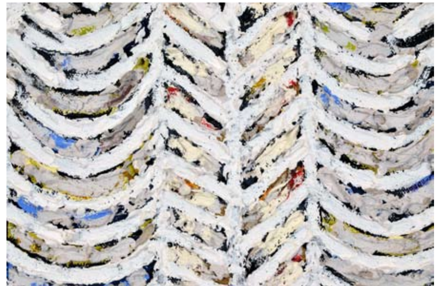
Muquarnas I, 2012 Oil on canvas 72 x 60 inches