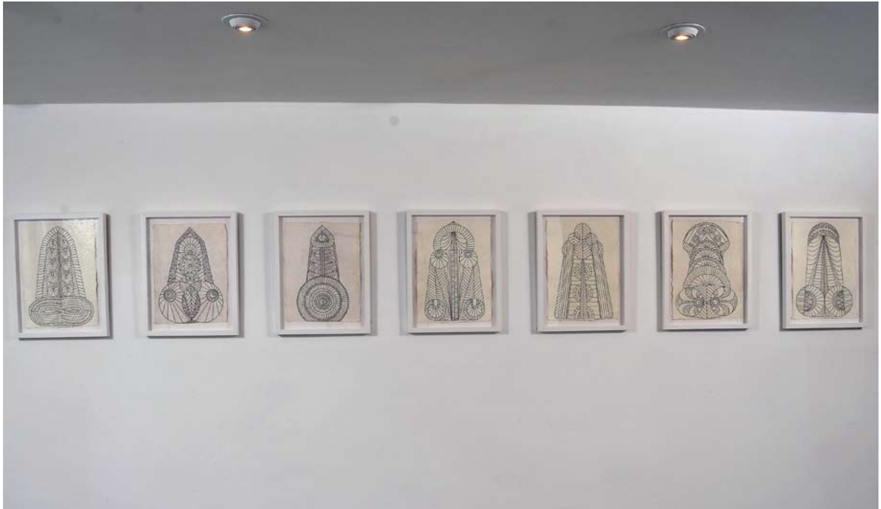
Untitled I-VII, 2012 Nero Lead on handmade paper 12 x 16 inches/each