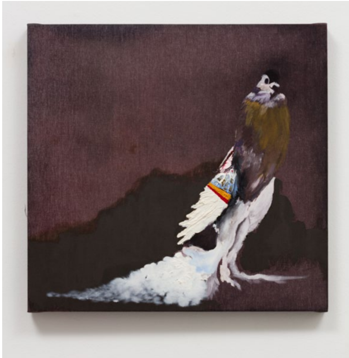
The Rev. Volume 1 Oil, acrylic, and dye on canvas 18 x 24 inches 2016