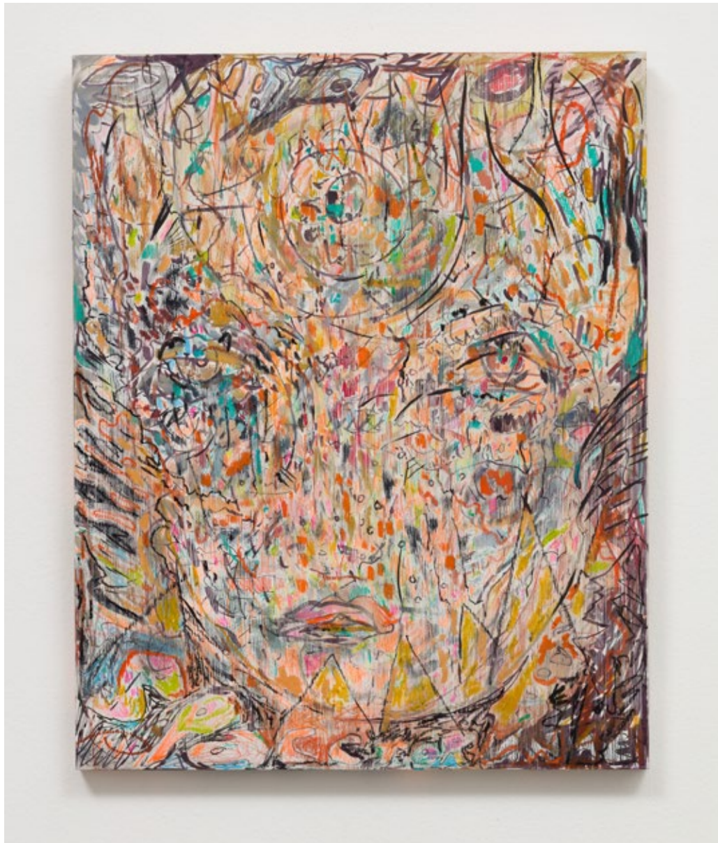
Space Oil paint, pastels, and colored pencil on panel 16 x 20 inches 2017