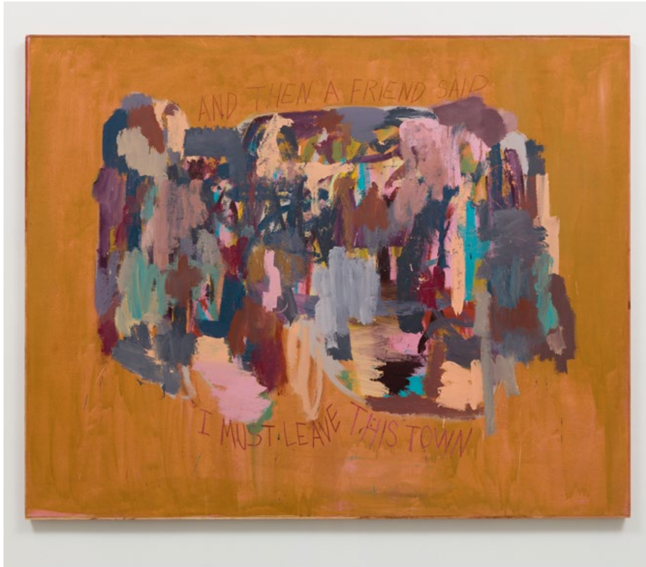
Too Much Dirty Here Acrylic and crayon on canvas 65.5 x 84 inches 2017