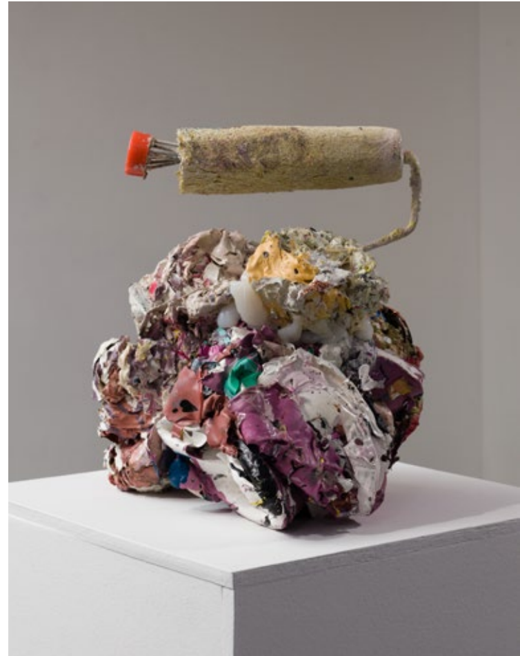
My Tank Is Better Than Your Tank acrylic, silicone, glitter, and paint roller 13 x 13 x 13 Inches 2017