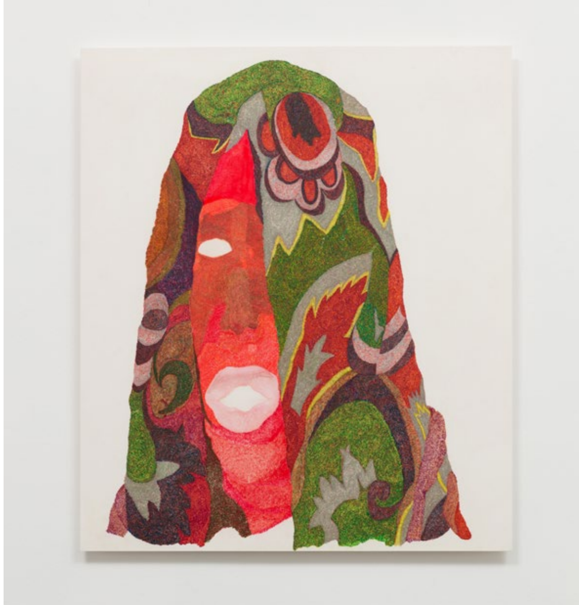
Embers Pencil and acrylic on Mylar, mounted on Sintra 36 x 40 inches 2011