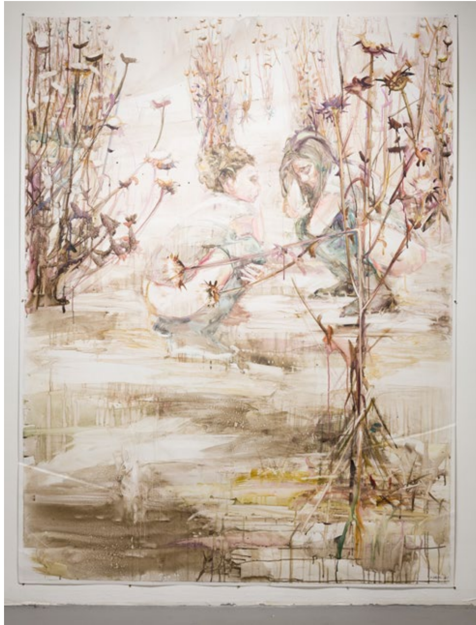
Drought Tolerance Watercolor and gouache on paper 80 x 60 inches 2017