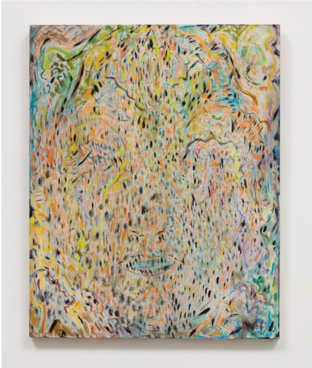
Allover again Oil paint, pastels, and colored pencil on panel 16 x 20 inches 2017