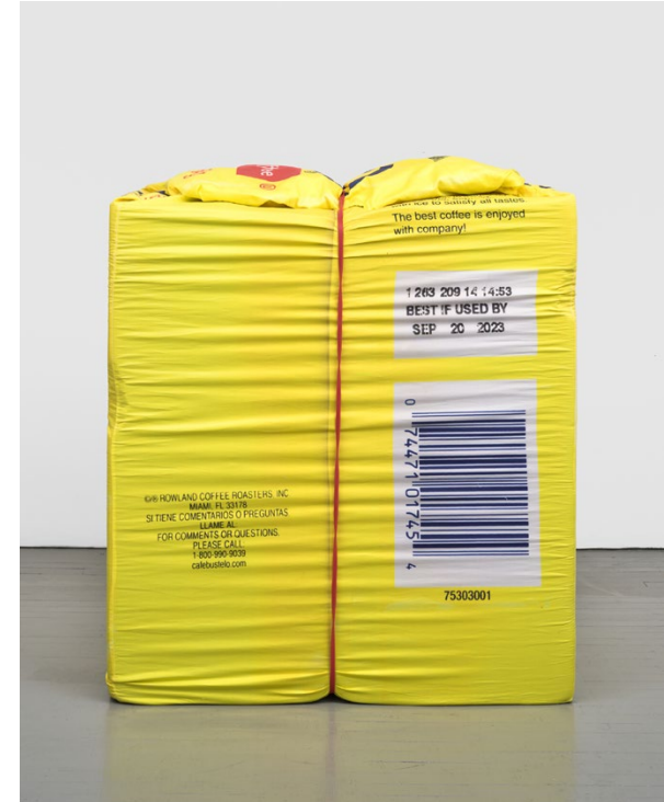
10oz. Cafe Bustelo Foam, digital print on cotton sateen, rubber band 53 x 43 x 25 inches 2022