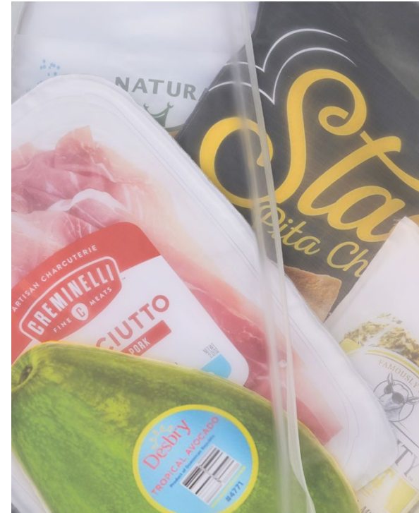
Entertaining for 1 Poly Organdy, Felt, Digital Print on Polyester Satin, Foam 58 x 36 x 5.5 inches 2022