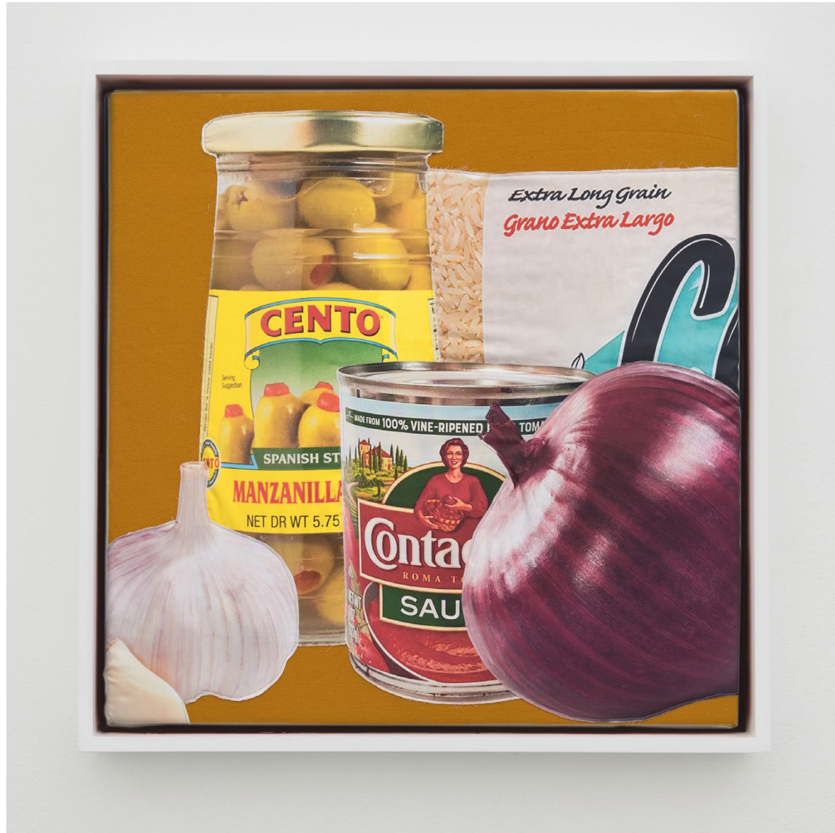
Locrio Prep Felt, Digital Print on Cotton Sateen, Foam 36 x 36 x 2 inches 2022 Framed

Locrio/or a mixed rice, whether w chicken, sausage, beans, etc is found across the globe in many cuisines. Arroz con pollo or Locrio de pollo is a common dish in the DR. In this piece the highlight is the prep which is partially the base of the recipe (still missing a few ingredients but the general sense), in this base we find a common thread across cultures.