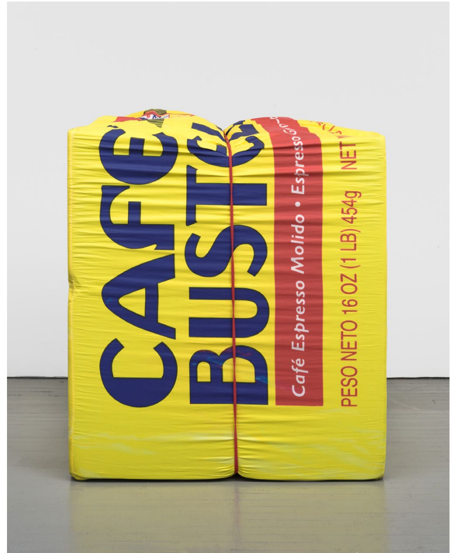
10oz. Cafe Bustelo