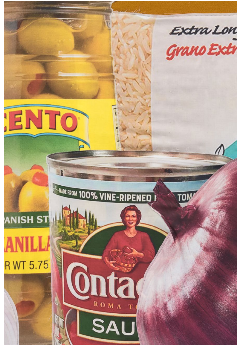
Stitching detail of digital prints on brushed suede sewn onto felt background