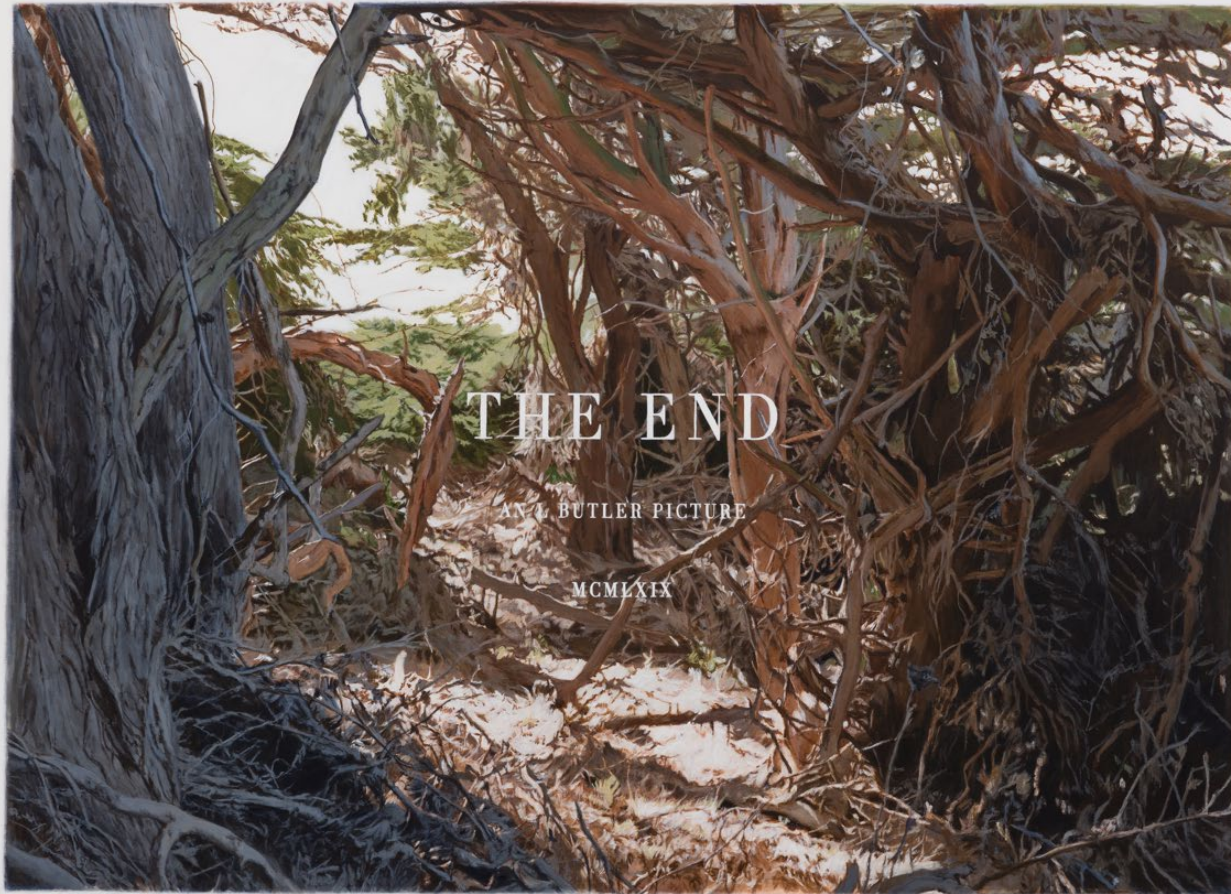
THE END XXXIII Acrylic on canvas 44 x 60 inches 2017