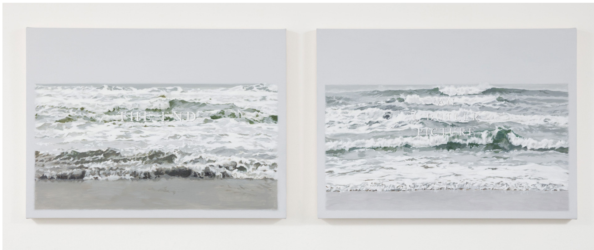
THE END XXV Acrylic on canvas Diptych 22 x 62 inches 2016