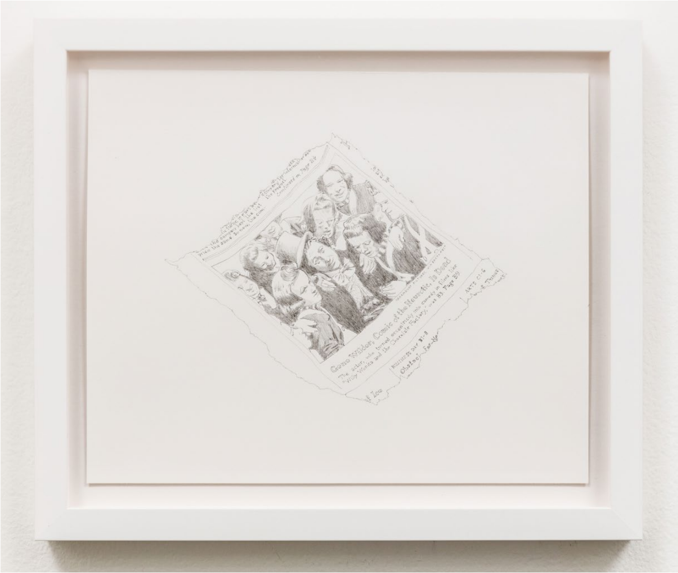
Obituary (Doctor) Pencil on paper 11.25 x 14.25 inches 2017