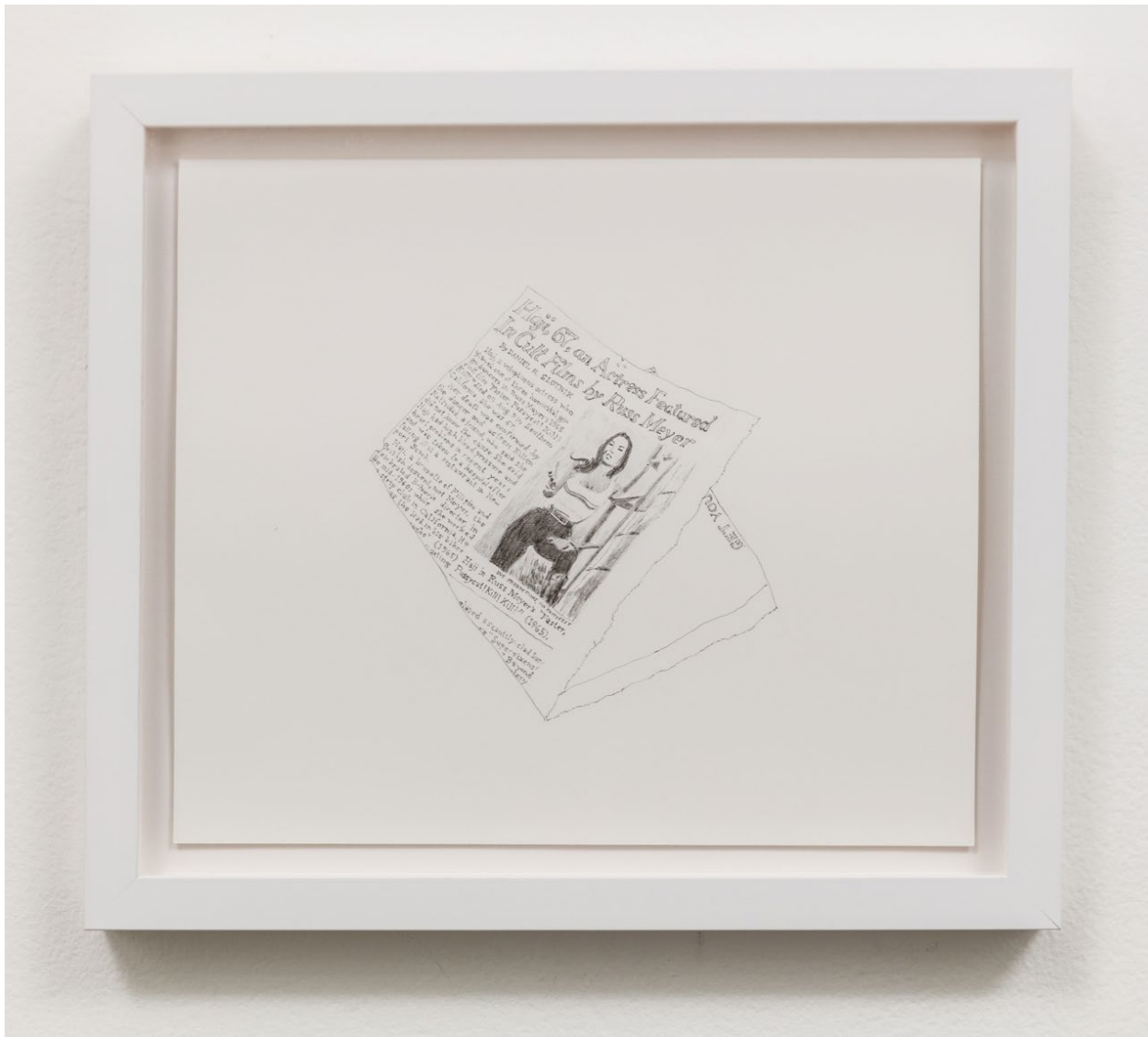
Obituary (Pussycat) Pencil on paper 10 x 11.75 inches 2017