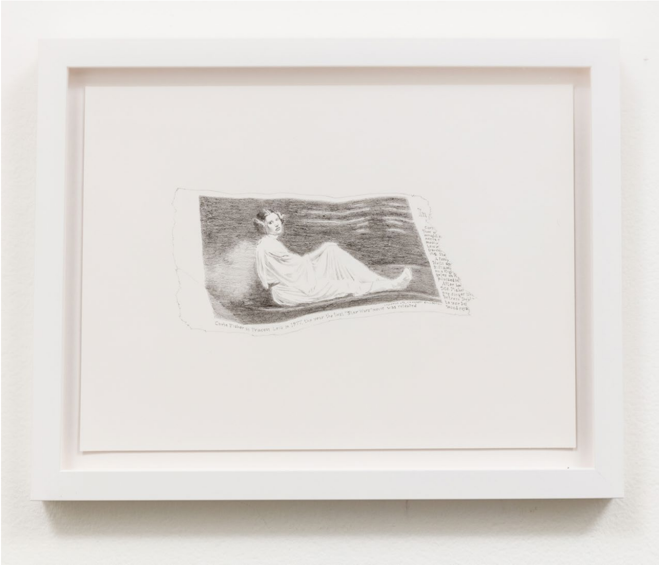
Obituary (Princess) Pencil on paper 10 x 13.5 inches 2017