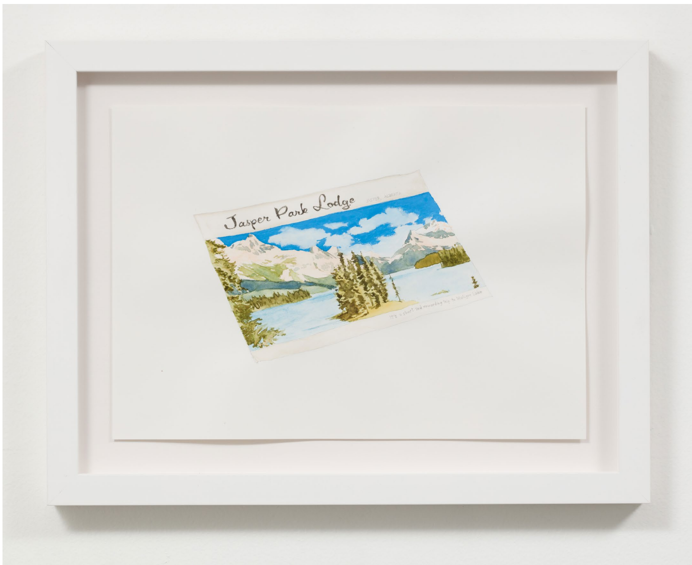
Postcard - Jasper Lake Gouache and graphite on Bristol paper 8.5 x 12 inches 2017