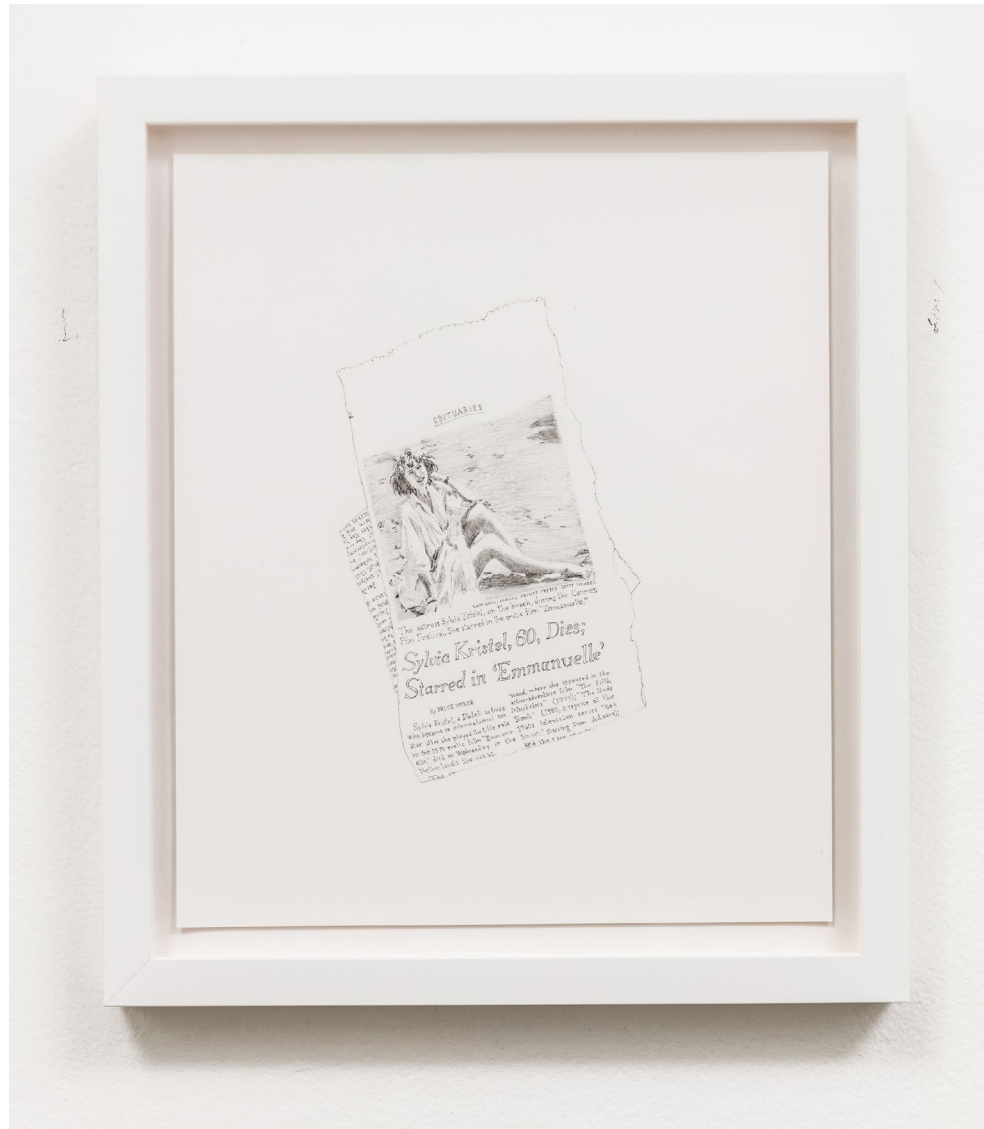
Obituary (Emmanuelle) Pencil on paper 12.75 x 10.75 inches 2017