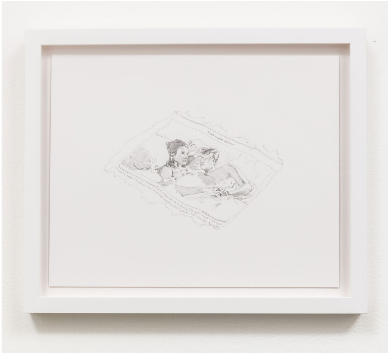
Obituary (Roger) Pencil on paper 10 x 12.25 inches 2017