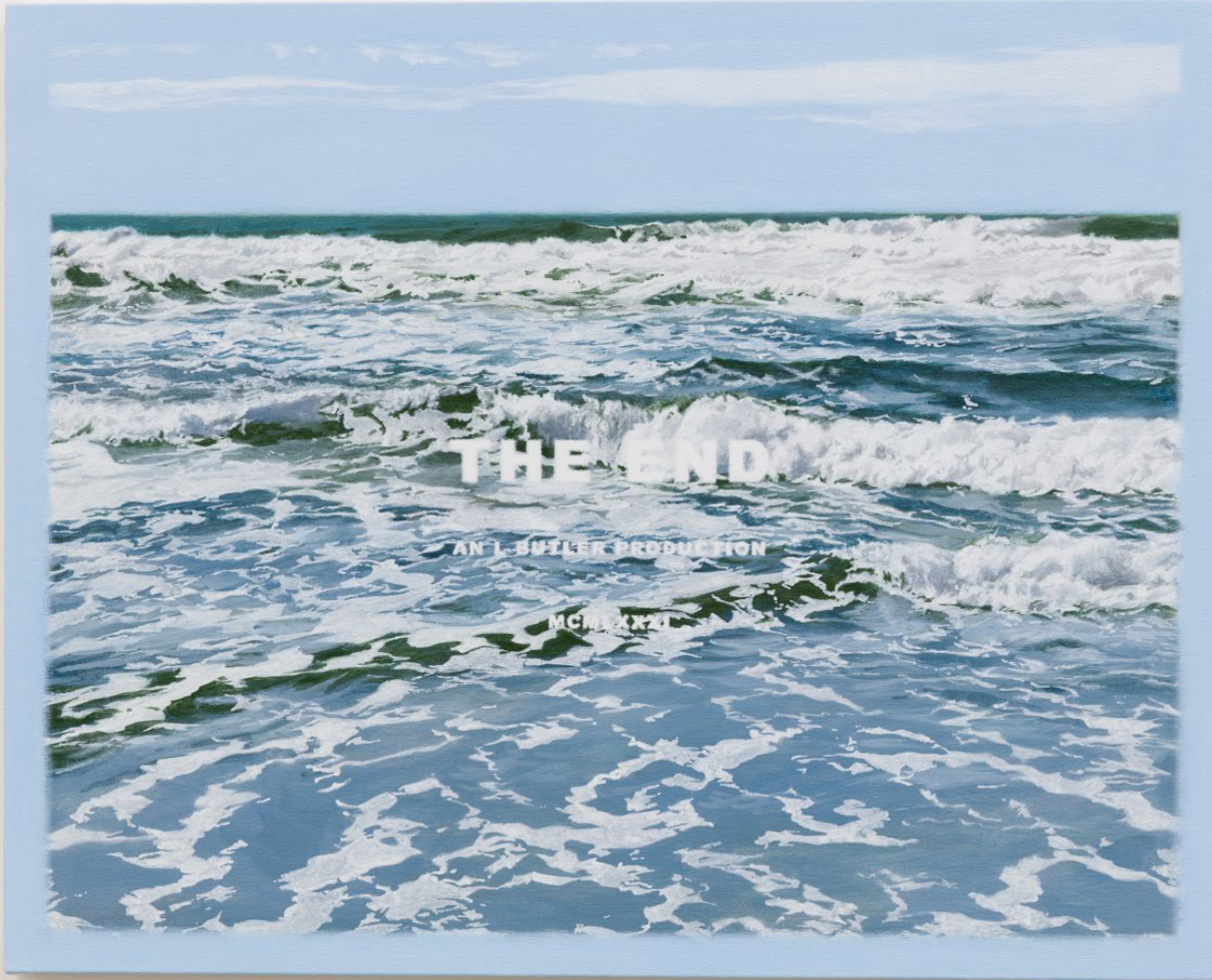
THE END XXIX Acrylic on canvas 24 x 30 inches 2017