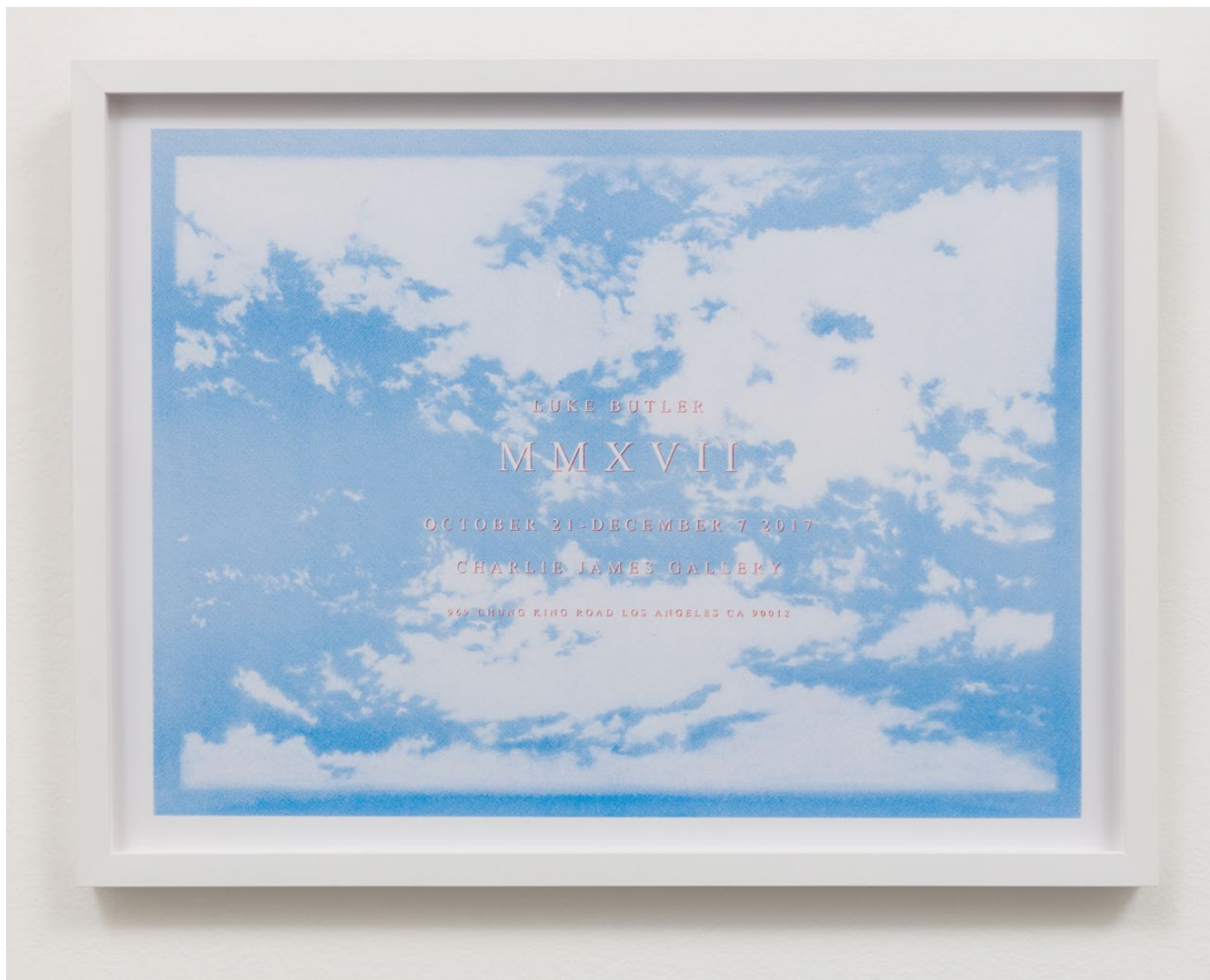
MMXVII Silkscreen 17.5 x 23.5 inches 2017