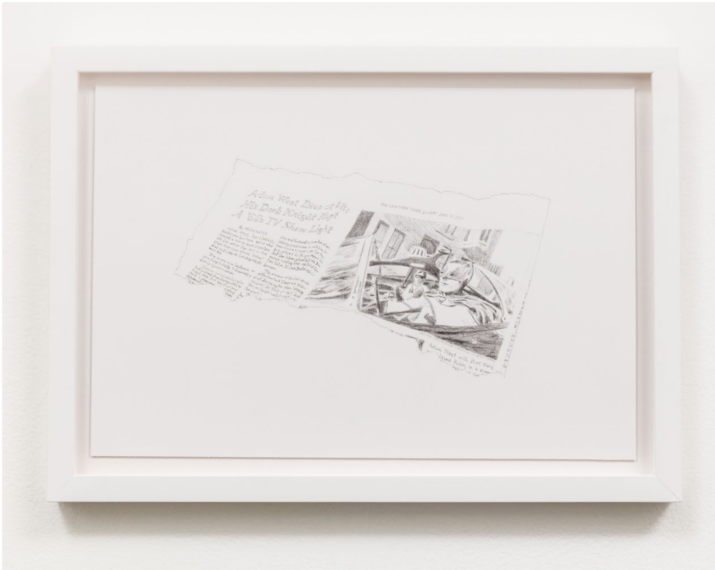
Obituary (Crusader) Pencil on paper 11.25 x 16.25 inches 2017