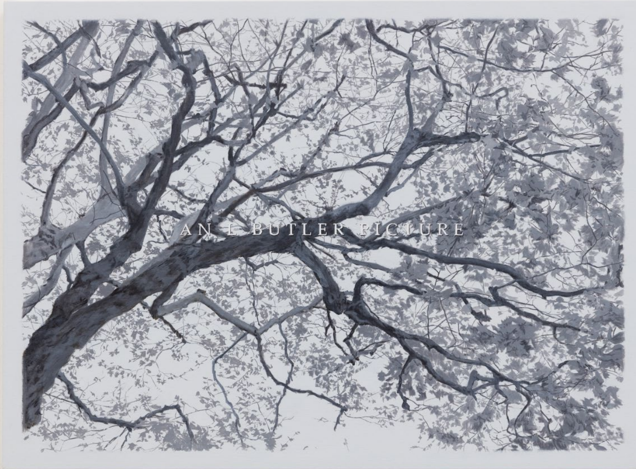
An L Butler Picture VII Acrylic on canvas 22 x 30 inches 2017