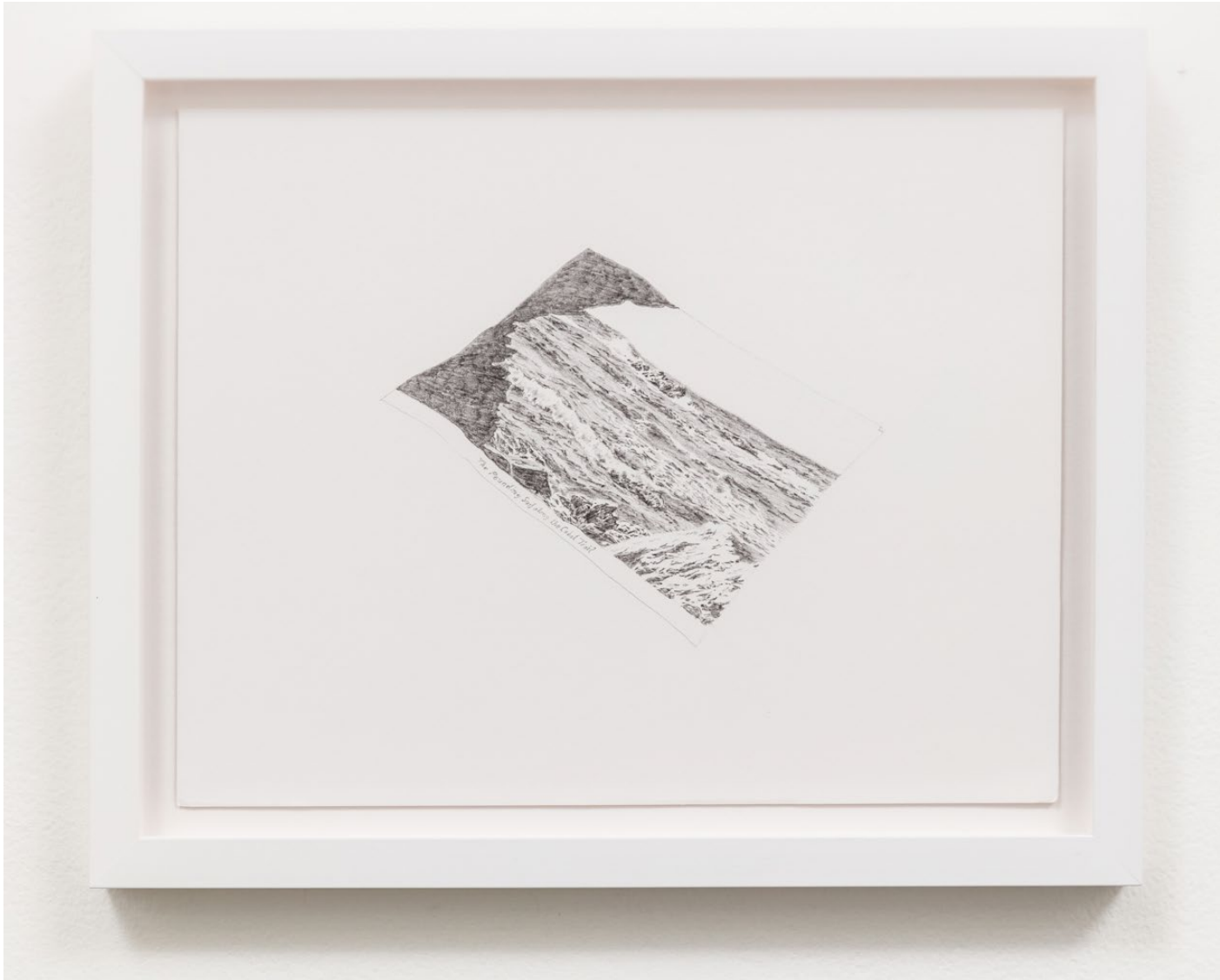
Postcard Pencil on paper 11 x 13.75 inches 2016