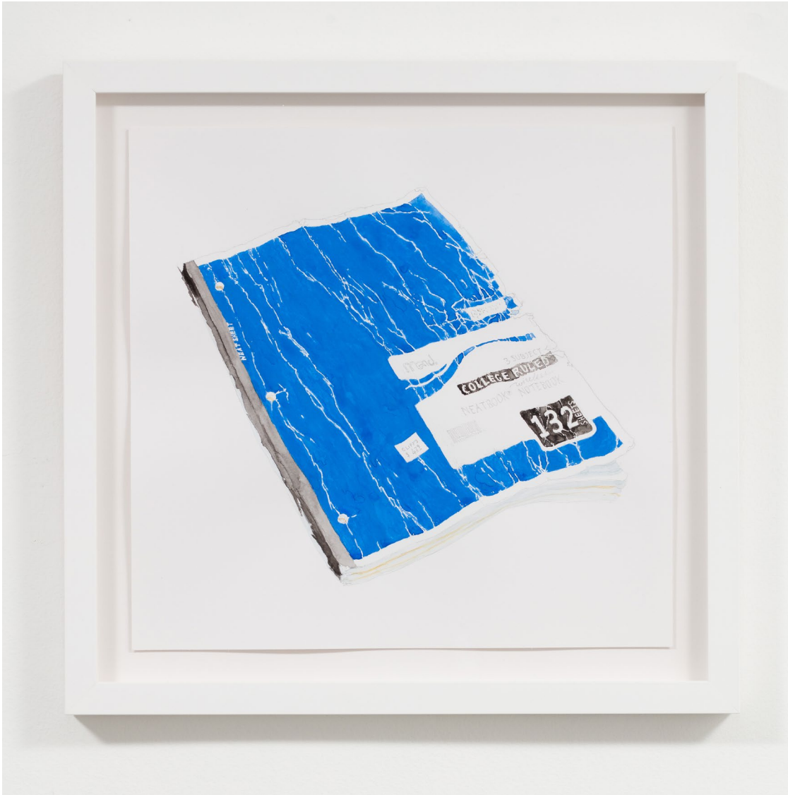
Blue Notebook September 2014 Gouache and graphite on Bristol paper 12.5 x 13 inches 2017