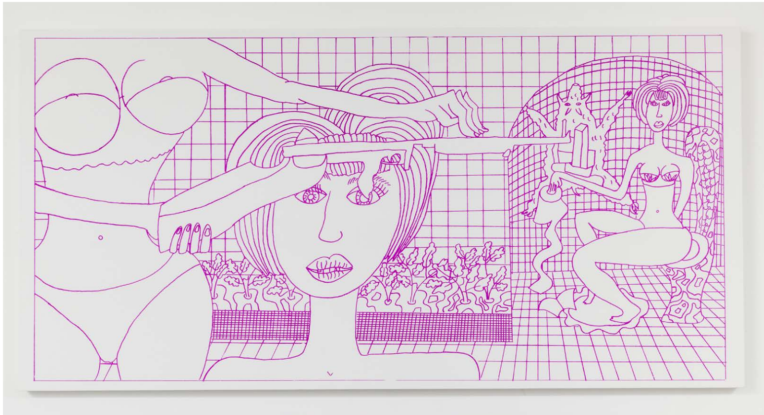
Californication (Woman/Gun/Toilet) Acrylic on canvas 36 x 72 inches 91.44 x 182.8 cm 2016