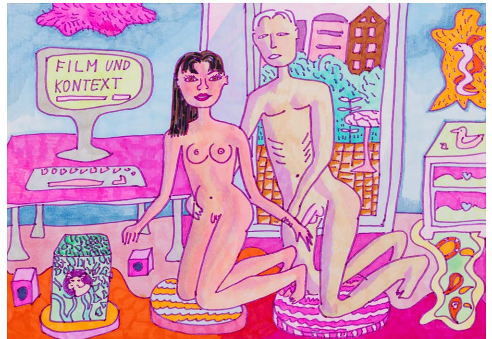
Blue Horse (Film und Kontext) Marker Ink on Paper 8.25 x 11.5 inches 21 x 29.2 cm unframed 2014