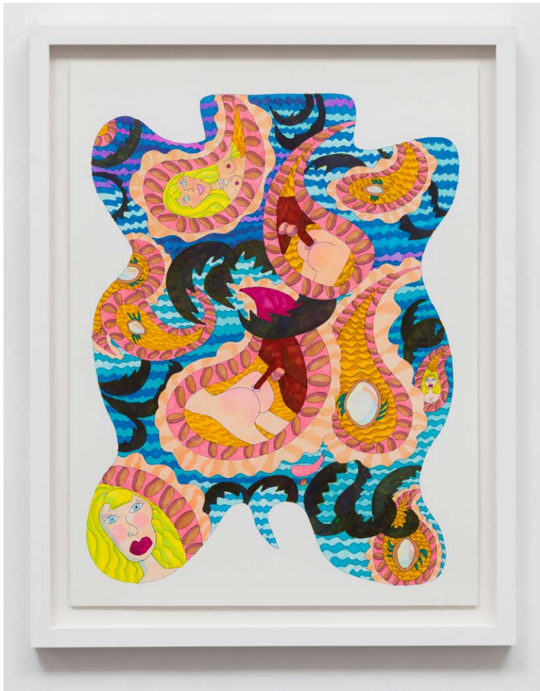
California Furs (Cocoanuts) Marker Ink on Paper 25 x 19.5 inches 63.5 x 49.5 cm Framed 2014