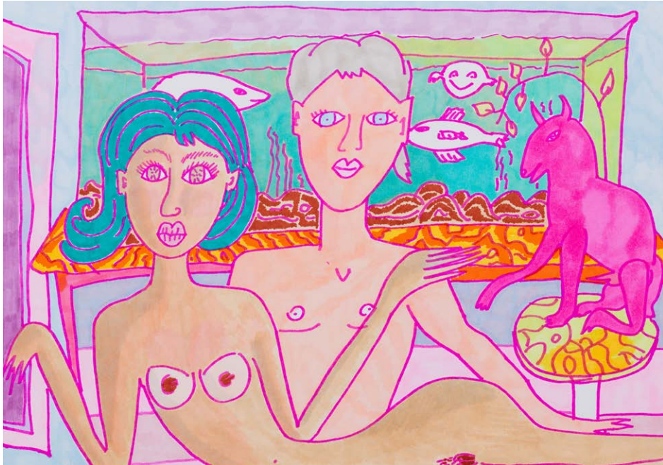
Blue Horse (Couple) Marker Ink on Paper 8.25 x 11.5 inches 21 x 29.2 cm unframed 2015