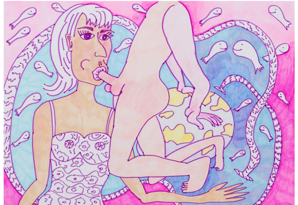
Blue Horse (Fellatio) Marker Ink on Paper 8.25 x 11.5 inches 21 x 29.2 cm unframed 2013