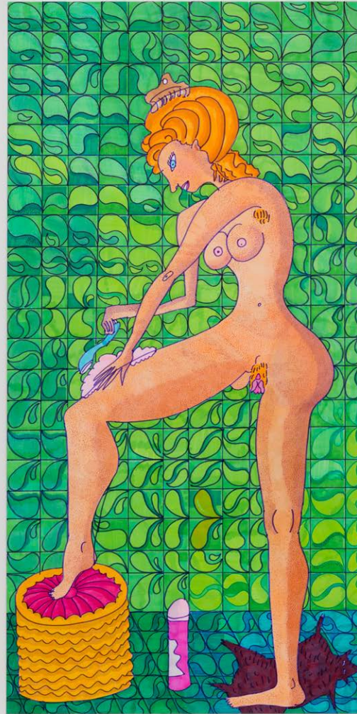
Californication (Woman Shaving Legs) Marker Ink on Paper 27 x 15 inches 68.58 x 38.1 cm Framed 2015