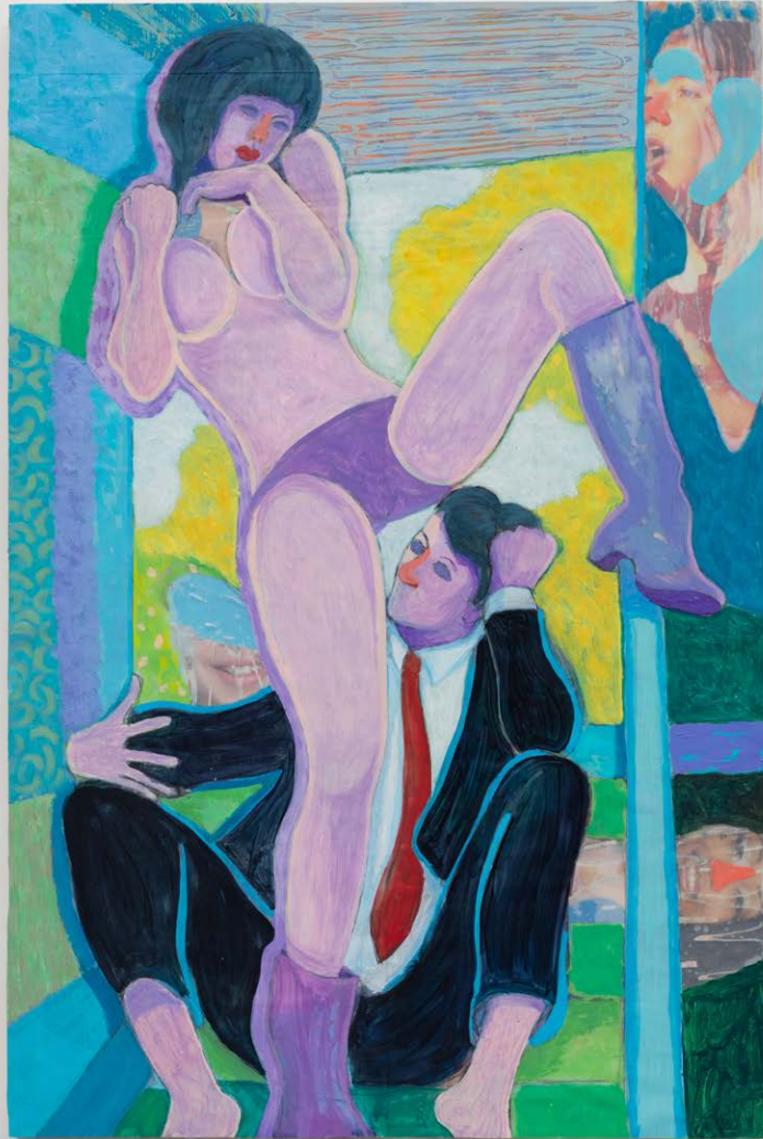
Max Maslansky Stairy Eyes Collaged magazine pages, adhesive, drafting film, acrylic on wood panel 18 x 12 inches 45.7 x 30.48 cm 2016