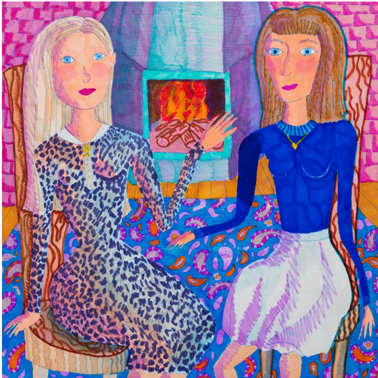
I'm M-pire (2 girls blue) Marker Ink on Paper 11.75 x 12 inches 29.8 x 30.5 cm unframed 2014