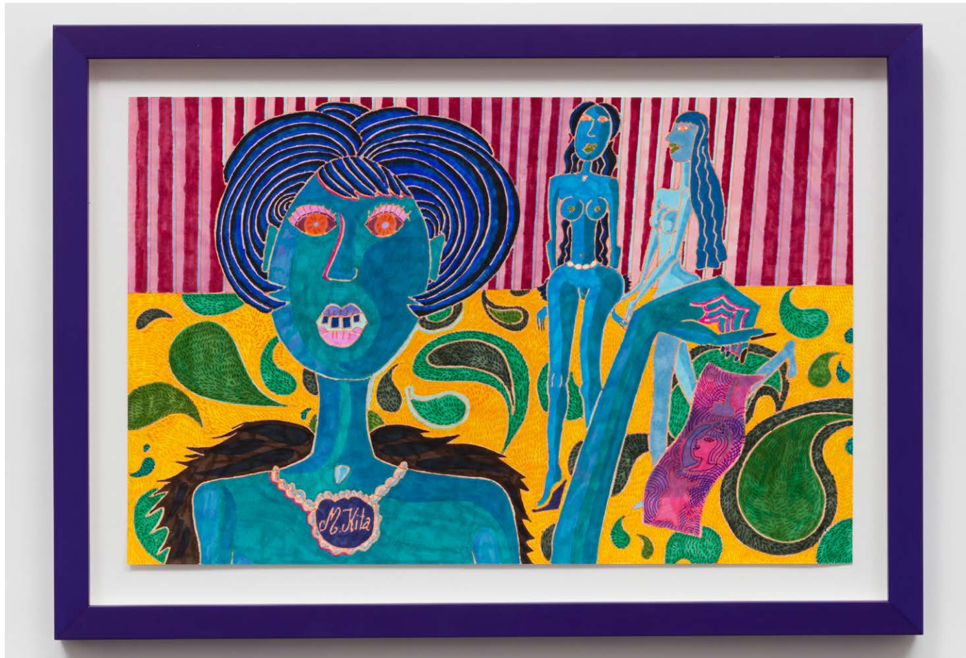
Californication (Blue Self Portrait M Kita) Marker Ink on paper 14.25 x 20.25 inches 36.2 x 51.4 cm Framed