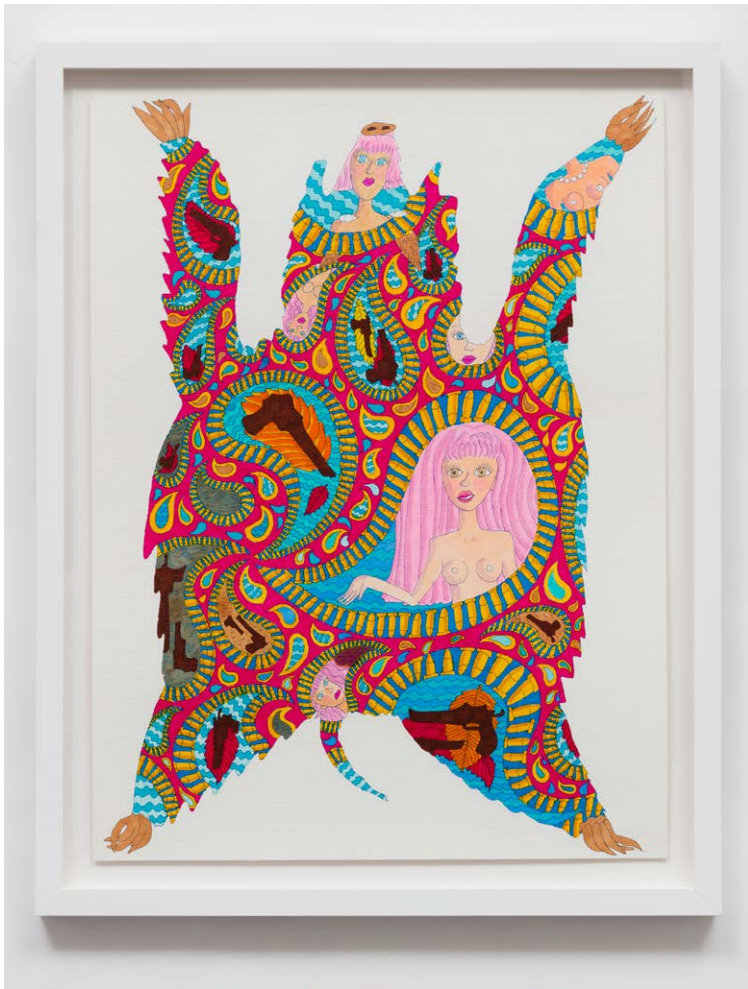
California Furs (Pink Lady) Marker Ink on Paper 25 x 19.5 inches 63.5 x 49.5 cm Framed 2014