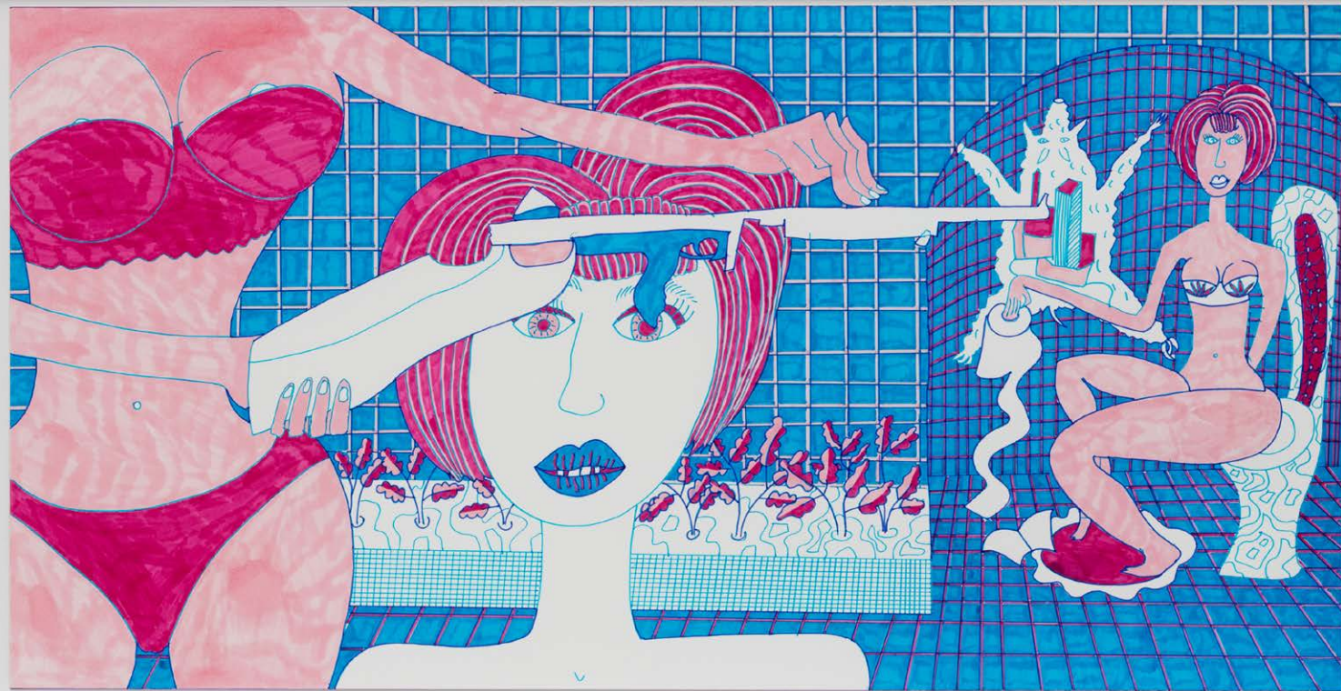
Californication (Woman/Gun/Toilet) Marker Ink on Paper 18 x 32.25 inches 45.72 x 82 cm Framed 2016