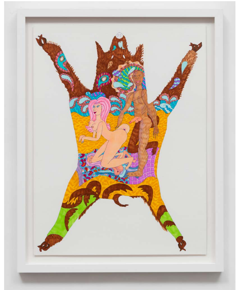
California Furs (Happy Lovers on a Towel) Marker Ink on Paper 25 x 19.5 inches 63.5 x 49.5 cm Framed 2014