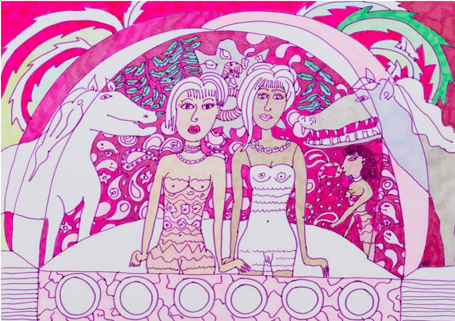
Blue Horse (magenta) Marker Ink on Paper 8.25 x 11.5 inches 21 x 29.2 cm unframed 2013