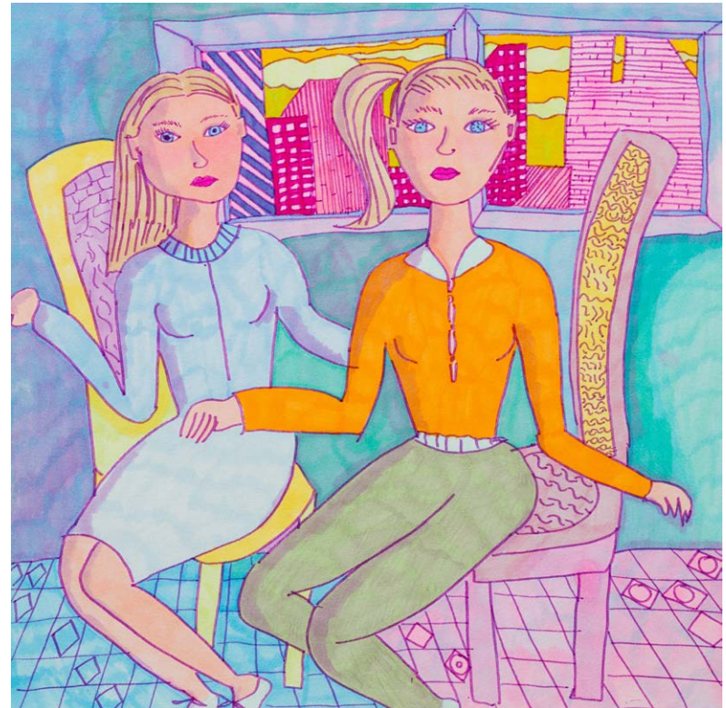
I'm M-pire (Two Girls - Sweaters) Marker Ink on Paper 12 x 11.5 inches 30.5 x 29.2 cm unframed 2013