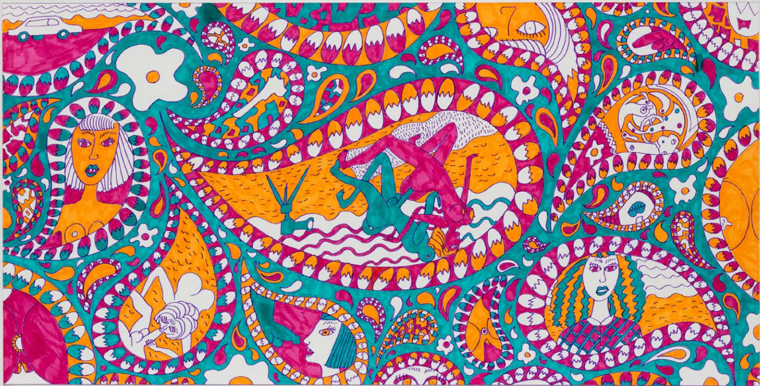
Californication (Teal Paisley) Marker Ink on paper 18 x 32.25 inches 45.7 x 82 cm Framed