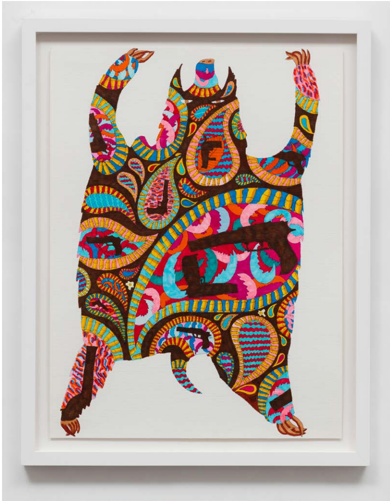
California Furs (Red & Blue) Marker Ink on Paper 25 x 19.5 inches 63.5 x 49.5 cm Framed 2014