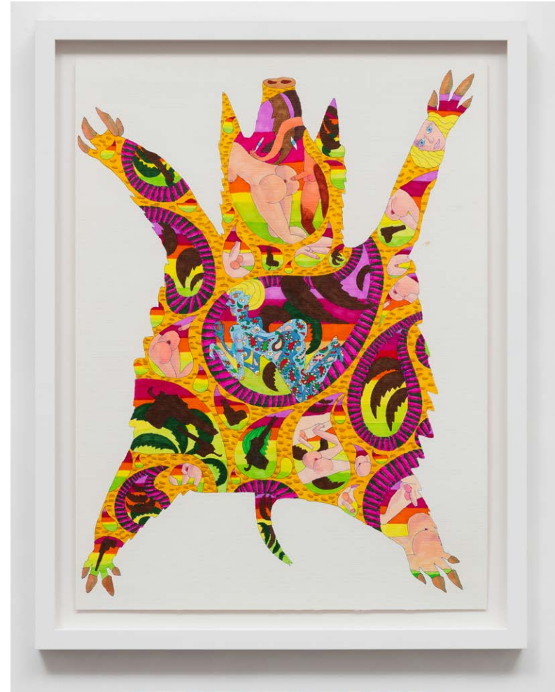
California Furs (Paisley Woman) Marker Ink on Paper 25 x 19.5 inches 63.5 x 49.5 cm Framed 2014