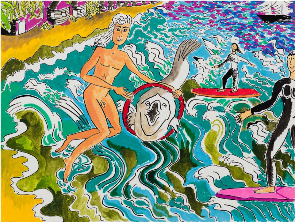
Californication (Aquatic Scene) Marker Ink on Paper 9 x 12 inches 22.86 x 30.48 cm unframed 2011