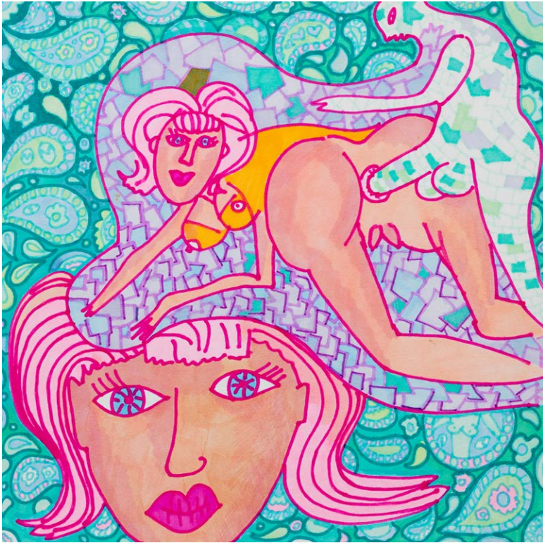
I'm M-pire (Daydream) Marker Ink on Paper 12 x 11.5 inches 30.5 x 29.2 cm unframed 2013