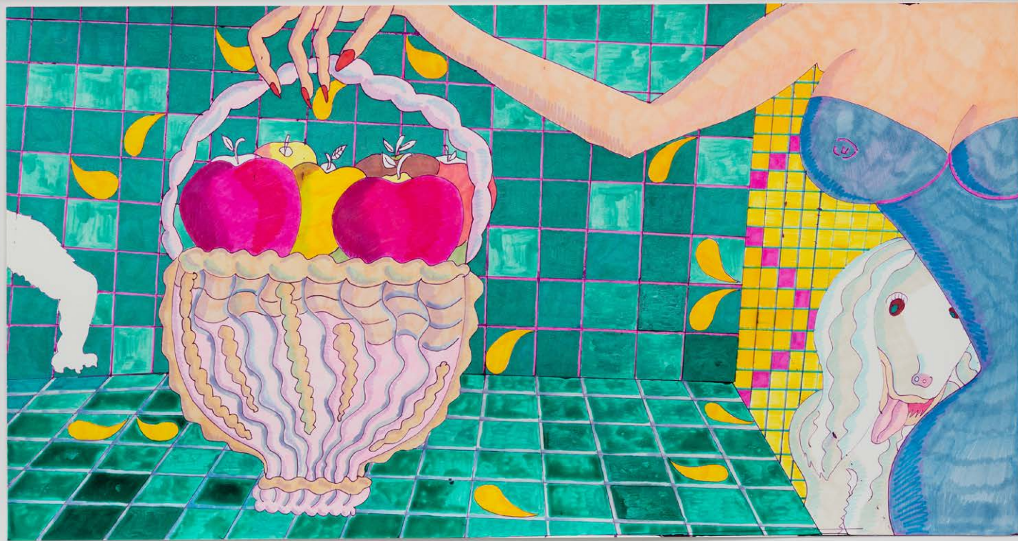
Californication (Apples/Woman/Dog) Marker Ink on Paper 18.5 x 32.25 inches 47 x 82 cm Framed 2016