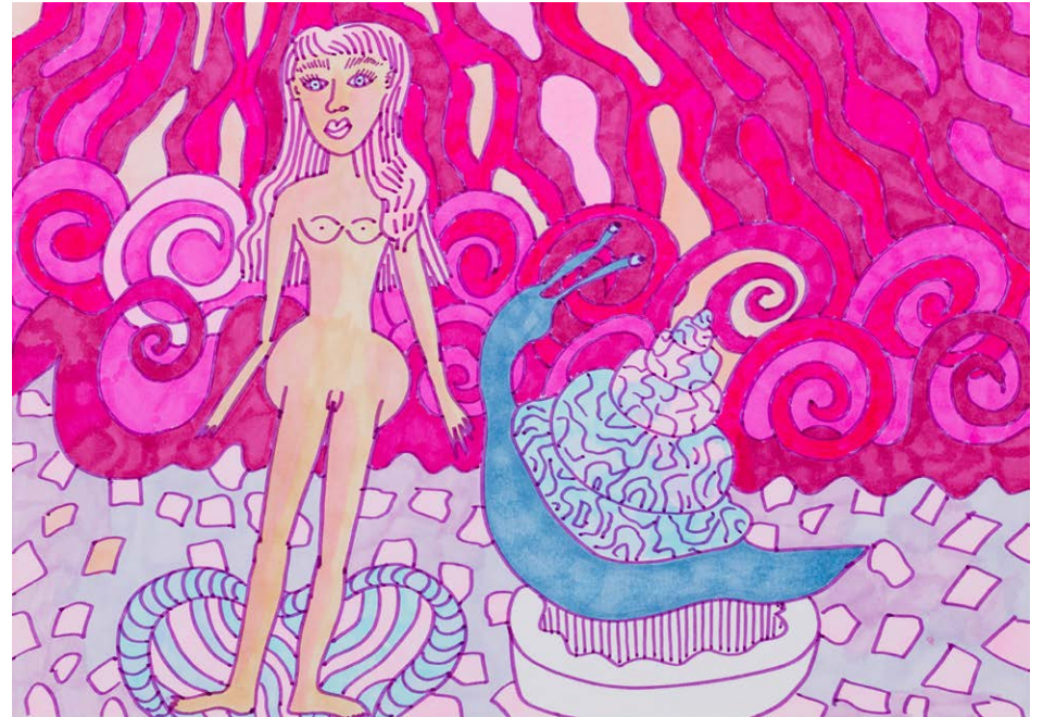
Blue Horse (Woman & Snail) Marker Ink on Paper 8.5 x 11.5 inches 21.59 x 29.2 cm unframed 2013