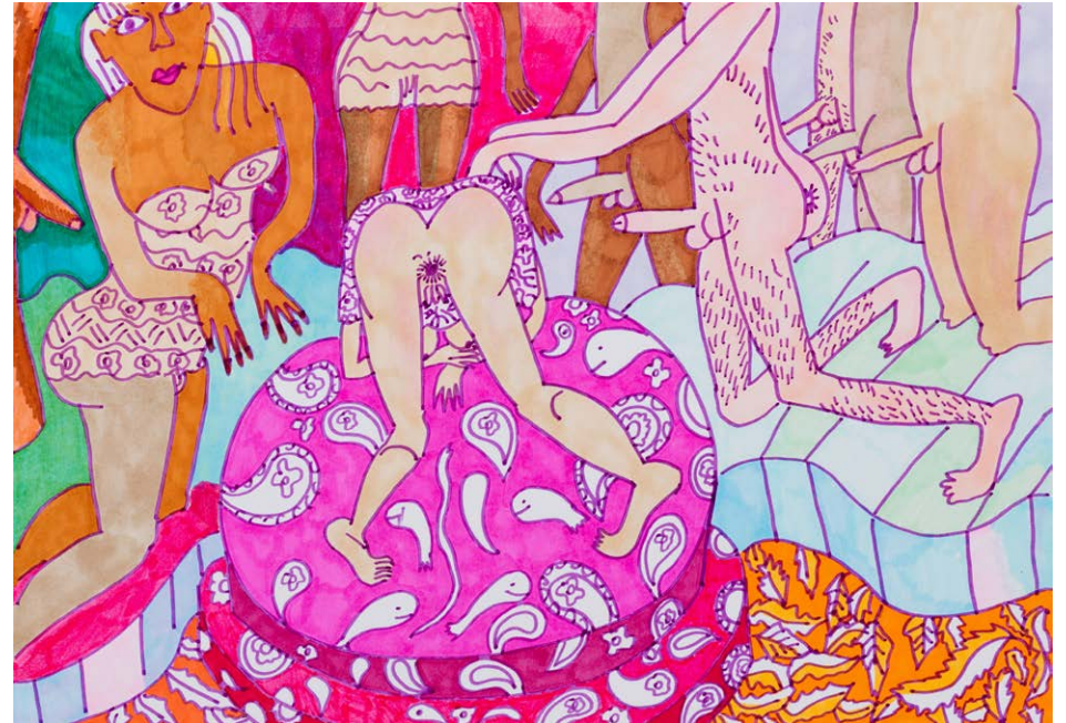
Blue Horse (Orgy) Marker Ink on Paper 8.25 x 11.5 inches 21 x 29.2 cm unframed 2013