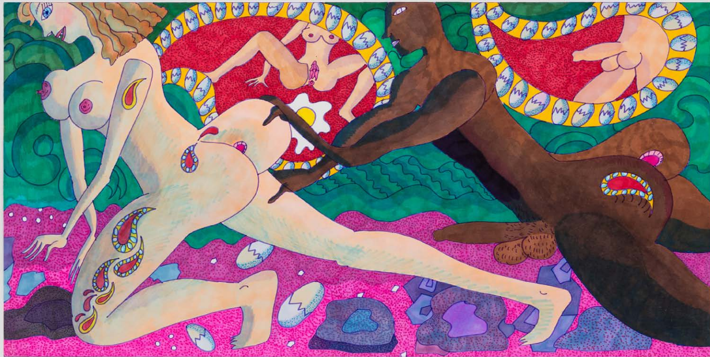
Californication (Happy Lovers) Marker Ink on Paper 15.25 x 27 inches 38.73 x 68.58 cm Framed 2015