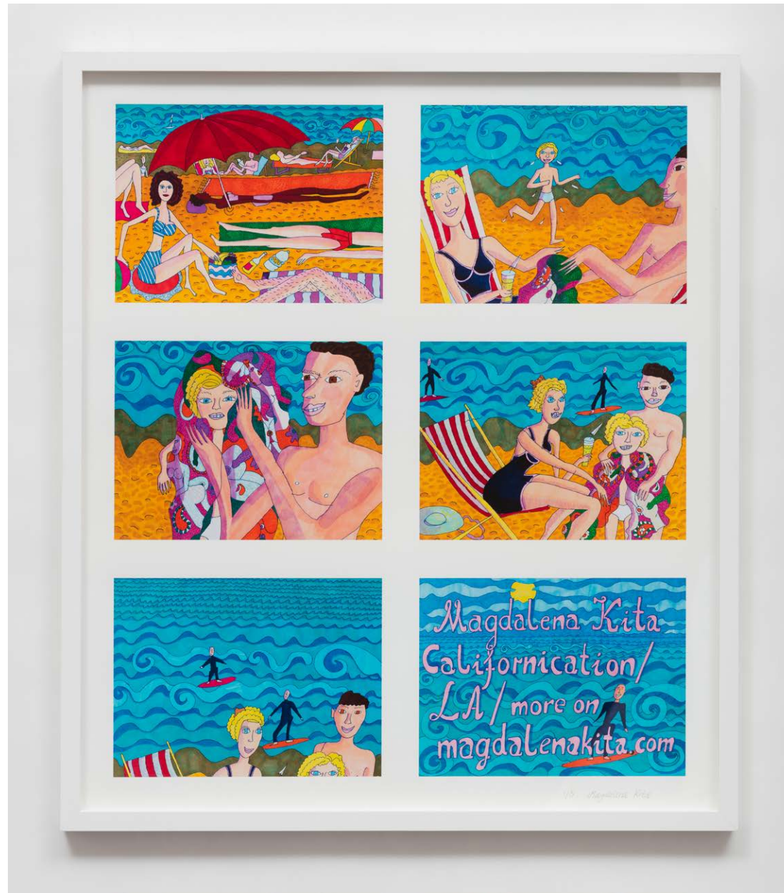
Californication (Story board Beach) Archival pigment print Edition of 3 30 x 26 inches 76.2 x 66 cm Unframed 2016