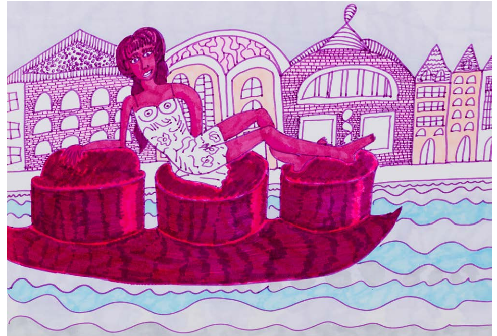
Untitled (Venice) 11.5 x 8.25 inches 29.2 x 20.9 cm unframed