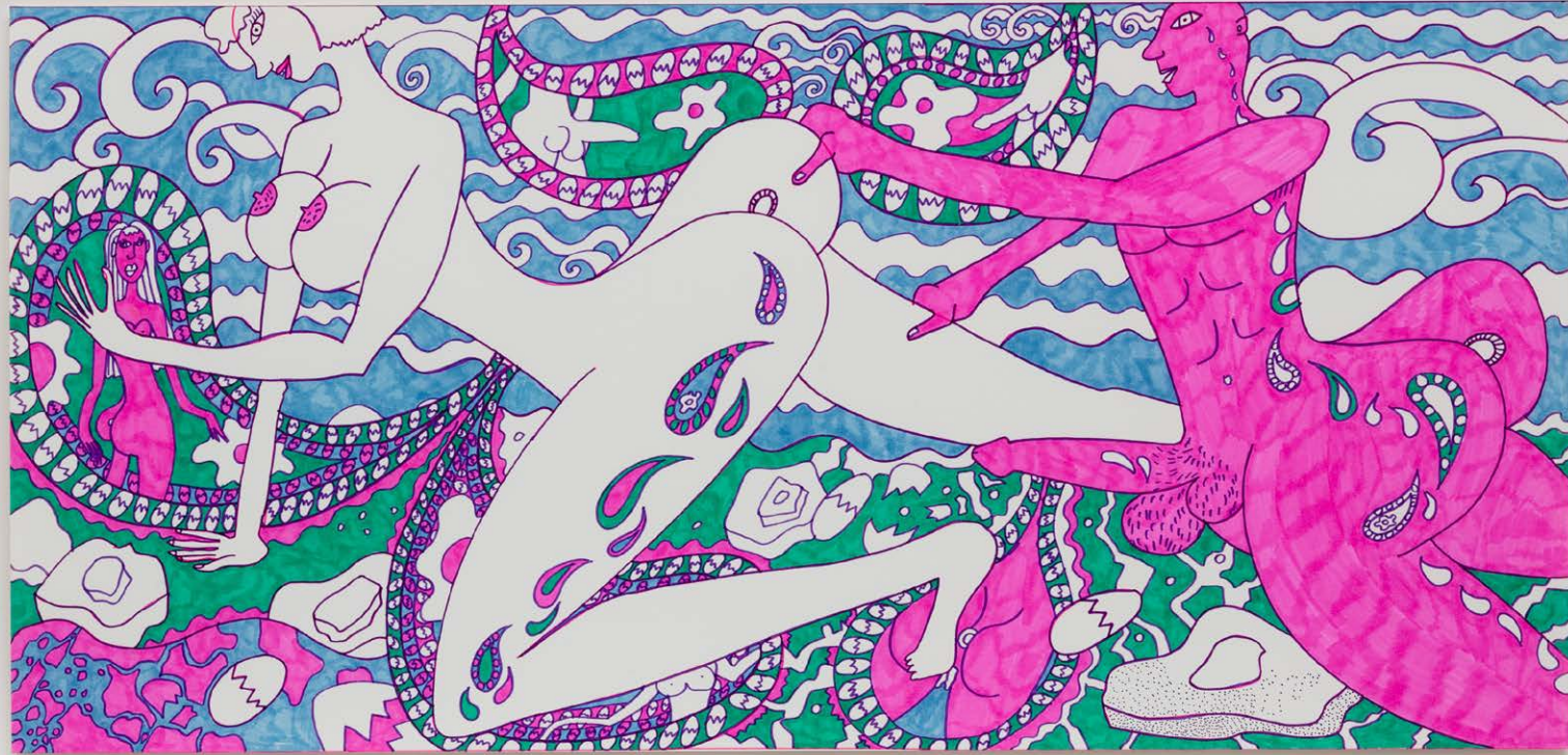
Californication (Happy Couple Pink) Marker Ink on paper 17.25 x 32.25 inches 44 x 82 cm Framed