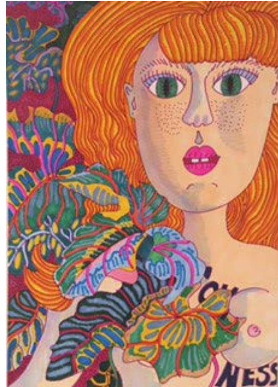
Untitled (ginger girl) Marker ink on paper 8 x 11.75 inches 20.3 x 29.8 cm unframed 2016