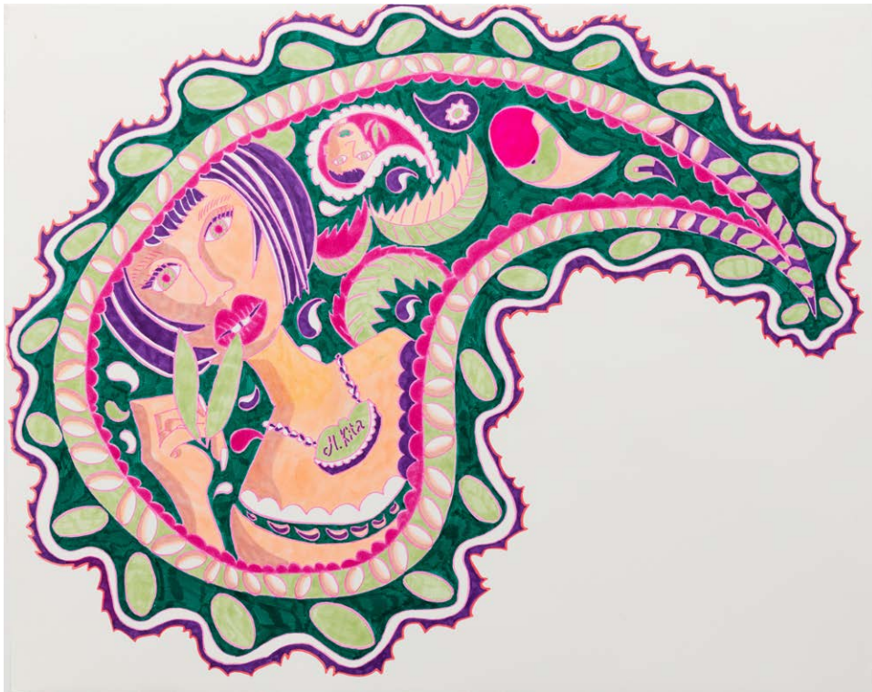
Californication (Self-Portrait M Kita) Marker Ink on Paper 24 x 17 inches 61 x 43 cm unframed 2015