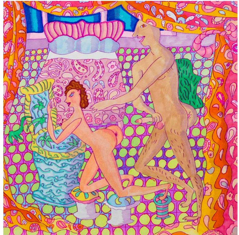
I'm M-pire (Paisley Room with Couple) Marker Ink on Paper 12 x 12 inches 30.5 x 30.5 cm unframed 2013