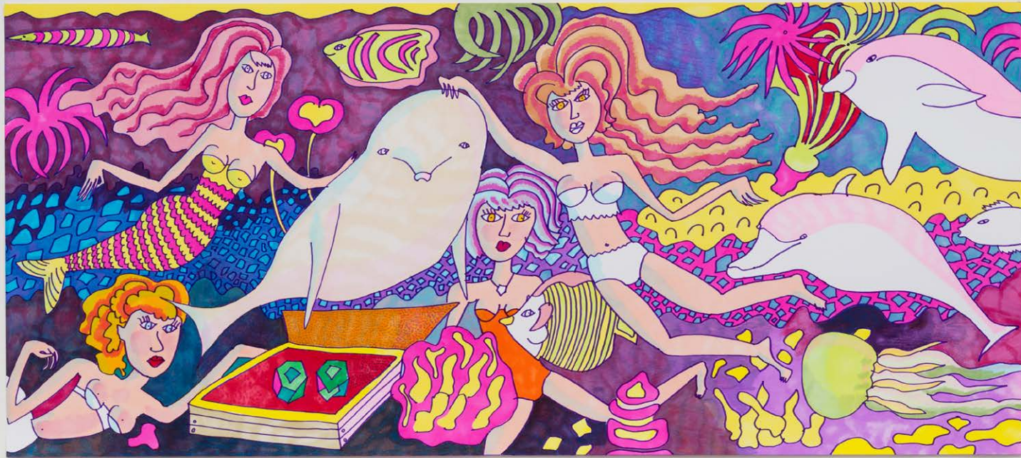
Californication (Mermaids) Marker Ink on paper 13.75 x 26.75 in 35 x 68 cm Framed