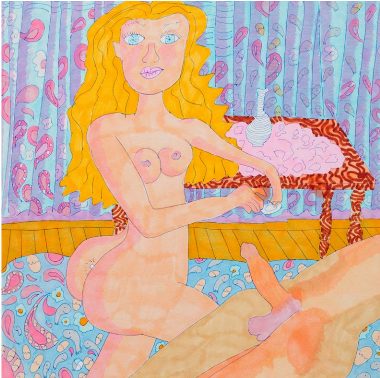
I'm M-pire (condom) Marker Ink on Paper 11.5 x 11.75 inches 29.2 x 29.8 cm unframed 2014