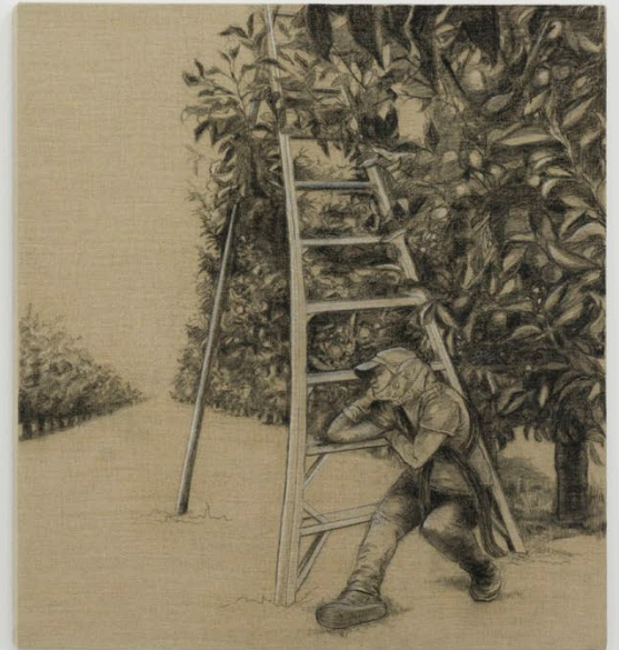
The Dreamers Charcoal on linen Triptych 28 x 24 inches/each 2021