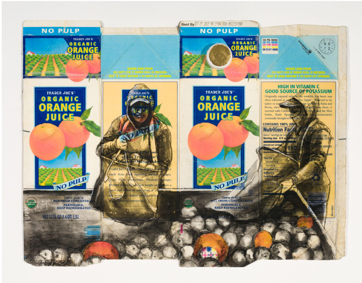
Juicy Crop Ink, charcoal, and collage on juice carton 11.75 x 16.25 inches 2021