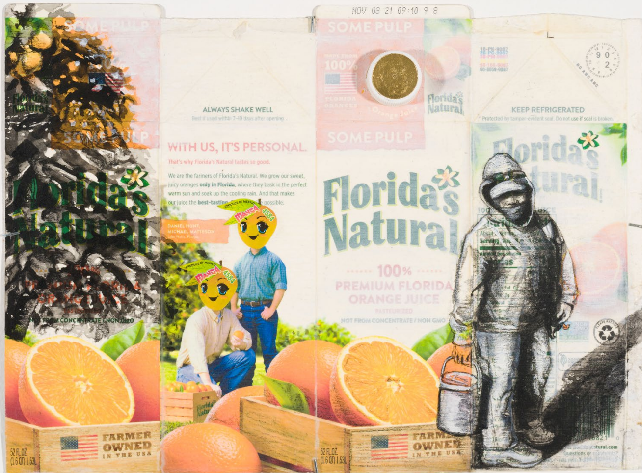
Good Morning Ink, gouache, sticker and charcoal on juice carton 10.50 x 14 inches 2021