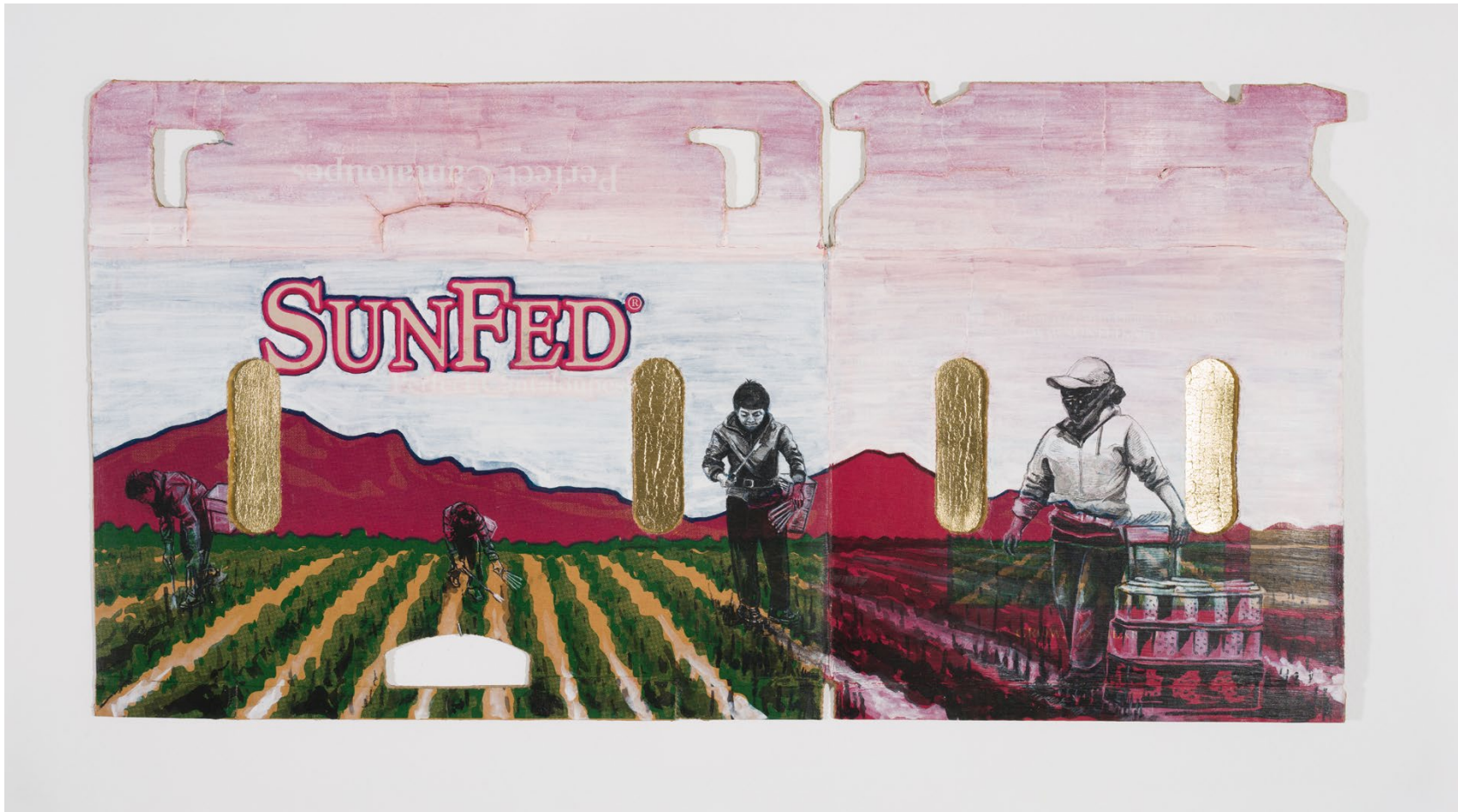
Sun Fed Ink, Gouache, and charcoal on produce cardboard 16 x 31.25 inches 2021