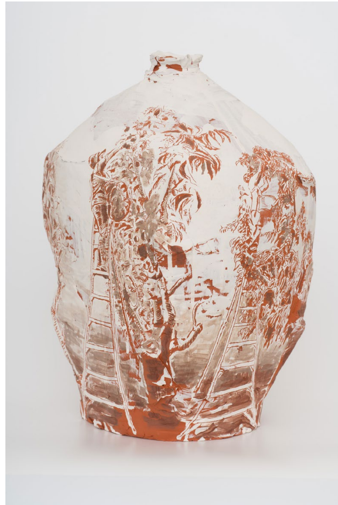
Untitled Two (Collaboration with Gerardo Monterrubio) Sgraffito and Underglazes on Ceramic Vase Approx. 20 x 12 x 15 Inches 2018