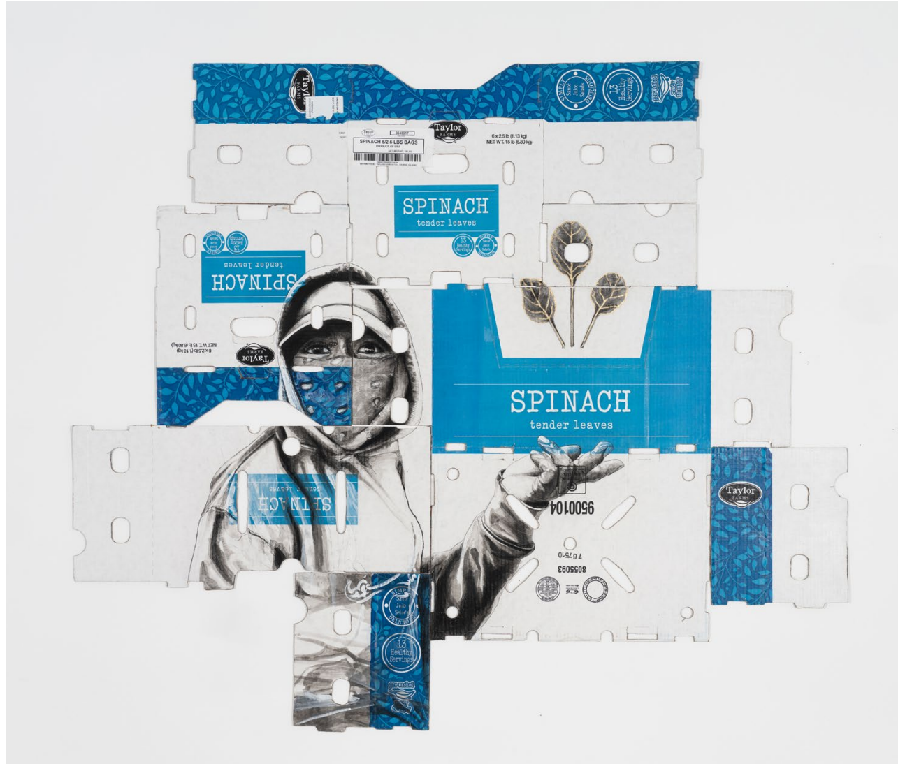
Tender Leaves Ink, charcoal, and gold leaf on produce cardboard box 52.50 x 62.50 Inches 2021