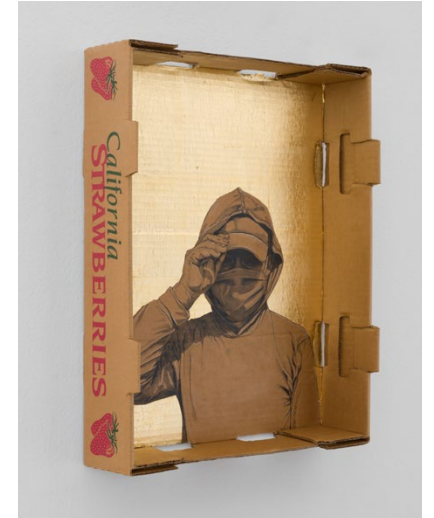
Fruit Catcher Ink, charcoal and gold leaf on produce cardboard box 20 x 15.50 inches 2021