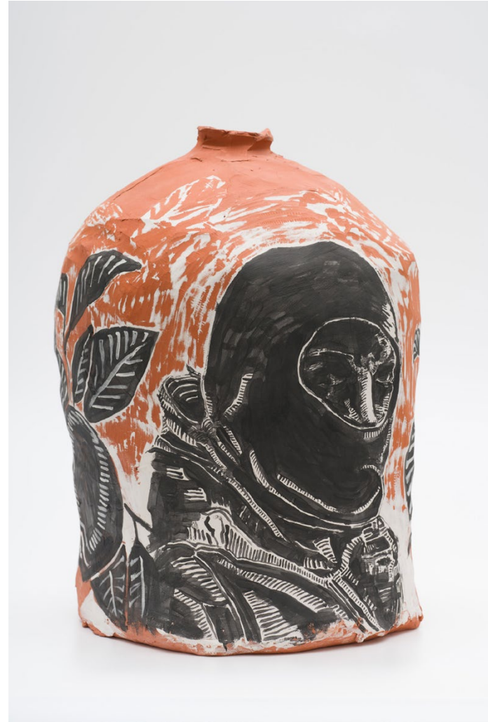
Untitled Three (Collaboration with Gerardo Monterrubio) Underglazes on Ceramic Vase Approx. 16 x 14 x 14 Inches 2018