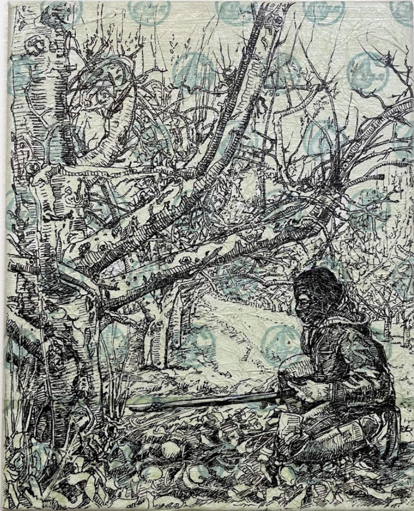
Winter Clean Ink pen on fruit wrapping paper, mounted on canvas 11.75 x 9.50 inches 2021