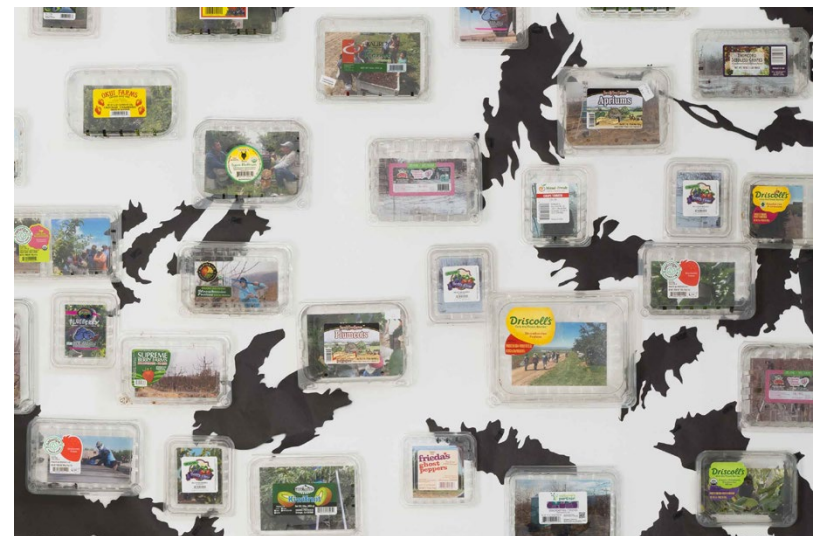
Tree of Life Installation Details