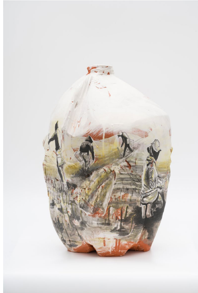
Untitled One (Collaboration with Gerardo Monterrubio) Underglazes on Ceramic Vase Approx. 22 x 16 x 16 Inches 2018