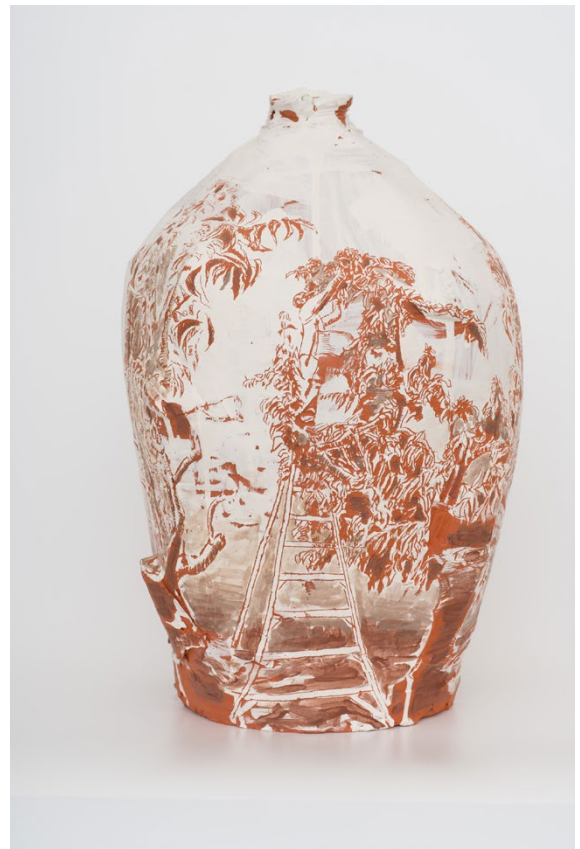
Untitled Two (Collaboration with Gerardo Monterrubio) Sgraffito and Underglazes on Ceramic Vase Approx. 20 x 12 x 15 Inches 2018