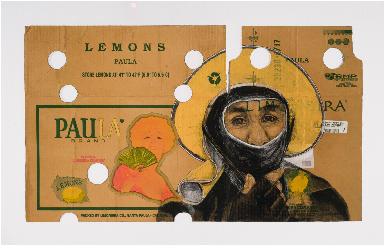
Paula Ink, Gouache, charcoal, and acrylic on produce cardboard 16 x 27.75 inches 2021