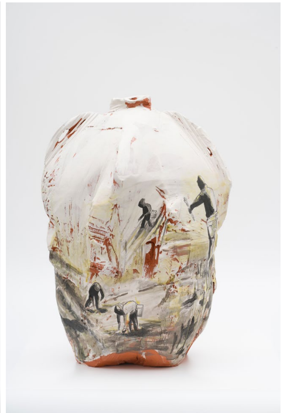
Untitled One (Collaboration with Gerardo Monterrubio) Underglazes on Ceramic Vase Approx. 22 x 16 x 16 Inches 2018