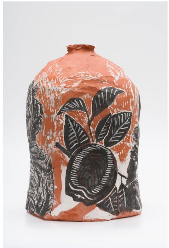
Untitled Three (Collaboration with Gerardo Monterrubio) Underglazes on Ceramic Vase Approx. 16 x 14 x 14 Inches 2018