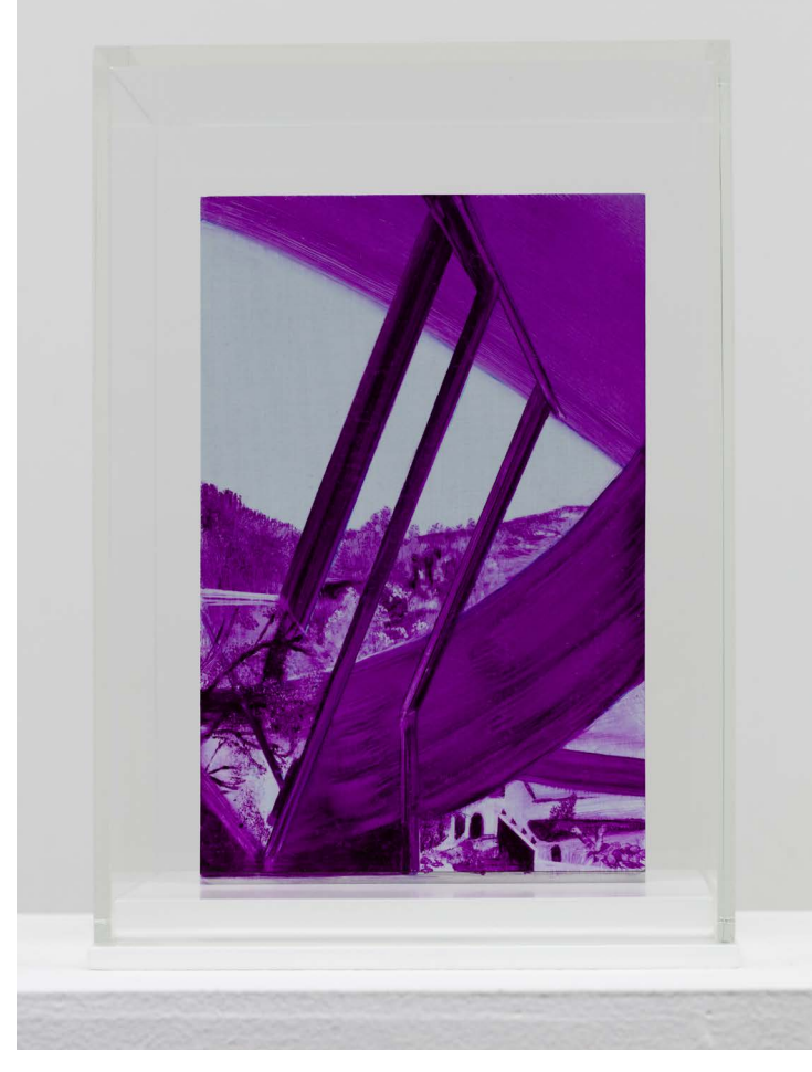
Lautner Entryways Plinth Lithography Ink on Vintage tracing Cloth, mounted on aluminum with plexi case 10 1/4 x 8 x 6 inches 2017