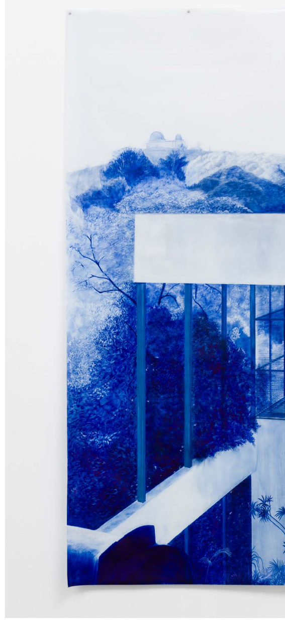
Lovell Health House Observed, Private Home 1929 Lithography Ink on vintage tracing cloth 72 x 31 inches 2017