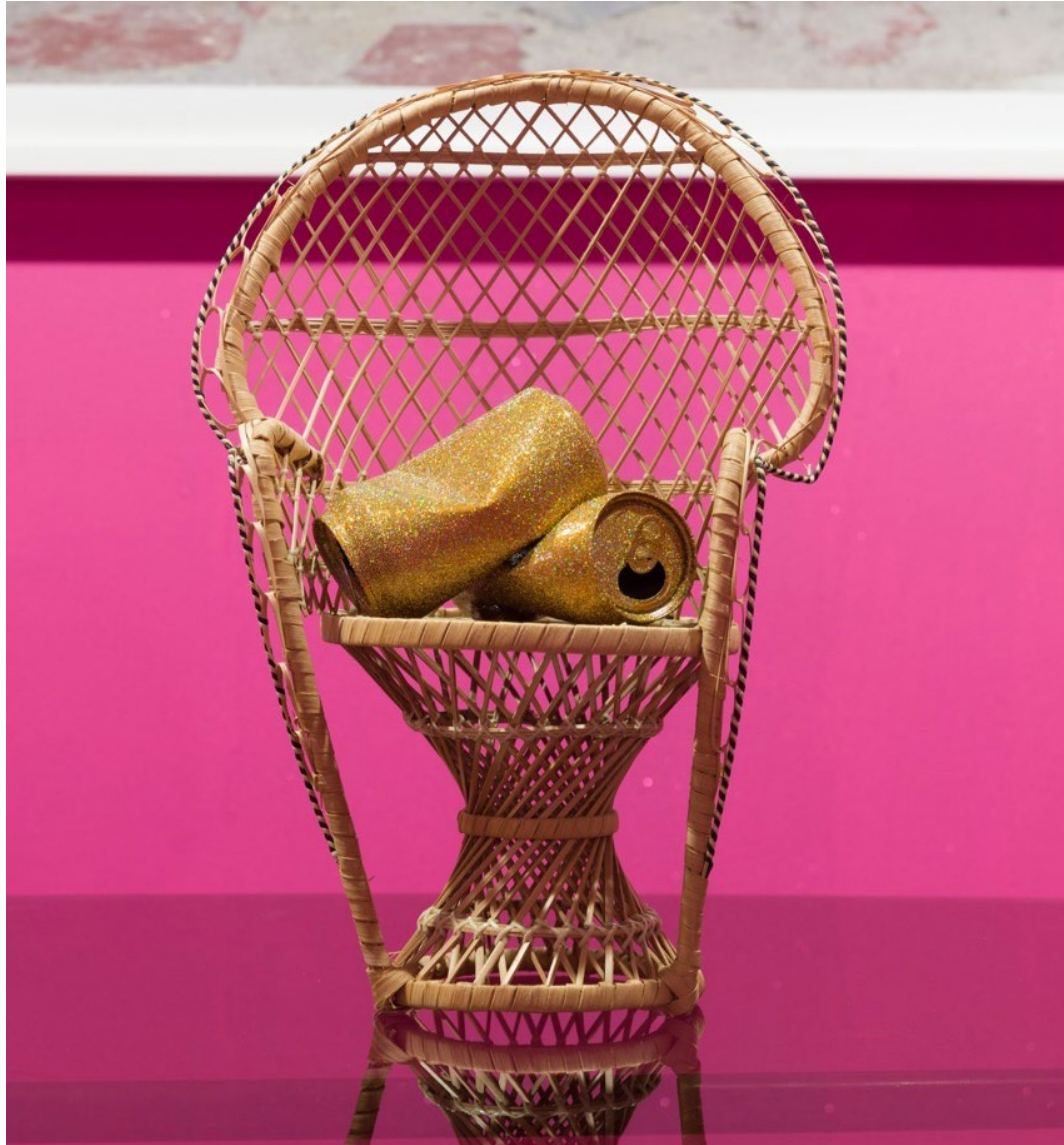
Untitled (Wicker Chair and cans) Metal flaked cans on found wicker doll chair Approx. 16 x 8 x 8 inches 2019