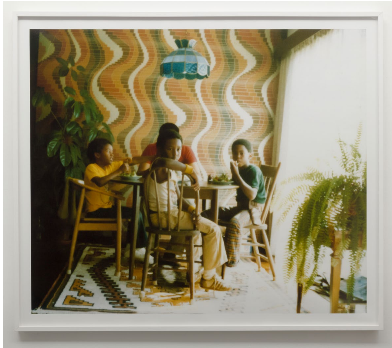
Untitled (Winfield St) Archival pigment print Paper: 55 x 64 in Framed: 56.75 x 65.75 in Edition of 3 2018