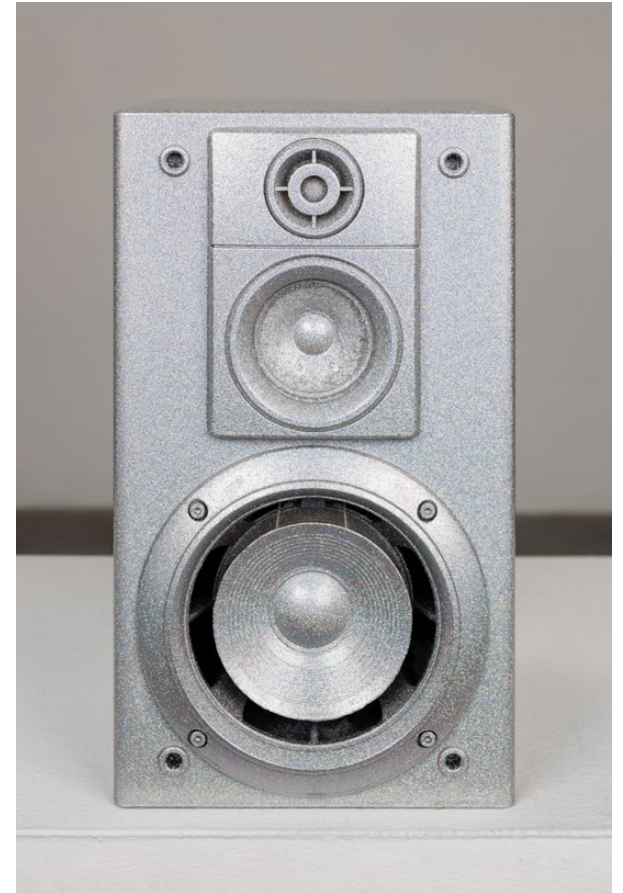
Untitled (Small Silver Speaker) Silver metalflake on found speaker Approx. 15 x 11 x 9 inches 2019