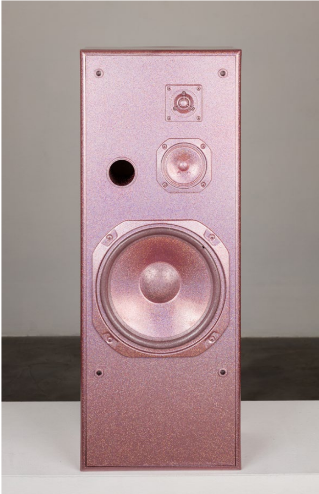
Untitled (Large Pink Speaker 1) Pink metalflake on found speaker Approx. 32 x 14 x 10 inches 2019