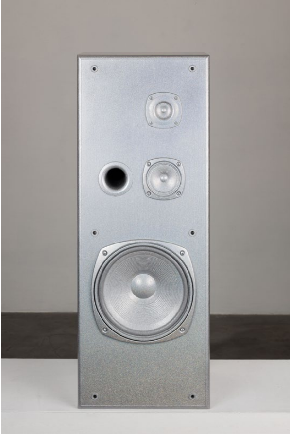
Untitled (Large Silver Speaker) Silver metal flake on found speaker Approx. 36 x 12 x 10 inches 2019