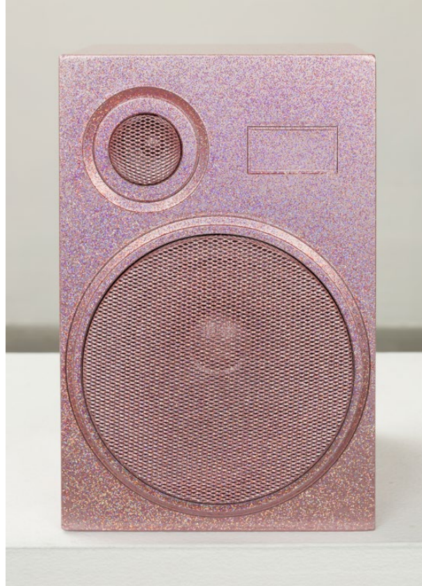
Untitled (Small Pink Speaker 1) Pink metalflake on found speaker Approx. 14 x 10 x 9 inches 2019