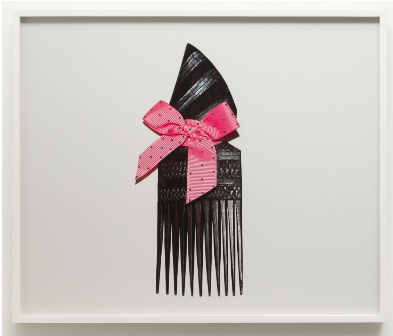
Untitled (Pick and bow) Archival pigment print and Swarovski crystals Paper: 37.5 x 45 in Framed: 38.5 x 46.5 in Unique 2019