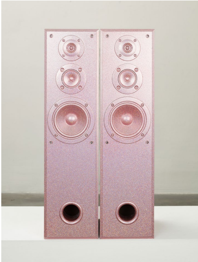
Untitled (Large Pink Speakers Set) Pink metal flake on found speakers Approx. 38 x 9 x 9 inches/each 2019