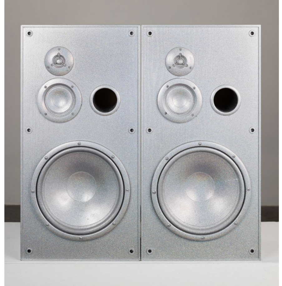
Untitled (Medium Silver Speakers Set) Silver metalflake on found speakers Approx. 18 x 9 x 7 inches/each 2019