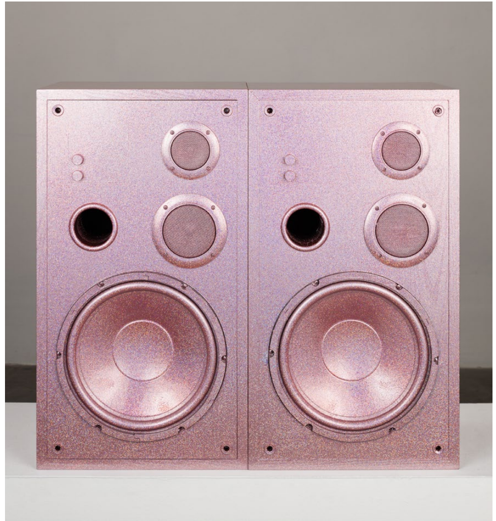
Untitled (Medium Pink Speakers Set) Pink metal flake on found speakers Approx. 24 x 11 x 9 inches/each 2019