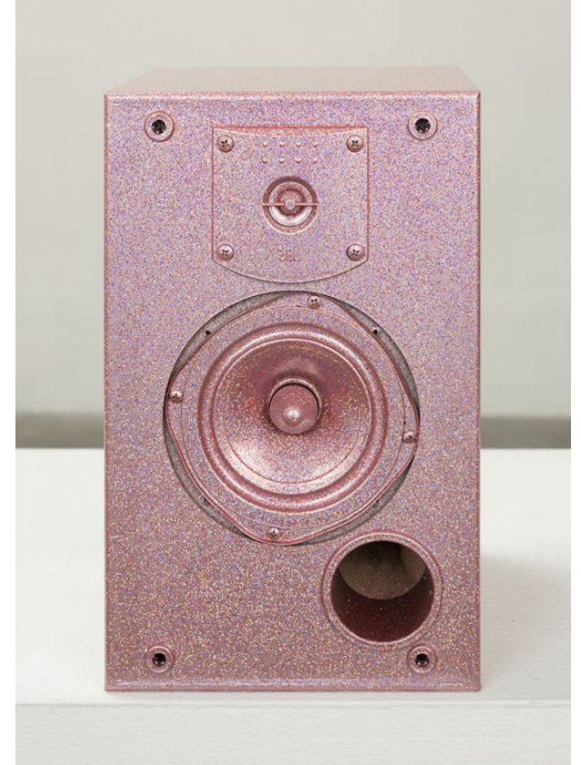
Untitled (Small Pink Speaker 2) Pink metalflake on found speaker Approx. 14 x 9 x 8 inches 2019