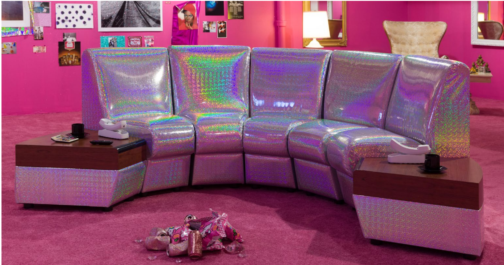
Untitled (Space Couch) Couch with holographic vinyl and side tables 103 x 60 x 37 inches 2018