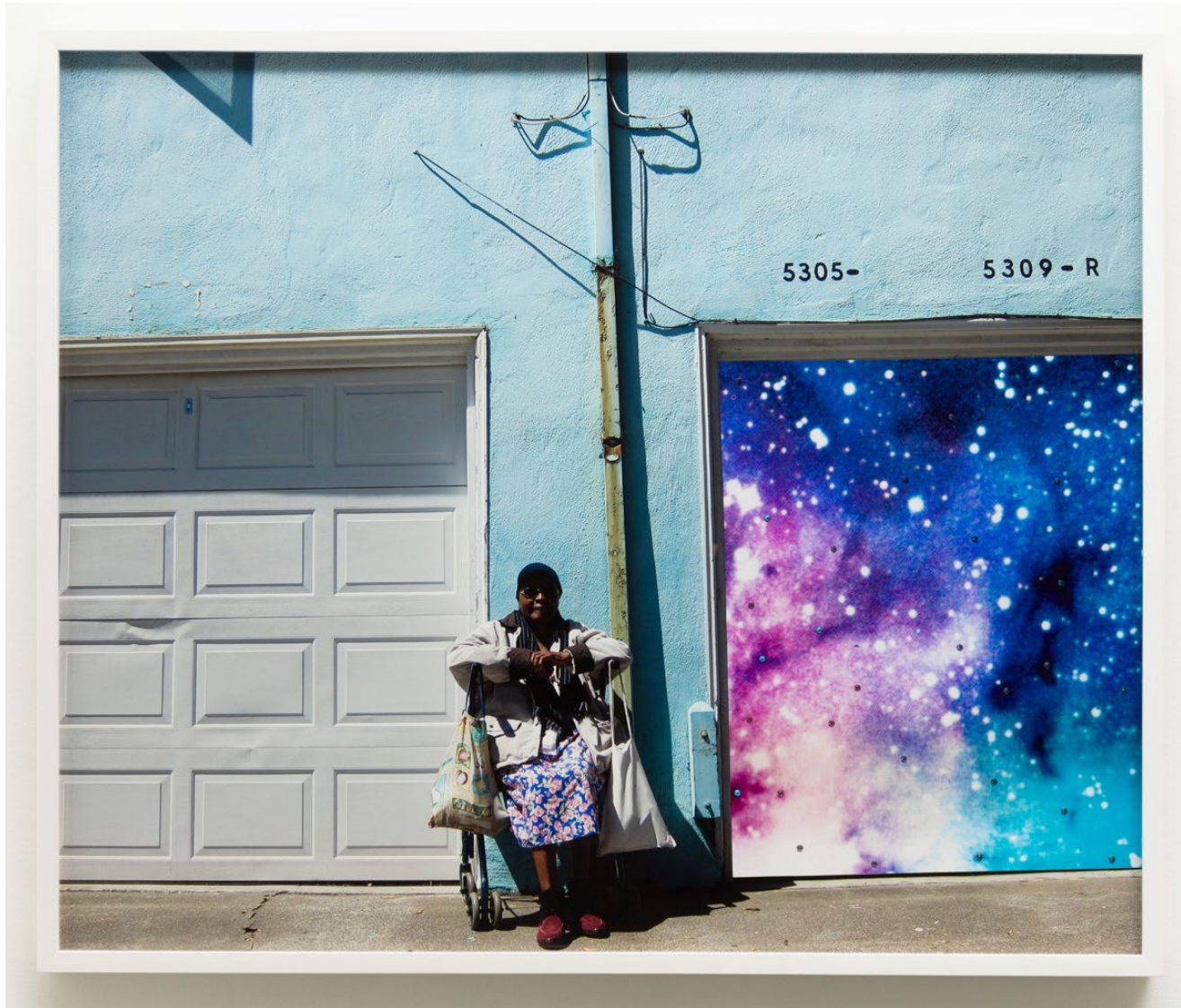
Untitled (Oakland lady, space) Archival pigment print and Swarovski crystals Paper: 37.5 x 45 in Framed: 38.5 x 46.5 in Unique 2019