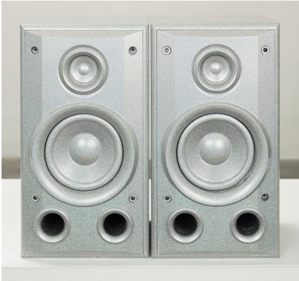
Untitled (Small Silver Speakers Set) Silver metalflake on found speakers Approx. 16 x 8 x 7 inches/each 2019