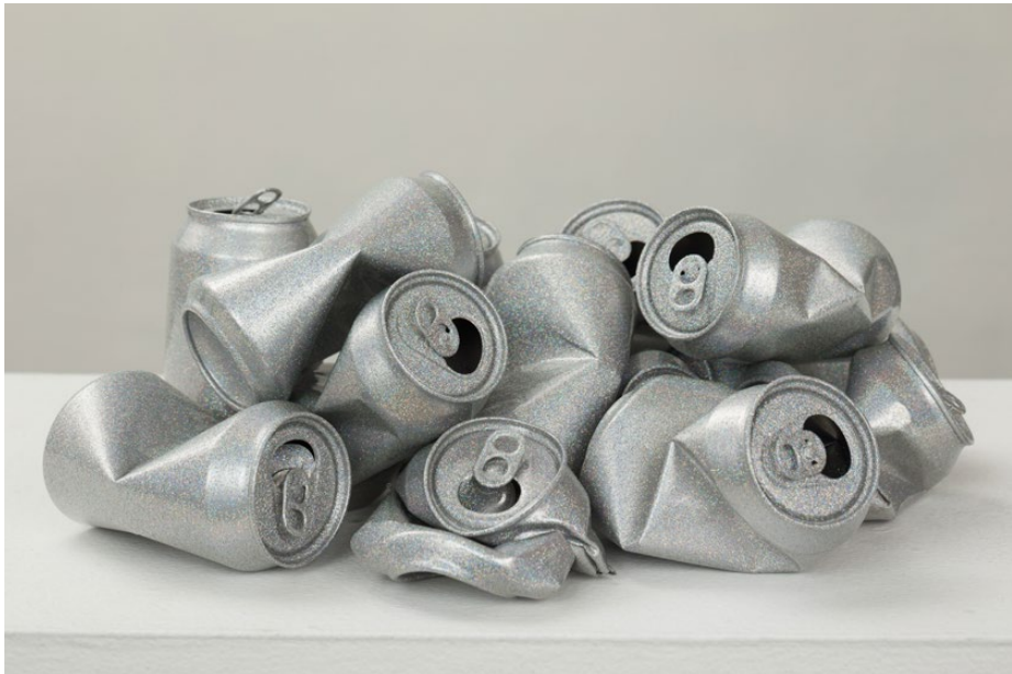
Untitled (Cans) Silver and pink metal flake on found cans Approx. 4.8 x 3 x 3 in / sizes vary 2018