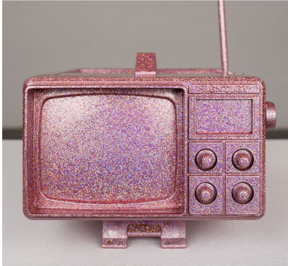
Untitled (Portable Television) Pink metal flake on found television Approx. 6 x 9 x 13 inches 2019