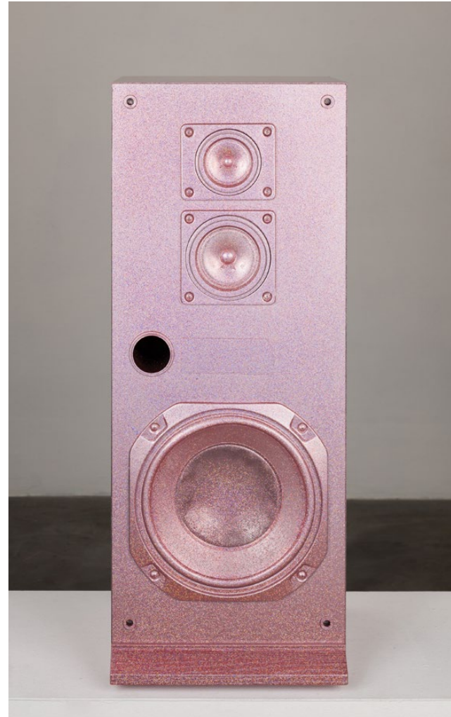
Untitled (Large Pink Speaker 2) Pink metalflake on found speaker Approx. 38 x 16 x 12 inches 2019