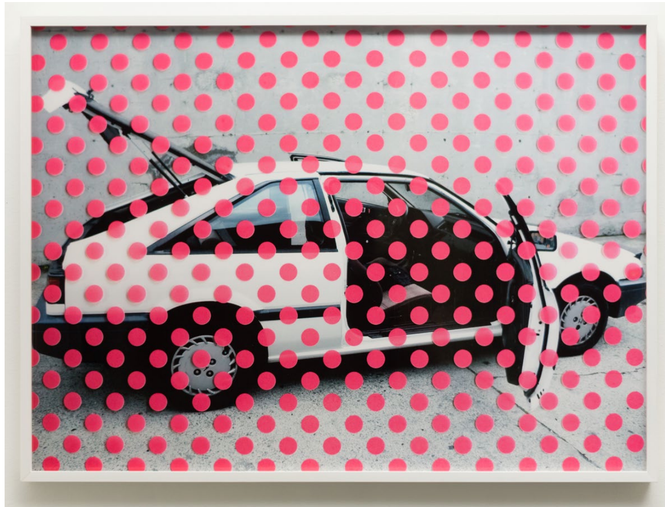
Untitled (Pink dots on car) Archival pigment print Paper: 37.5 x 51.5 in Framed: 38.5 x 53 in Edition of 3 2019