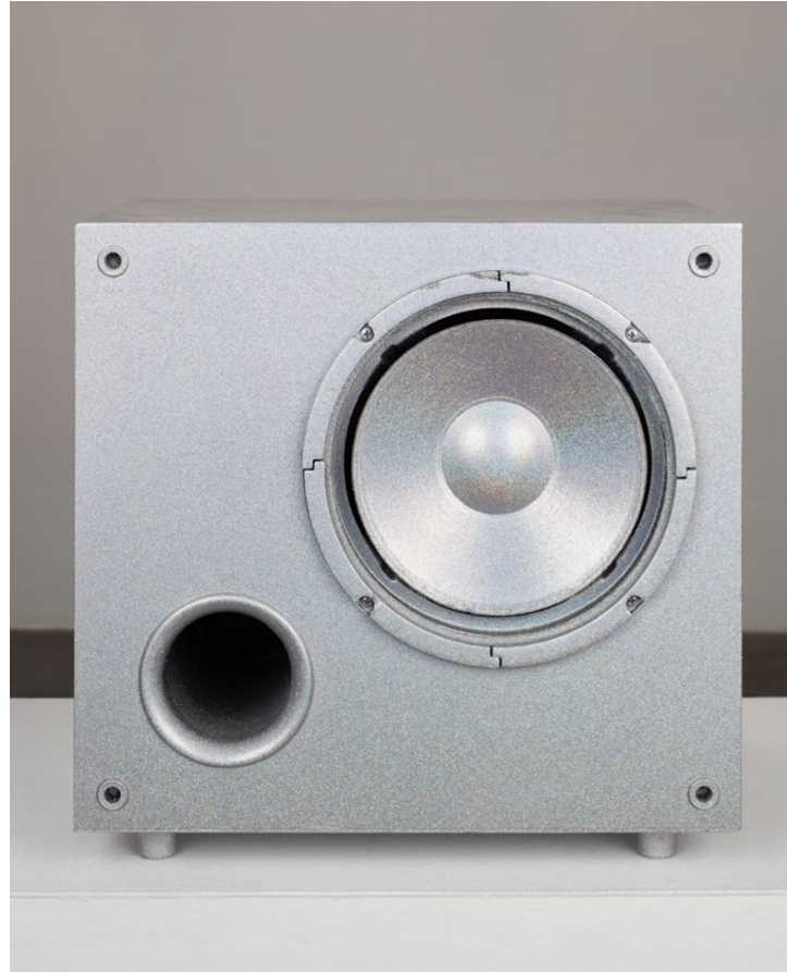
Untitled (Medium Silver Speaker) Silver metalflake on found speaker Approx. 20 x 24 x 18 inches 2019