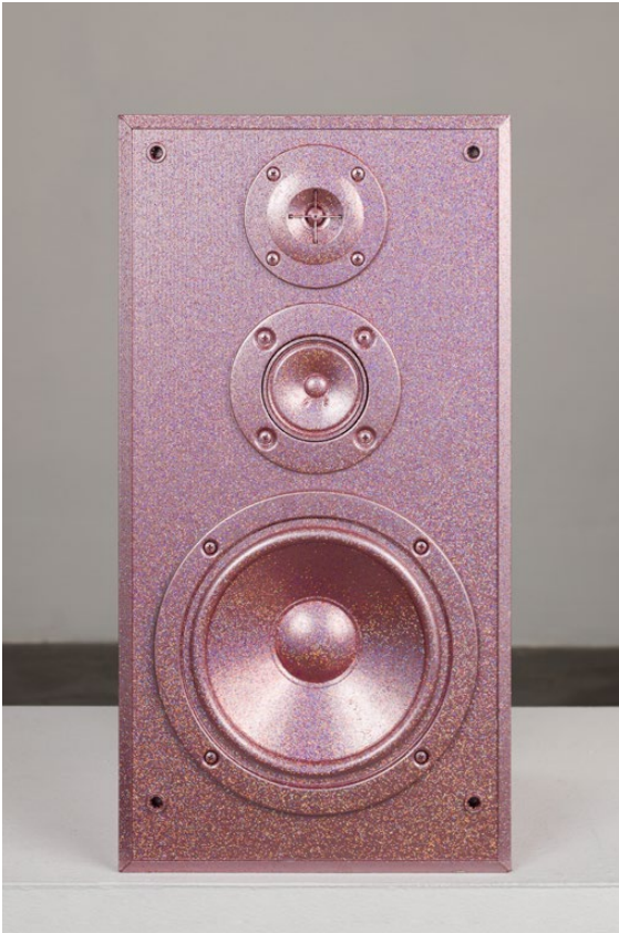
Untitled (Medium Pink Speaker) Pink metal flake on found speaker Approx. 20 x 9 x 9 inches 2019