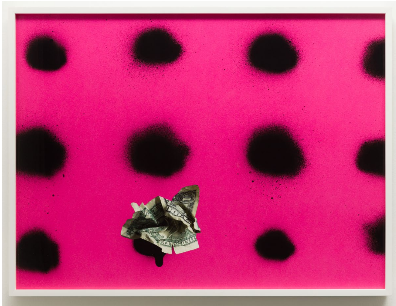
Untitled (Dollar on pink) Archival pigment print Paper: 37.5 x 50 in Framed: 38.5 x 51.5 in Edition of 3 2019