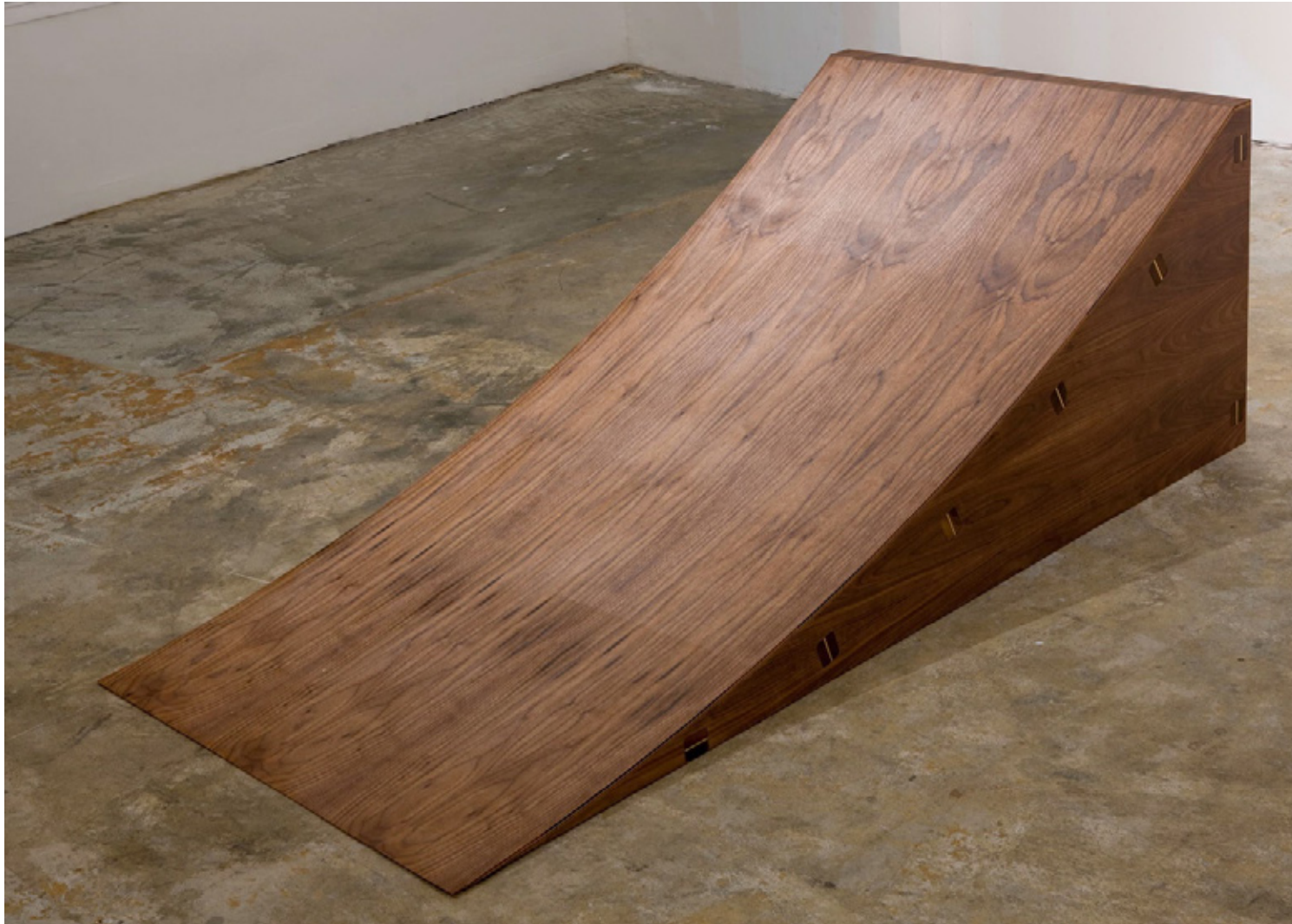
Walnut Skate Ramp, 2007, walnut, gold-plated steel 36" x 70" x 24"