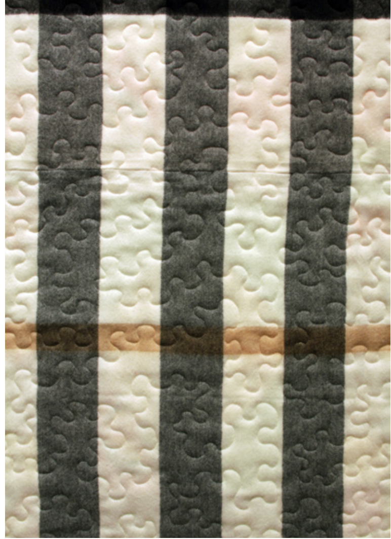
Fabricatio Desiderii, Installation at Charlie James Gallery, March 2012