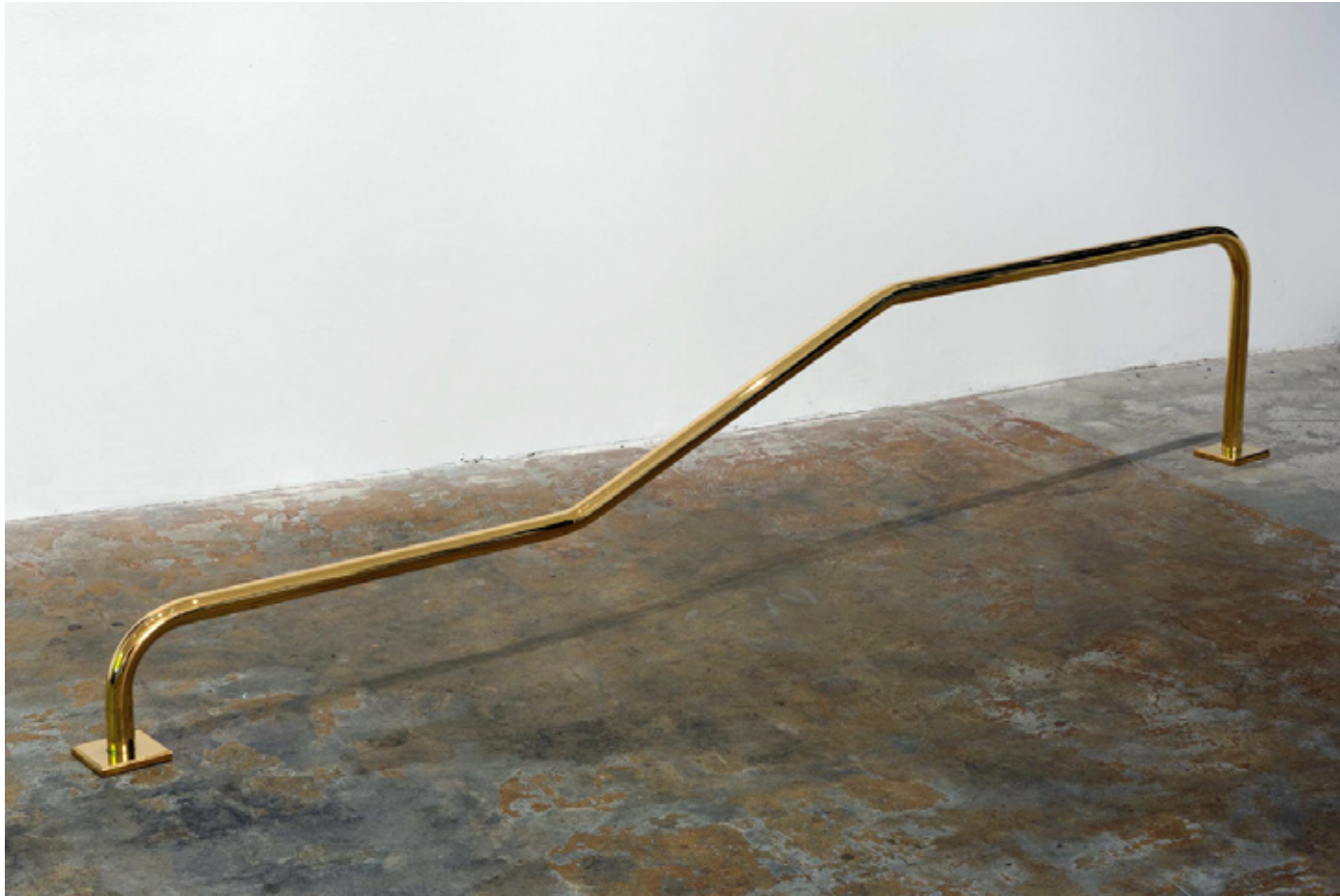
Gold-Plated Skate Rail, 2007, Edition of 3, Gold-plated steel 20" x 96" x 4"