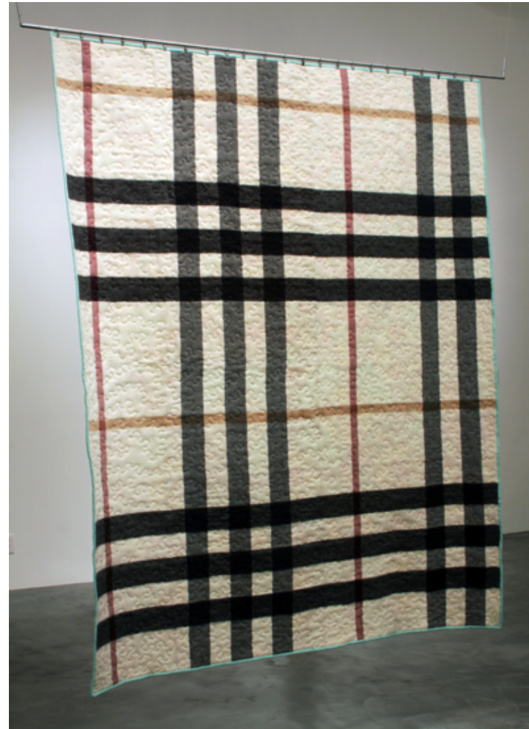
Counterpane, 2012, Hermès silk scarves, Tiffany silk, wool, and cashmere shawl, Gucci cotton shawl, Louis Vuitton silk scarf, Louis Vuitton silk and wool shawl, Burberry cashmere blankets, wool batting, thread 83 x 65 inches