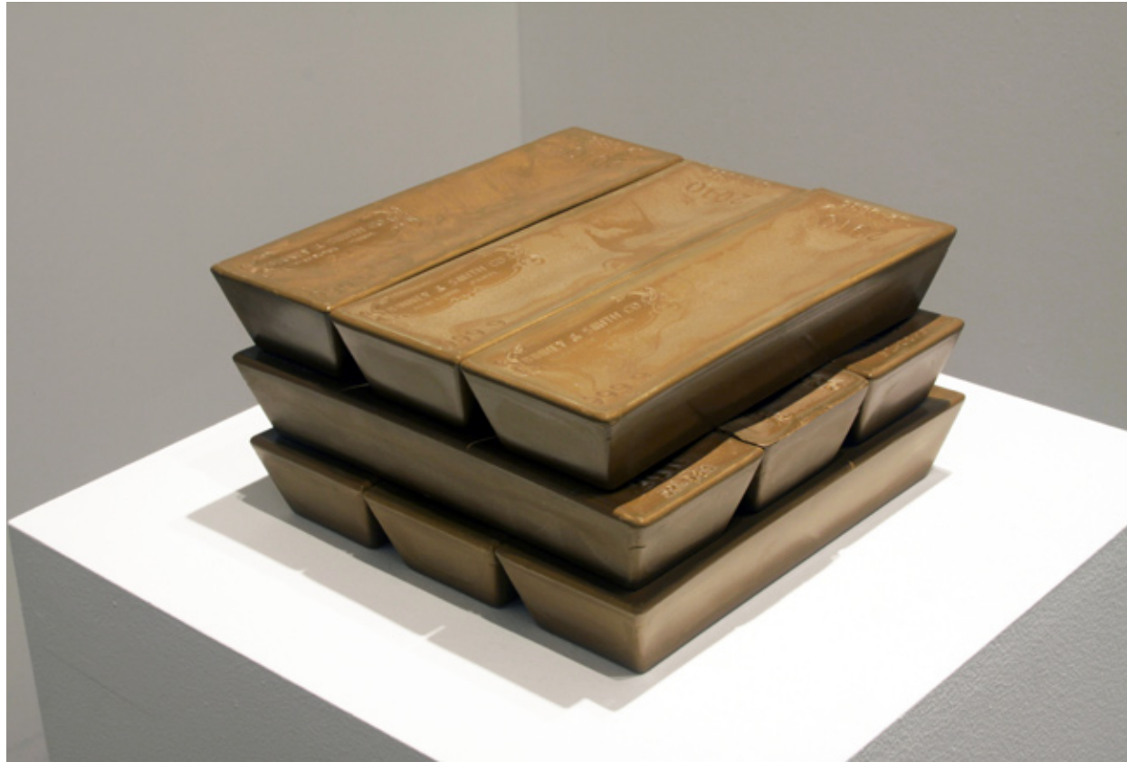
Gold oro or, 2010, Edition of 5 (9 bar installation), Gold Crayola crayon, 9.5" x 3" x 1.5" per bar, installation variable