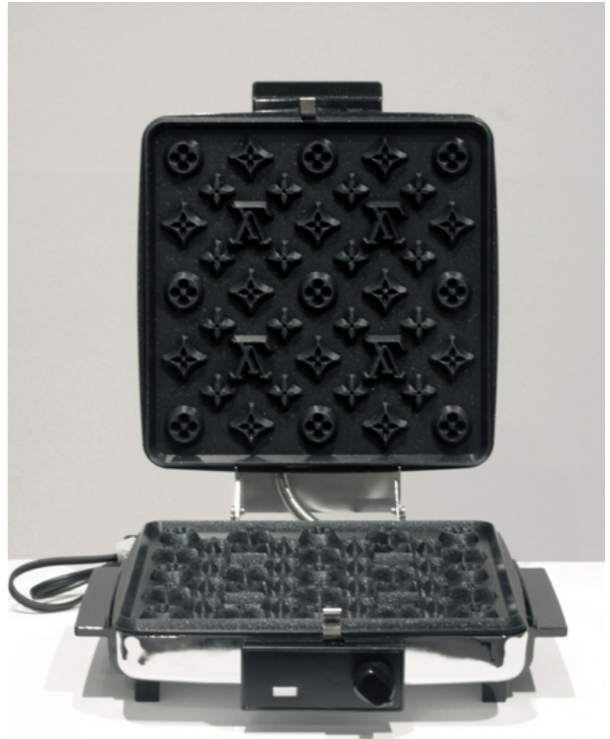
Louis Vuitton Waffle Maker, 2012, Edition of 3, Teflon coated aluminum, enamel on aluminum sheet, generic waffle maker parts, 14 x 11.5 x 13.5 inches