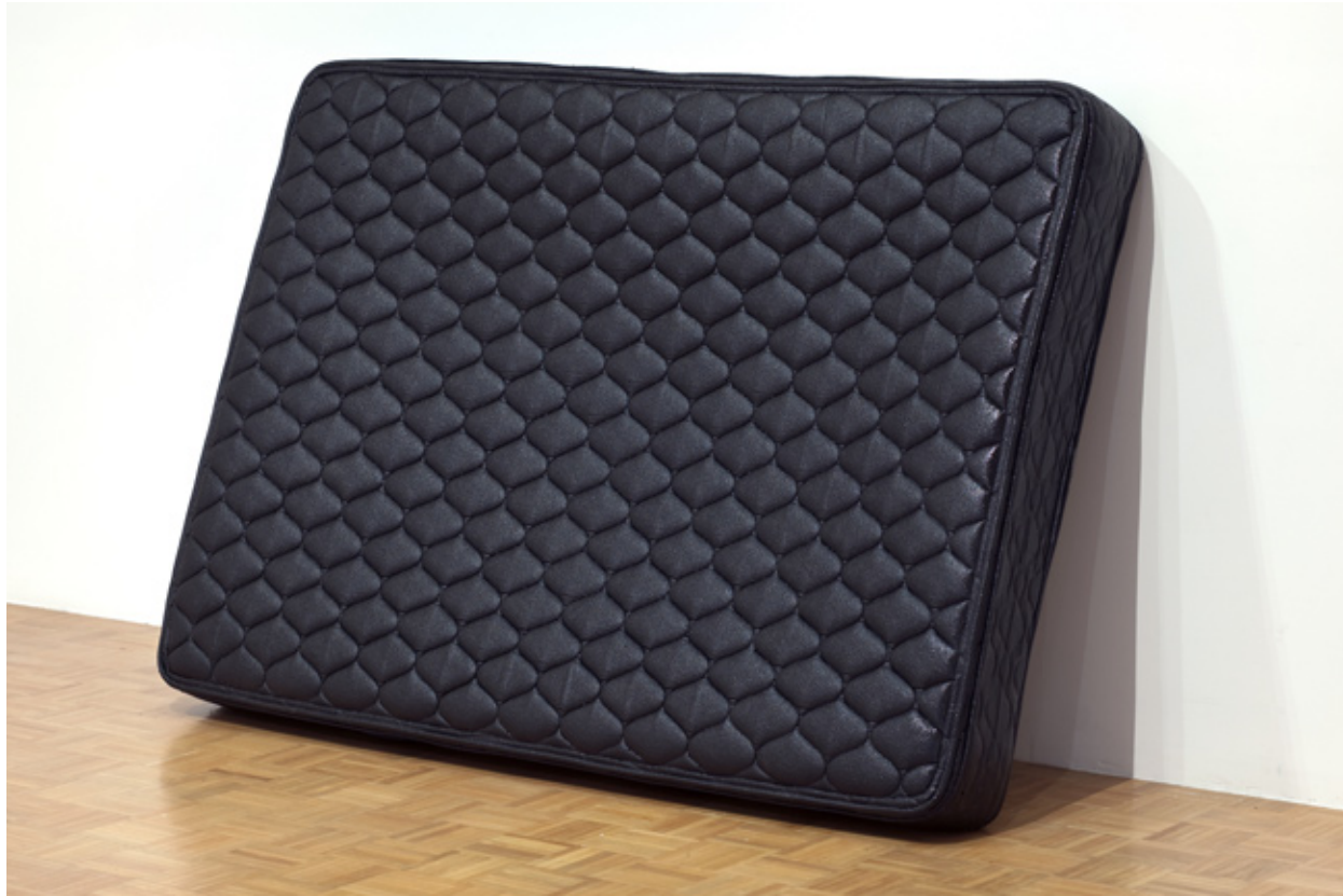
One Liner, 2010, mattress, Line-X truck bed-liner, 75" x 53" x 9.5"