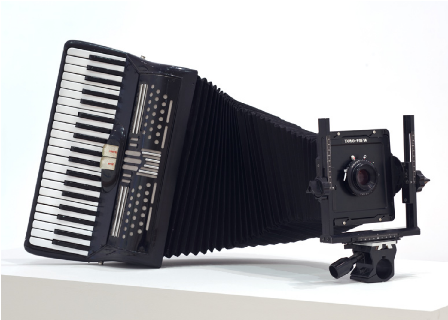
Accordion Obscura, 2010, accordion treble keyboard, bellows, 4x5 camera front standard dimensions variable