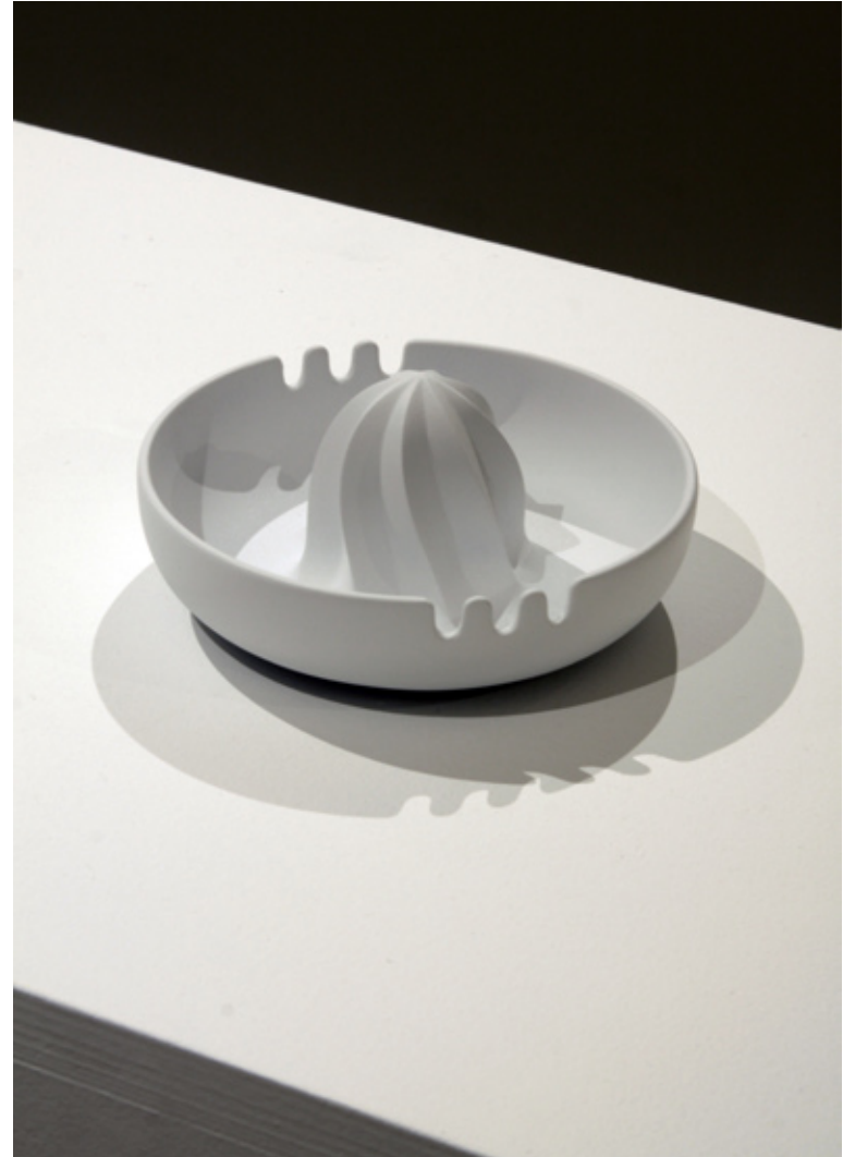
Petit Dejeuner, 2008, Edition of 5, Enamel on plaster, 5" x 5" x 2.25"