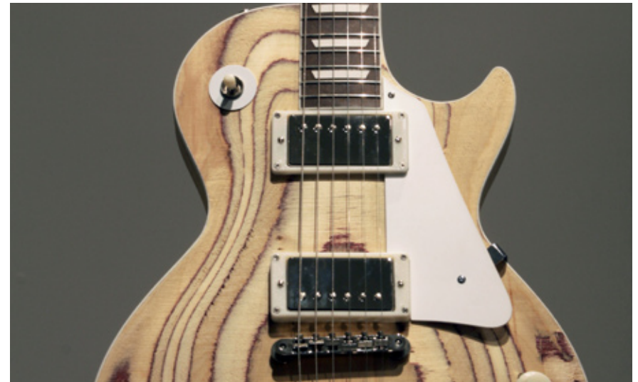
Fabricatio Desiderii, Installation at Charlie James Gallery, March 2012