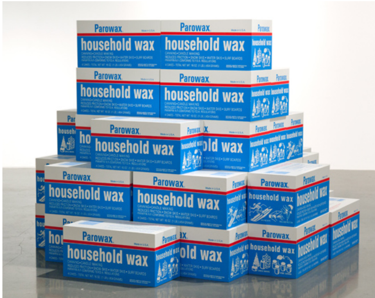
Parowax Boxes, 2010, Edition of 50, Screen-printed ink, painted MDF, 9.5" x 19.5" x 9.5"/each, Installation variable