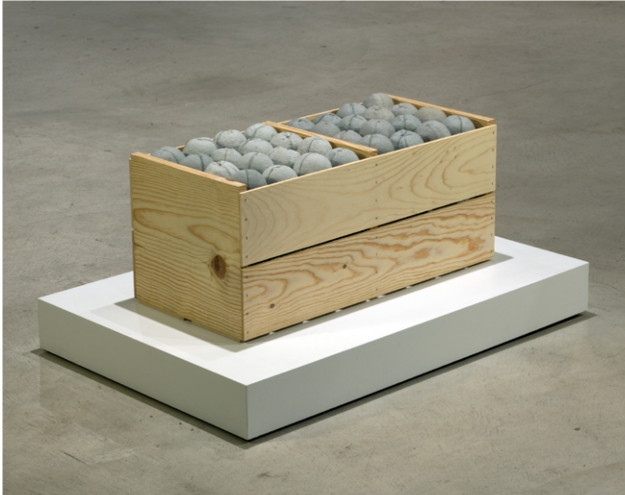
Concrete Oranges, 2010, Edition of 3, Concrete, pine, 12.5" x 26.25" x 11.25"