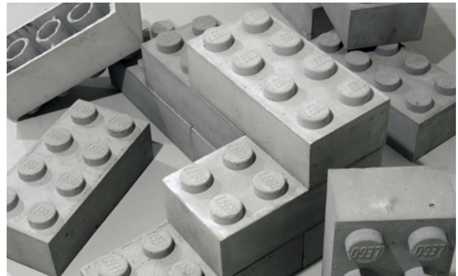
Fabricatio Desiderii, Installation at Charlie James Gallery, March 2012