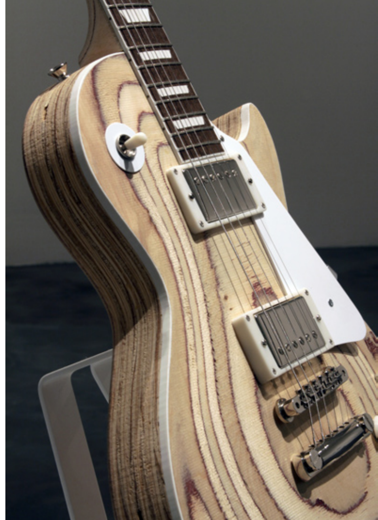
Less Paul, 2012, Baltic birch plywood, CDX plywood, hardboard, MDF, polystyrene, ABS, steel, generic guitar parts, 38 x 16 x 12 inches