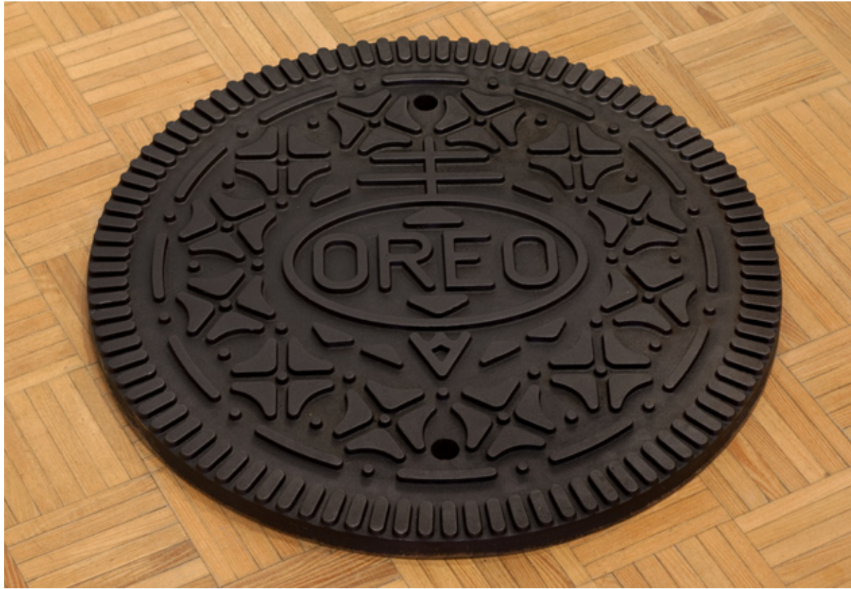
Oreo Manhole Cover, 2010, Edition of 3, Cast iron 28" x 28" x 1.25"