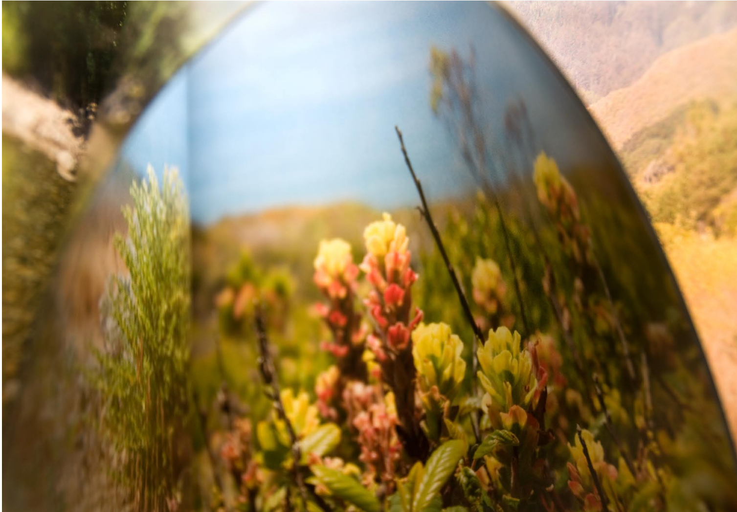
Indian Paintbrush , 2014. Pigment print on Hahnemuhle paper, 30" x 43", edition of 3