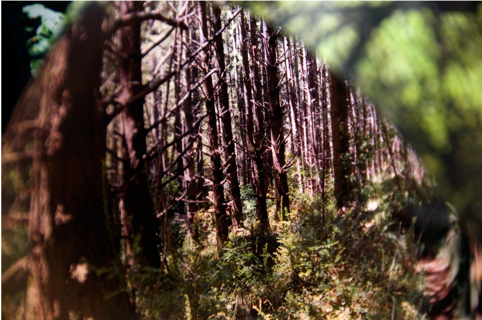
Forest , 2014. Pigment print on Hahnemuhle paper, 23" x 35," edition of 3