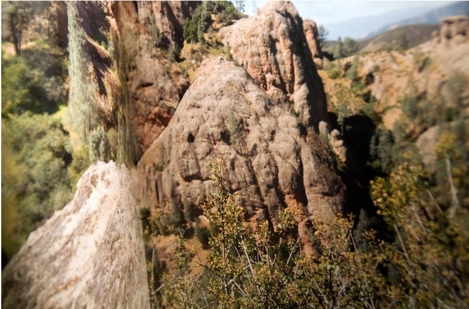
Pinnacle , 2014. Pigment print on Hahnemuhle paper, 23" x 35," edition of 3