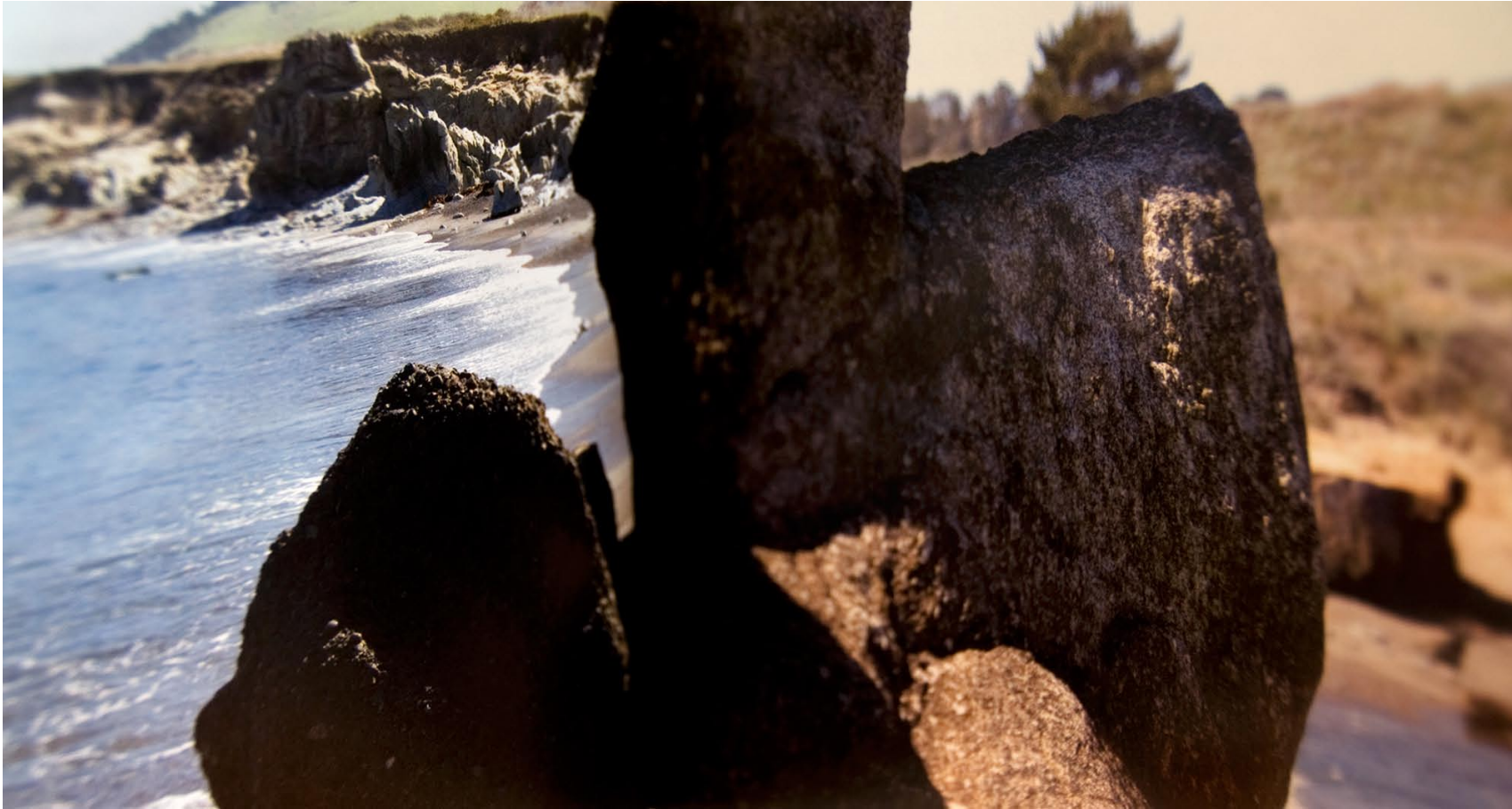
Black Rocks , 2014. Pigment print on Hahnemuhle paper, 30" x 56," edition of 3