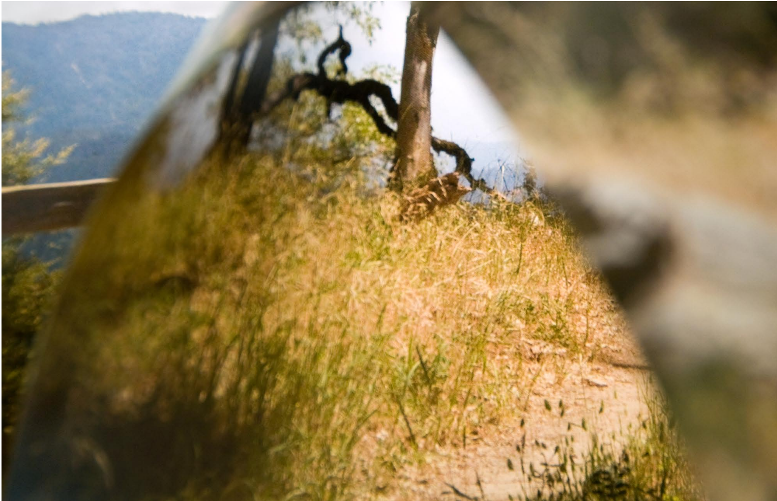
Golden Grasses , 2014. Pigment print on Hahnemuhle paper, 30" x 46," edition of 3