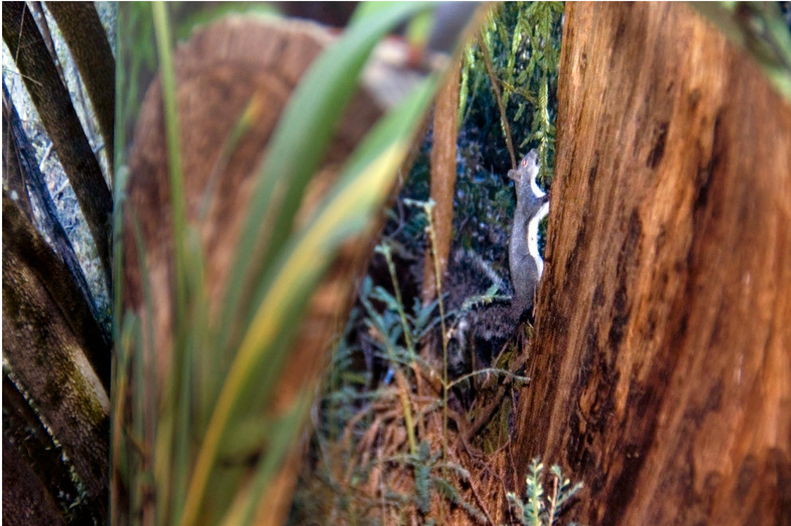
Squirrel , 2014. Pigment print on Hahnemuhle paper, 11" x 16 ½", edition of 3