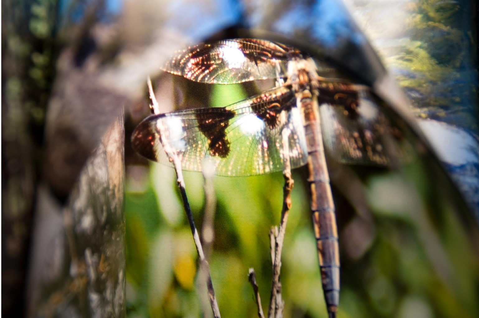
Dragonfly , 2014. Pigment print on Hahnemuhle paper, 11" x 16 ½", edition of 3