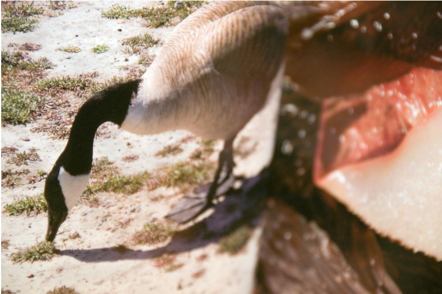
Goose , 2014. Pigment print on Hahnemuhle paper, 11" x 16 ½", edition of 3