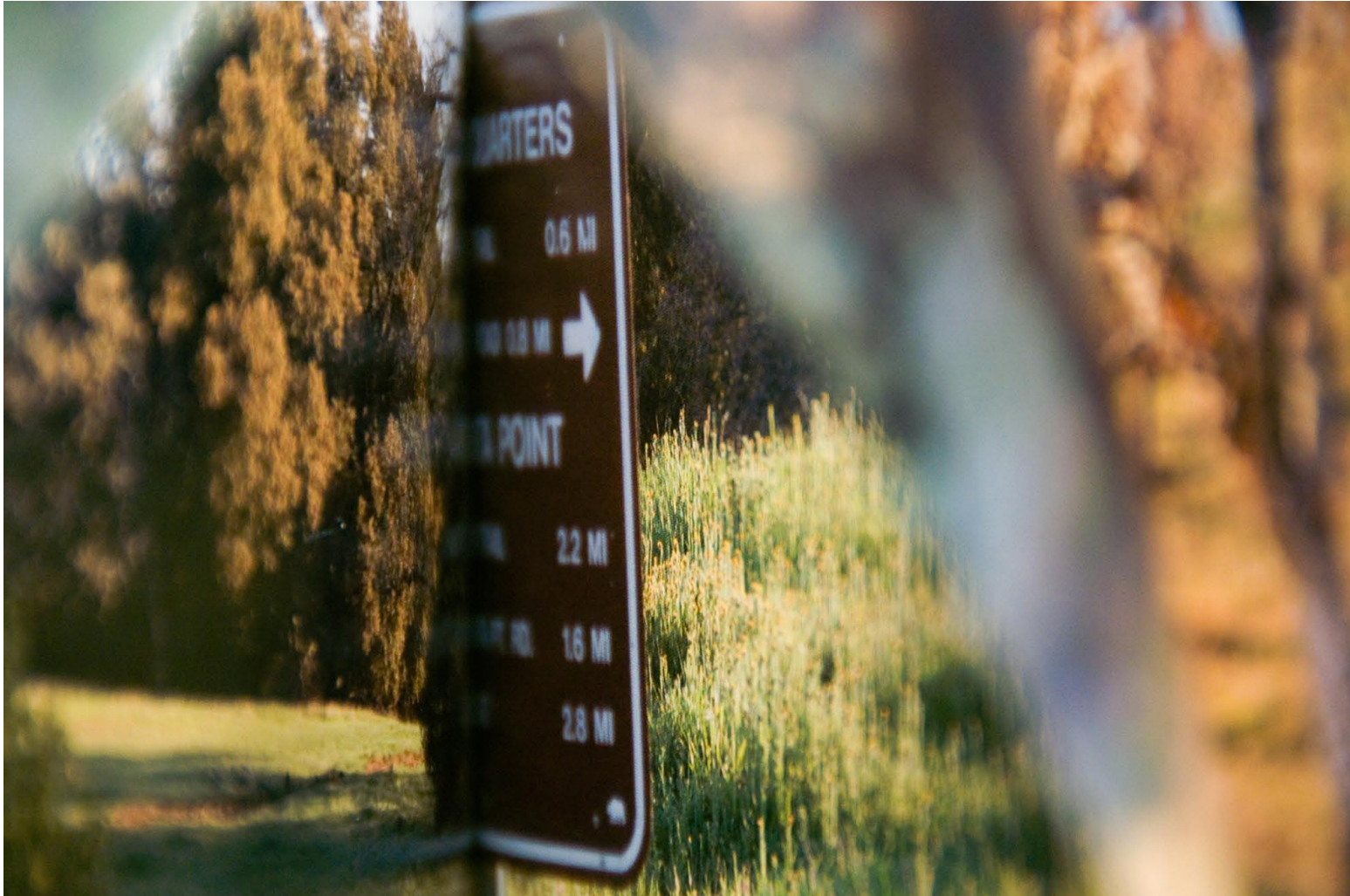
Trail Sign , 2014. Pigment print on Hahnemuhle paper, 23" x 35," edition of 3