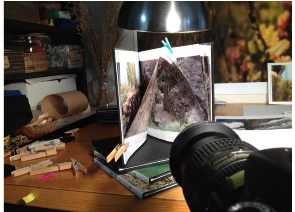
A photograph of Carol's process for the work in “Outdoor World”

The defamiliarization of the landscape induces a pleasant sense of consternation and further questioning of the images. Selter offers the viewer delight at seeing the world in novel fashion, in solving the enigma of the imagery. At the same time, by making non-traditional landscape photographs, Selter joins other contemporary photographers to extend our idea of what such a photograph can be.