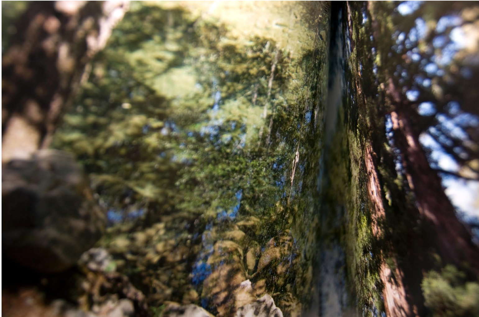
Reflection , 2014. Pigment print on Hahnemuhle paper, 23" x 35," edition of 3