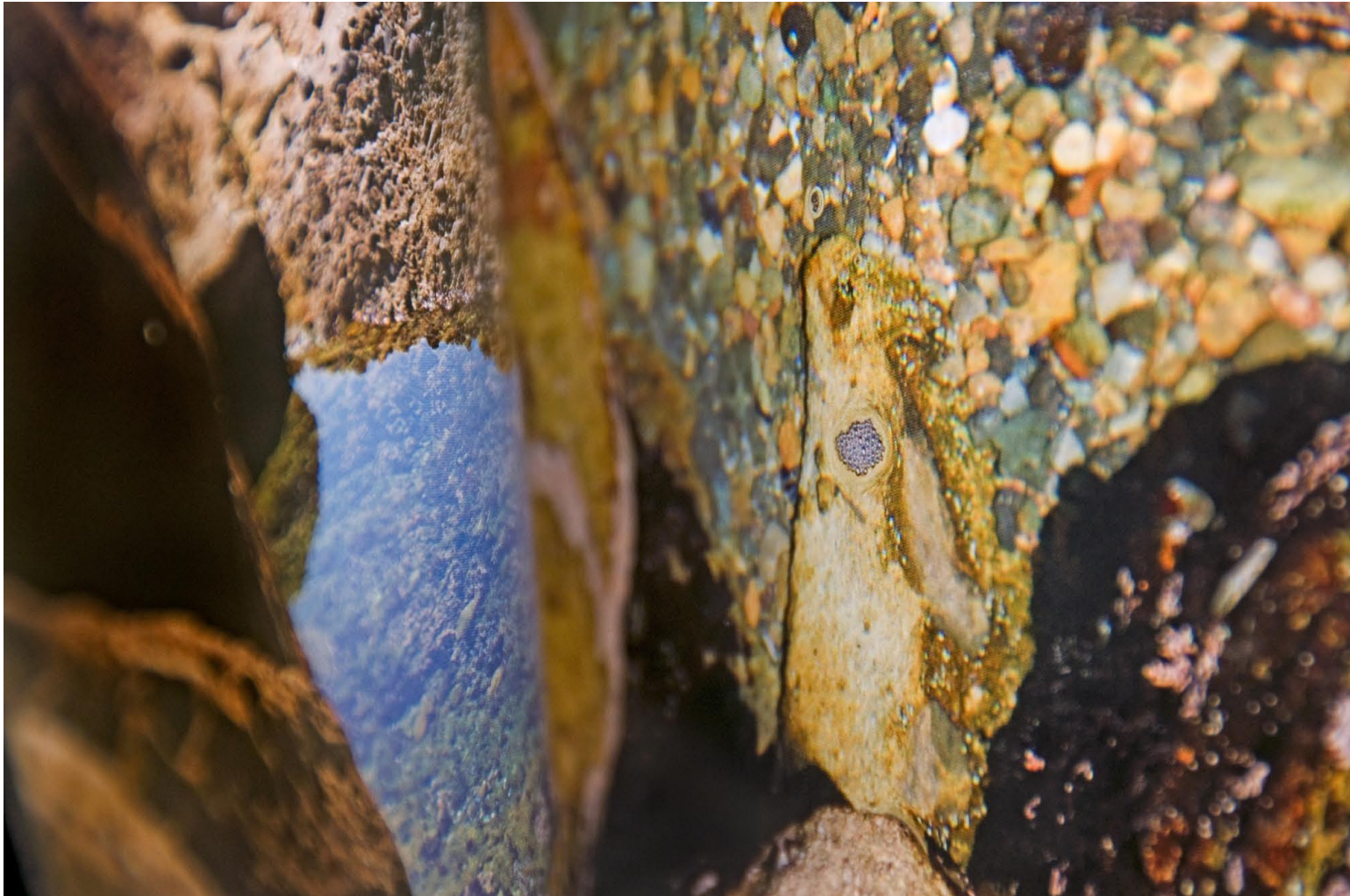
Tide Pool , 2014. Pigment print on Hahnemuhle paper, 11" x 16 ½", edition of 3