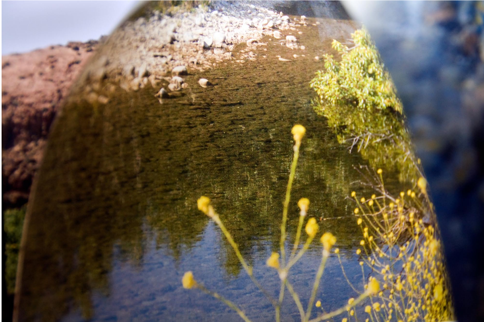
Mustard , 2014. Pigment print on Hahnemuhle paper, 30" x 45," edition of 3