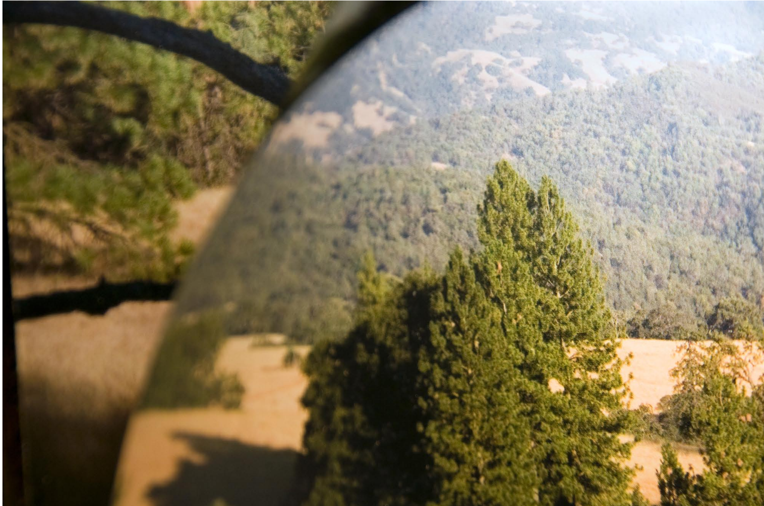
Ponderosa Pines , 2014. Pigment print on Hahnemuhle paper, 30" x 45," edition of 3