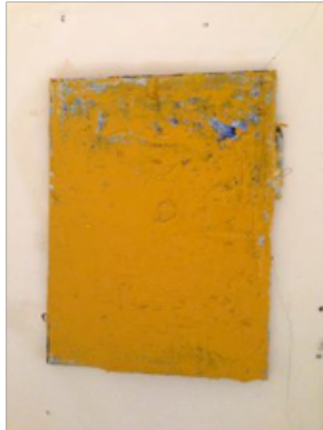
Amy Green Untitled 2014 layers of felt and enamel paint 9" x 12"