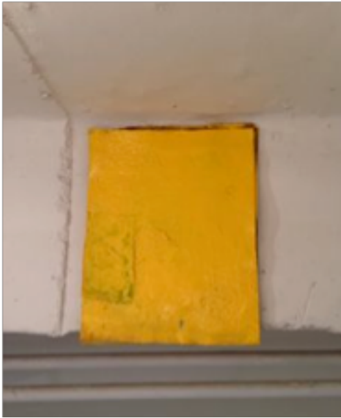
Amy Green Yellow with Fabric Scrap 2014 layers of felt, fabric and enamel paint 9" x 12"