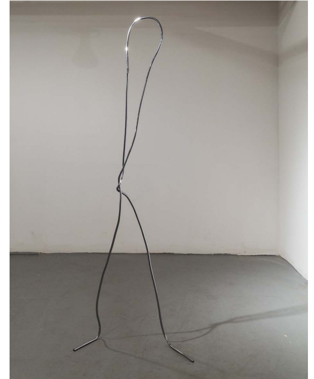
Joshua Callaghan Paperclip Figure #6 2013 Nickle-plated steel 61" x 23" x 9"