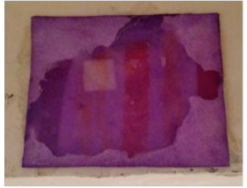
Amy Green Purple Pour with Square 2014 felt, fabric and urethane rubber 9" x 12"