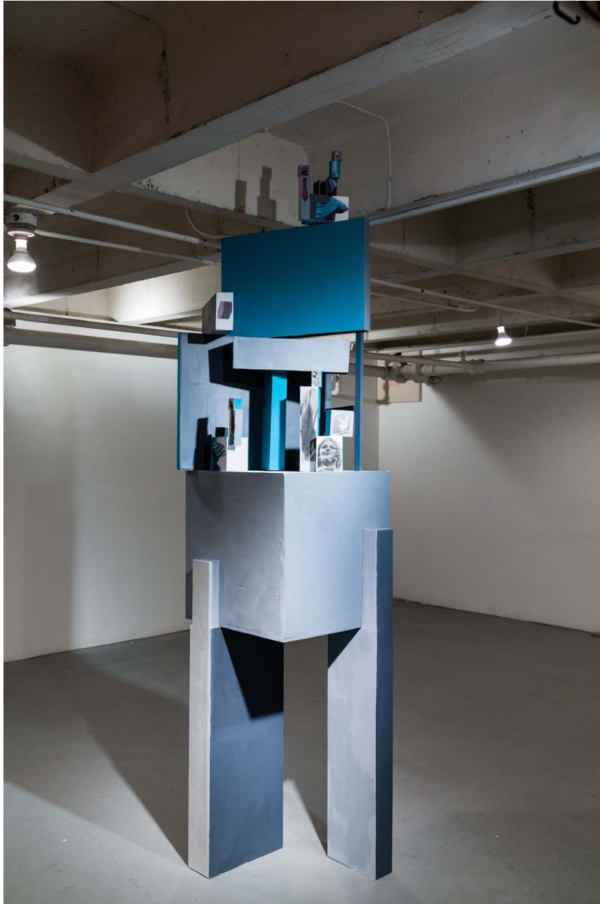
Kristi Lippire Defiance Ave. 2014 Foam, chipboard, acrylic paint, wood, and collage 90" x 19" x 19"