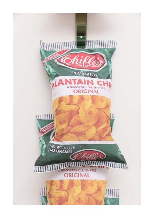
Rack: Platanitos Digital print on brushed nylon, foam, and powder coated aluminum 96 x 12 x 7 inches 2019